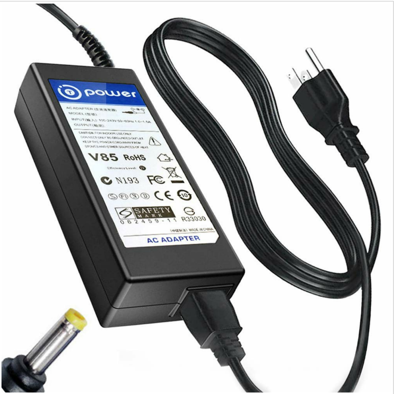
Image: The T-Power 19V AC/DC Adapter Charger connected to its power cord, ready for use.