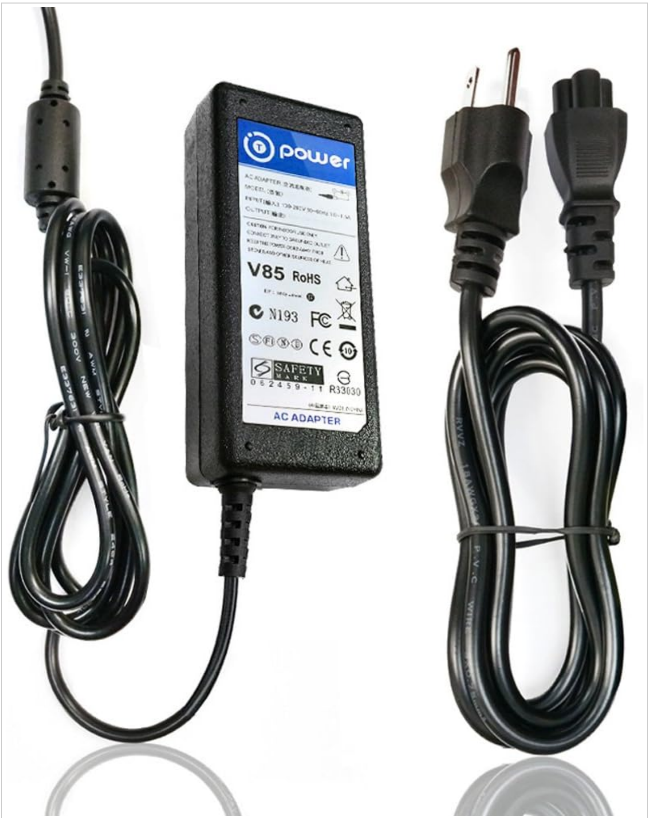
Image: The T-Power 19V AC/DC Adapter Charger shown alongside its detachable power cord.