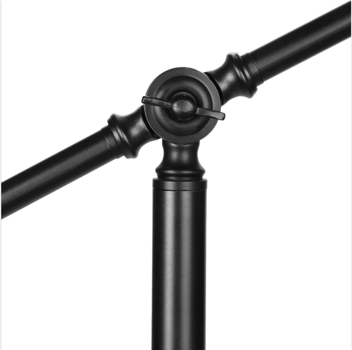
Image 2: Detail of the adjustable joint on the lamp's pole, which allows for height and angle adjustments of the arc arm.