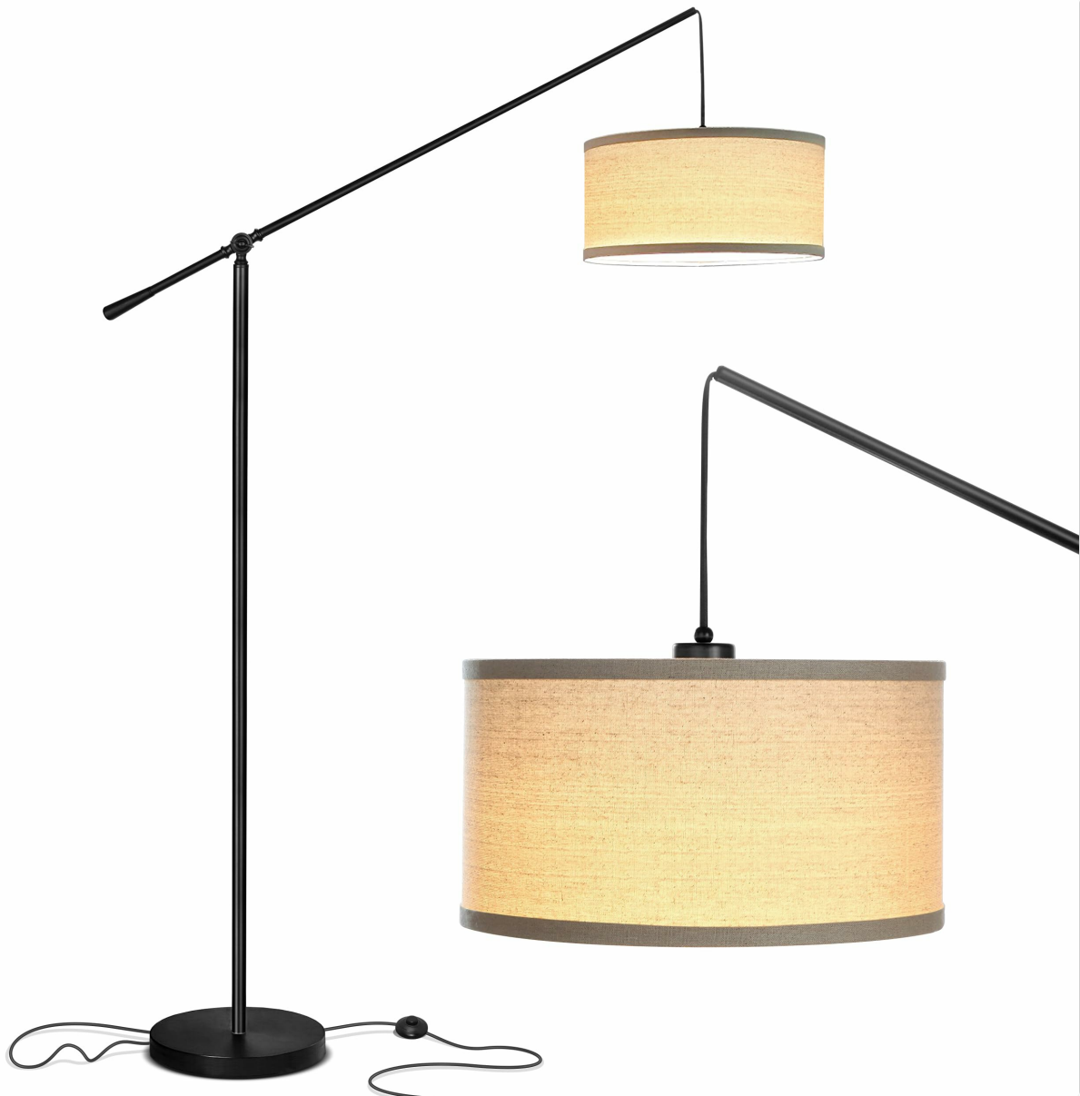
Image 1: The Brightech Hudson 2 LED Floor Lamp in Jet Black, showcasing its arc design and linen shade.