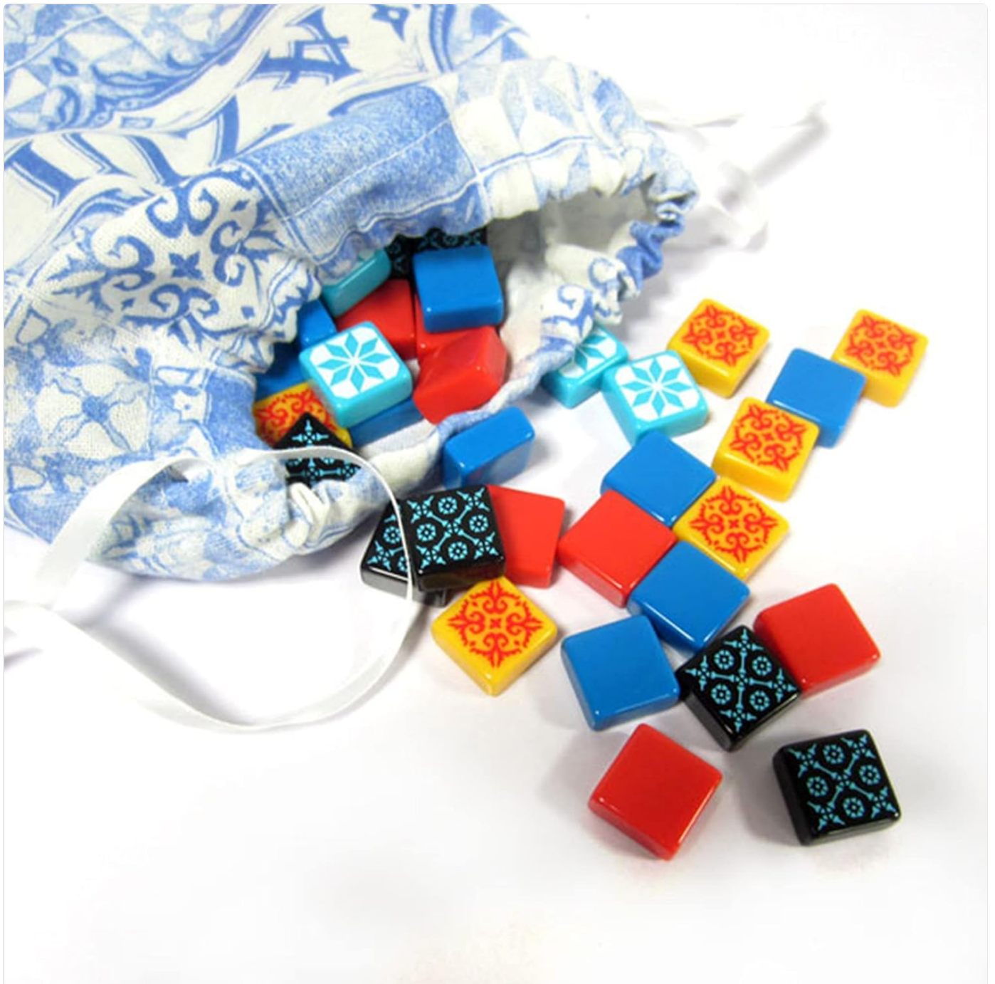
Image: A close-up of the decorative linen bag with various colored resin tiles, showcasing their vibrant appearance and unique patterns.