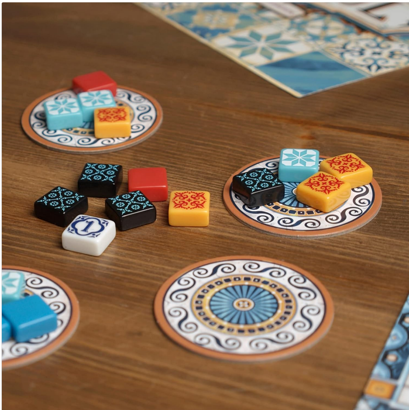
Image: A top-down view of the game setup, with factory displays arranged in a circle, each holding four colorful tiles, and a player board in the foreground.