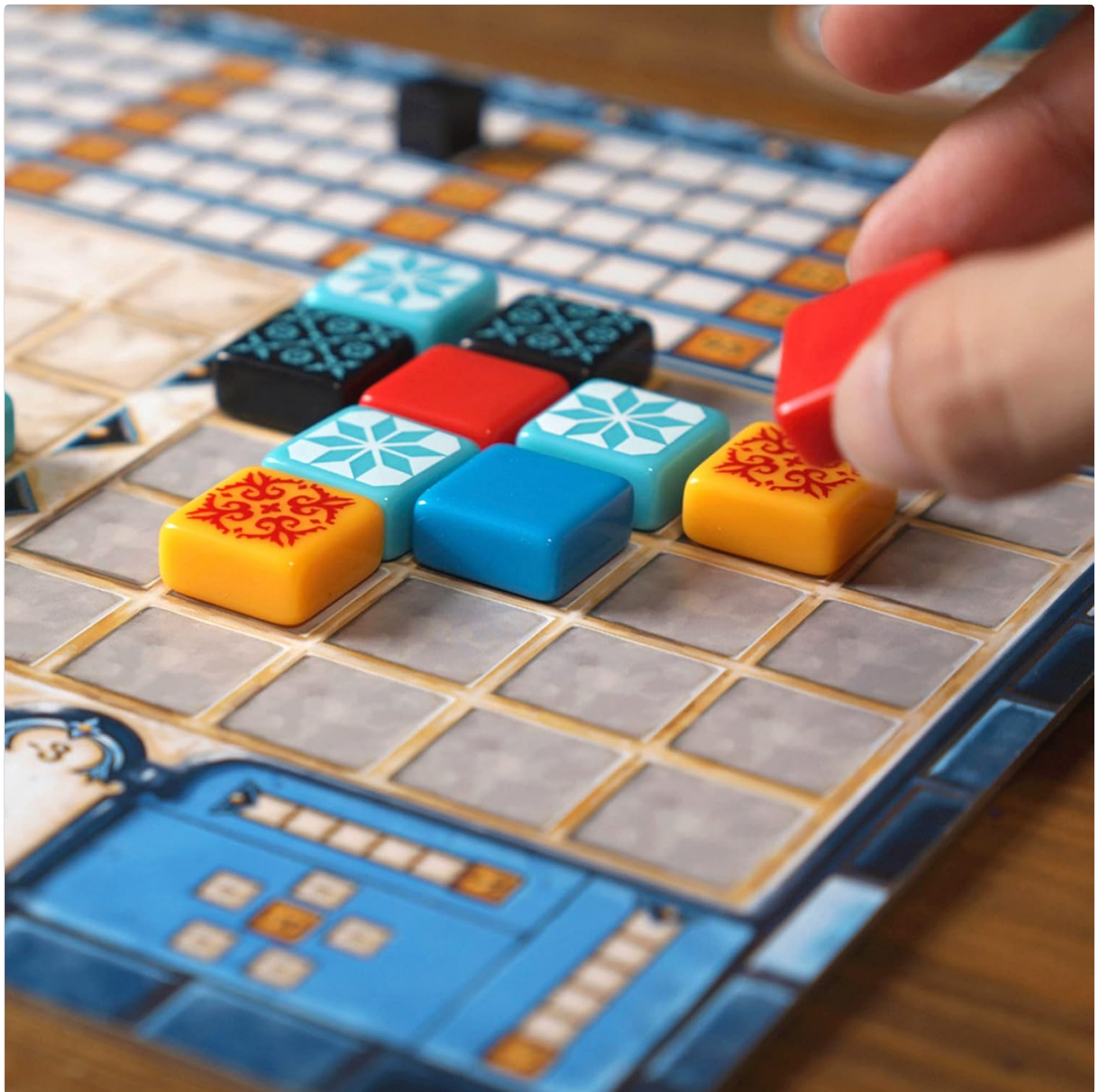
Image: A single player board, showing the pattern lines on the left, the mosaic wall on the right, and the scoring track at the top.