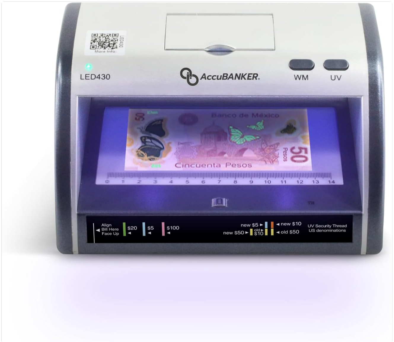
Figure 2: AccuBANKER LED430 verifying a Mexican Peso banknote.