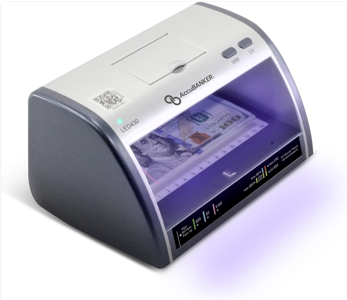
Figure 1: AccuBANKER LED430 Counterfeit Detector, front view with a US $100 bill under UV light.