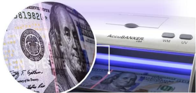
Figure 4: The LED430's powerful UV LEDs can verify security features on various documents, including driver's licenses, credit cards, and passports.