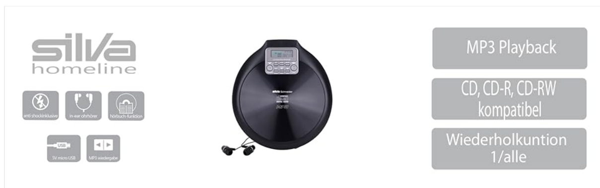
Image 5.1: Overview of the Silva Schneider MCD 50 features, including MP3 playback, CD compatibility, and repeat functions.

The player supports an audiobook function, allowing for seamless playback of audiobooks. Specific controls for this function may be indicated on the display or through dedicated buttons (e.g., RESUME).