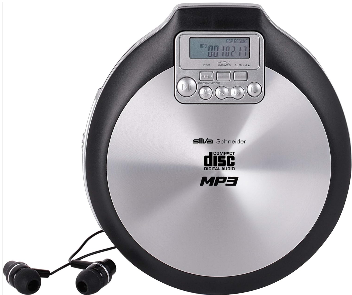
Image 1.1: Front view of the Silva Schneider MCD 50 Portable CD Player, showing the display, control buttons, and included in-ear headphones.