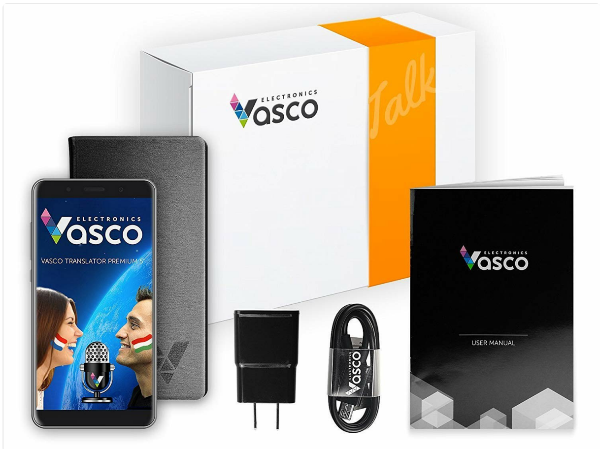
Figure 1: Vasco Translator Premium 5" device overview.