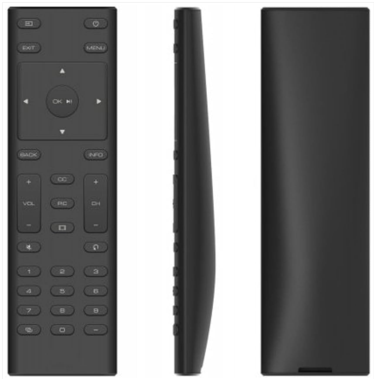
Image: Smartby XRT135 Remote Control.

Compatible Vizio HDTV Models: P55-E1, P60-E1, P65-E1, M70-E3, P75-E1, M55E1, M55E0, M65E0, D32HN-E1.