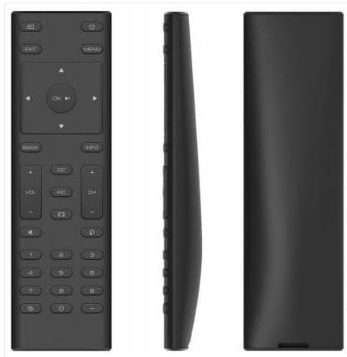
Image: Side view of the remote, indicating the battery compartment location.