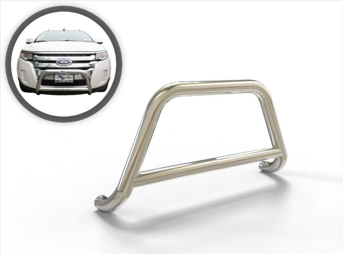
This image displays the VANGUARD VGUBG-0979SS Stainless Steel Classic Sport Bar. The main view shows the polished