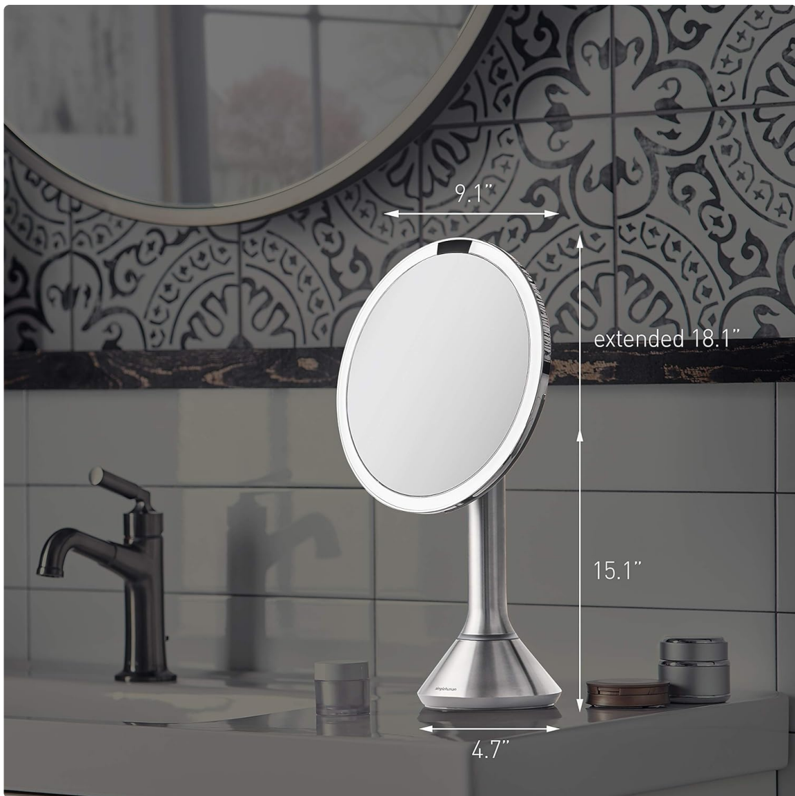
Image: Detailed dimensions of the simplehuman 8-inch Round Sensor Makeup Mirror.