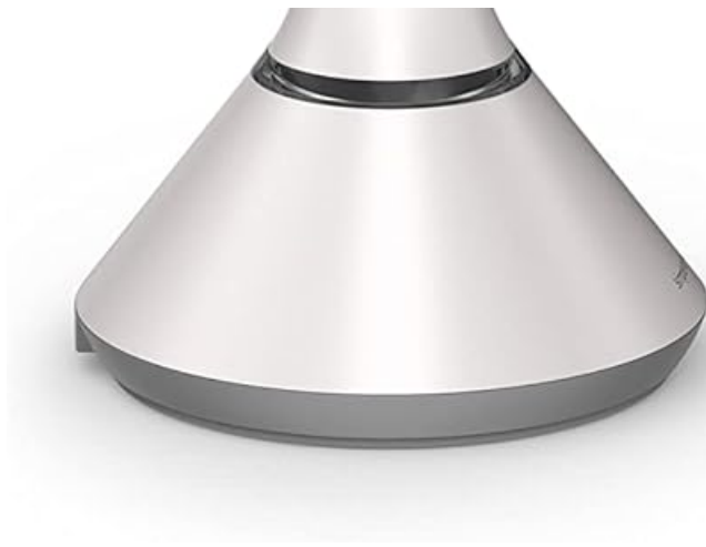
Image: The simplehuman mirror shown tilting, highlighting its adjustable design.