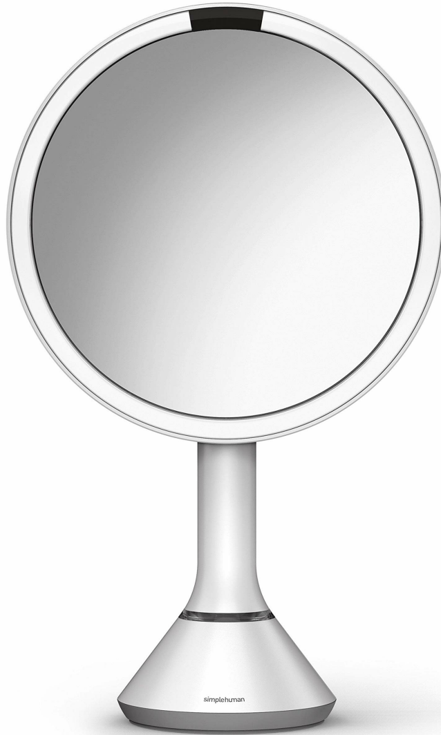
Image: The simplehuman sensor mirror in a bathroom setting, demonstrating its elegant design and illuminated ring light.