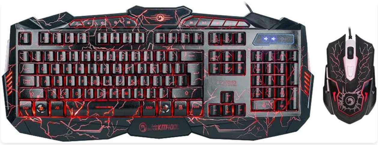
Image: A top-down view of the MARVO KM400L Gaming Keyboard and Mouse, illustrating their connected state and design.