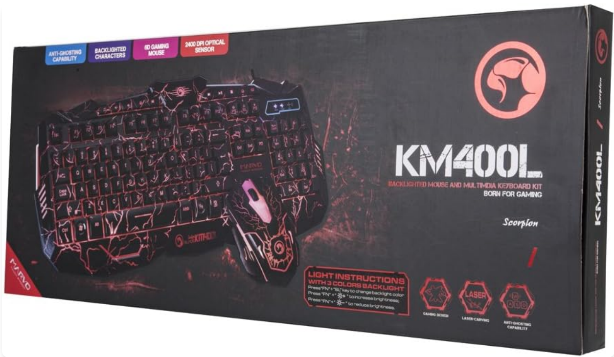
Image: The retail packaging for the MARVO KM400L Gaming Keyboard and Mouse Combo, showing the keyboard and mouse design on the box.