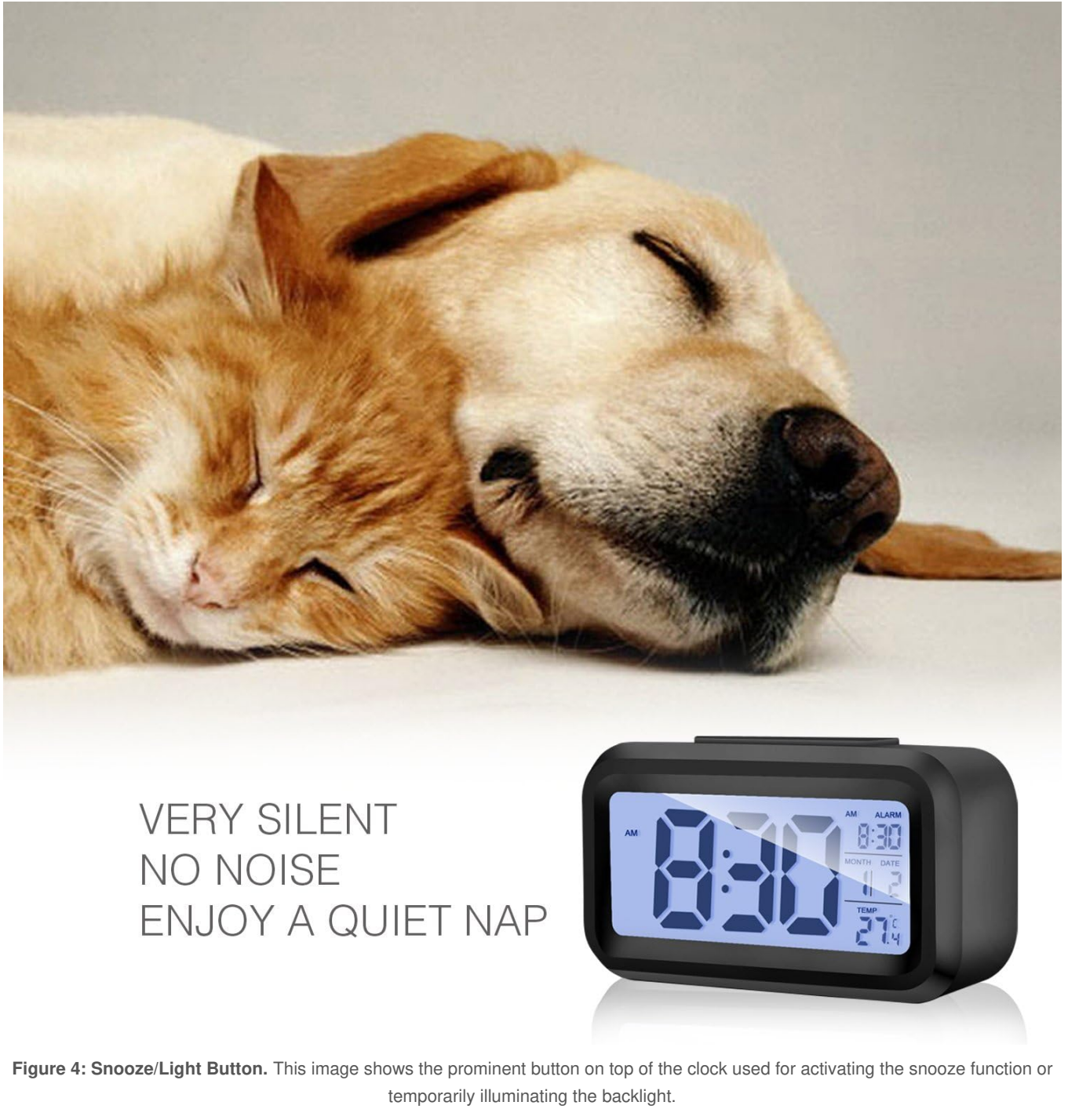
Figure 4: Snooze/Light Button. This image shows the prominent button on top of the clock used for activating the snooze function or temporarily illuminating the backlight.