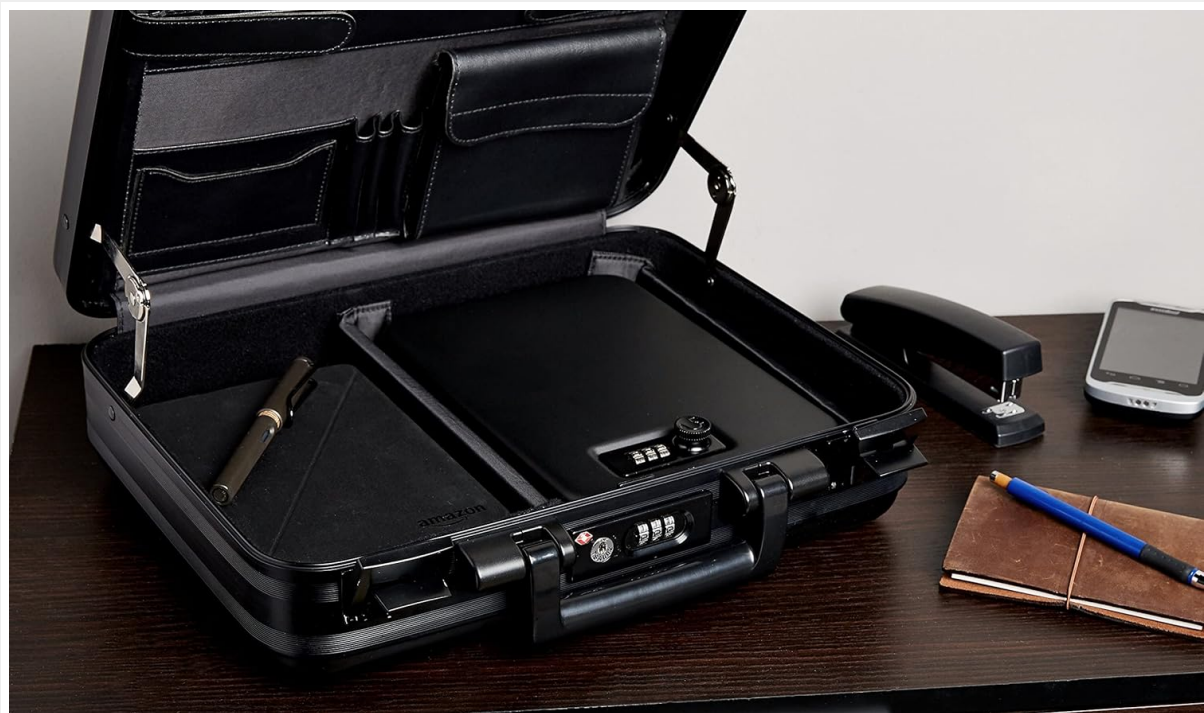
Figure 1.1: The Amazon Basics Portable Security Box, open and ready for use, showcasing its interior space and foam padding.

The Amazon Basics Portable Security Box with Combination Lock (Model SW-SC01) is designed to provide secure storage for your valuables. Its compact and durable construction makes it suitable for both home and travel use, offering protection against unauthorized access.