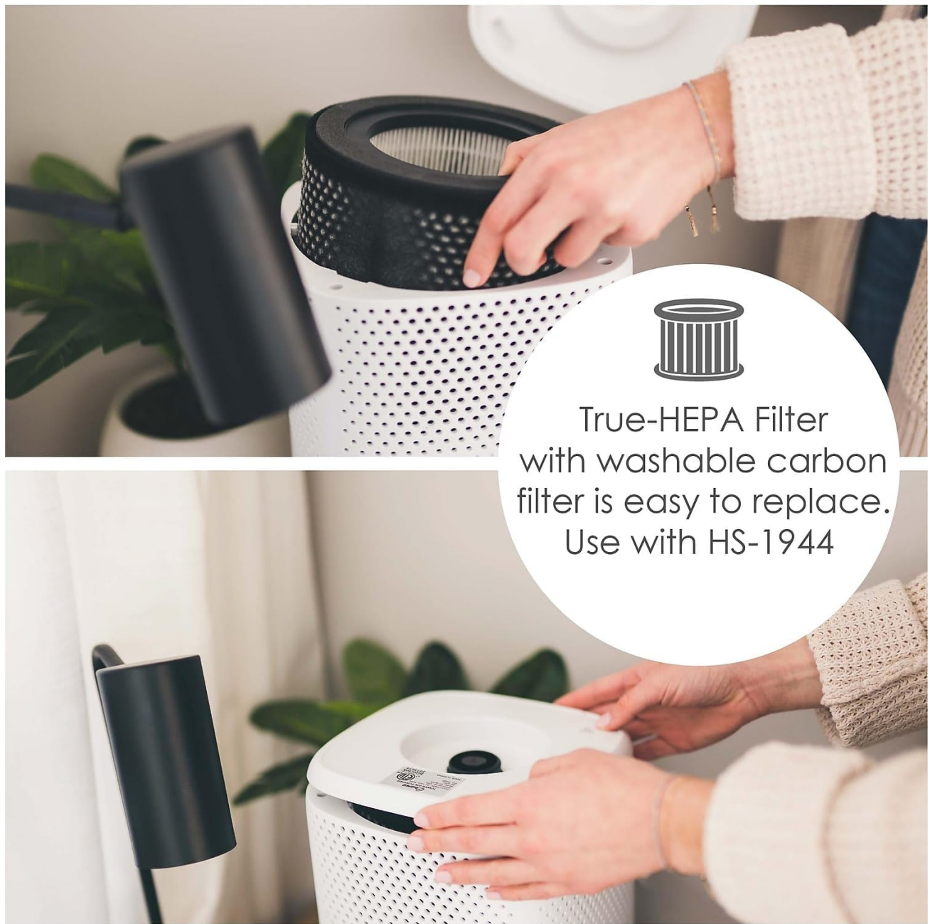
Image 4.1: Visual guide for replacing the True-HEPA filter, emphasizing the ease of maintenance for the Crane Air Purifier.