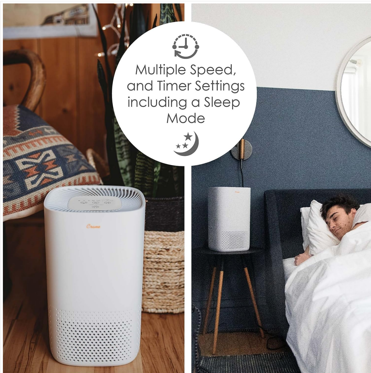
Image 3.1: The air purifier demonstrating its versatility with multiple speed and timer settings, including a quiet Sleep Mode, suitable for various room environments.