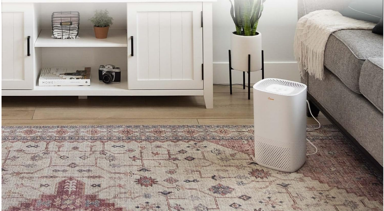
Image 1.2: The Crane Air Purifier in a home environment, showcasing its core functionalities: Sleep Mode, UV Germicidal Light, Timer Settings, and adjustable Speed Settings.