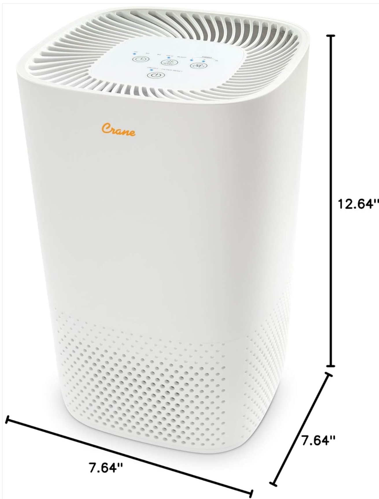
Image 6.1: Dimensions of the Crane Air Purifier Model EE-5067, showing its compact size.