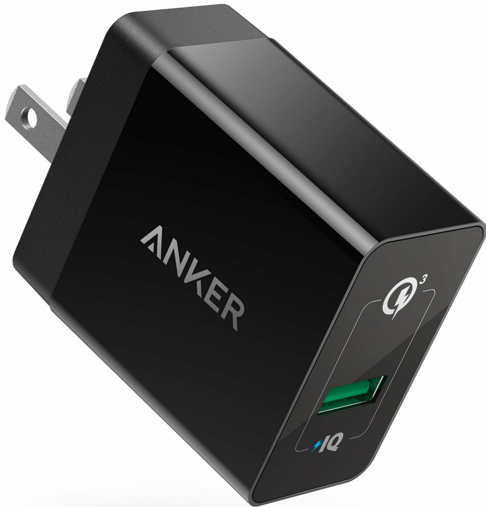
Figure 1: Anker PowerPort+ 1 Quick Charge 3.0 USB Wall Charger connected to a smartphone.