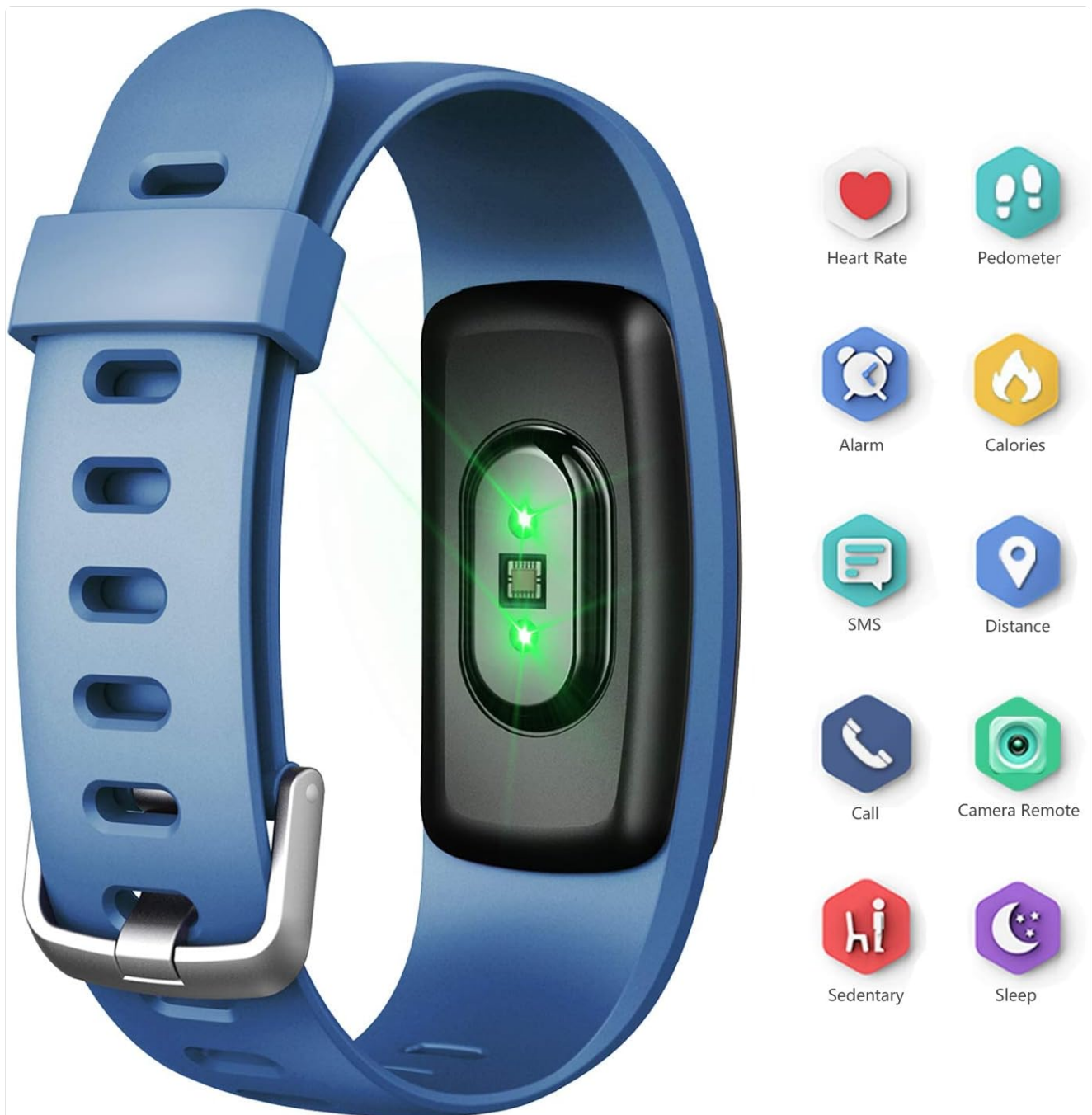
Image: The back of the blue AUSUN 107HR Plus Fitness Tracker showing the green light of the heart rate sensor. To the right, a grid of hexagonal icons represents various functions: Heart Rate, Pedometer, Alarm, Calories, SMS, Distance, Call, Camera Remote, Sedentary Reminder, and Sleep Monitor.