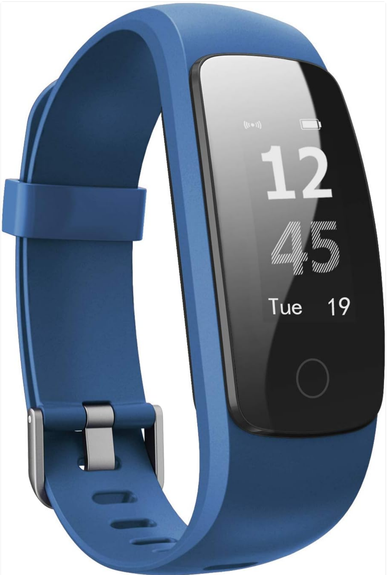
Image: The blue AUSUN 107HR Plus Fitness Tracker, showing its sleek design and the digital display with time and date.

Thank you for choosing the AUSUN 107HR Plus Fitness Tracker. This device is designed to help you monitor your