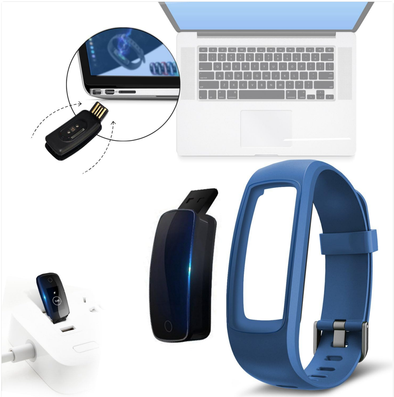
Image: The fitness tracker's main unit detached from one strap, revealing a USB plug. This plug is shown being inserted into a laptop's USB port and a wall adapter, illustrating the direct USB charging method.