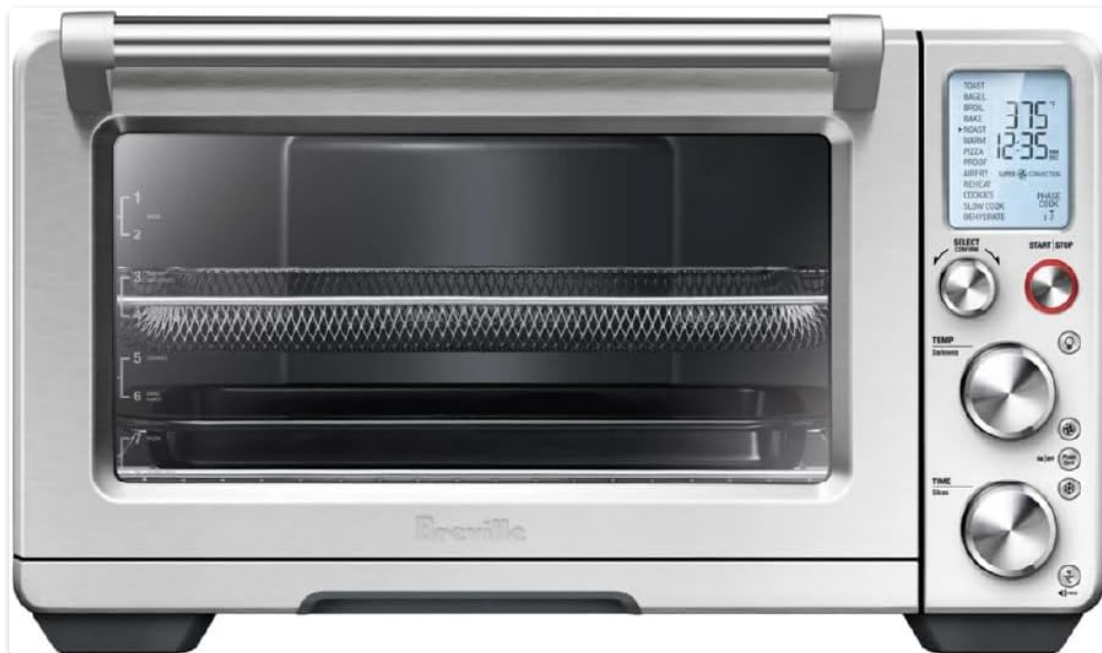
Figure 1.1: The Breville Smart Oven Air Fryer Pro, a versatile countertop appliance.

The Breville Smart Oven Air Fryer Pro with Element iQ System is a versatile countertop oven designed for a wide range of cooking tasks, including roasting, air frying, and dehydrating. Its advanced features, such as super convection technology and precise temperature control, aim to optimize cooking performance and efficiency. This manual provides essential information for the safe and effective use of your appliance.