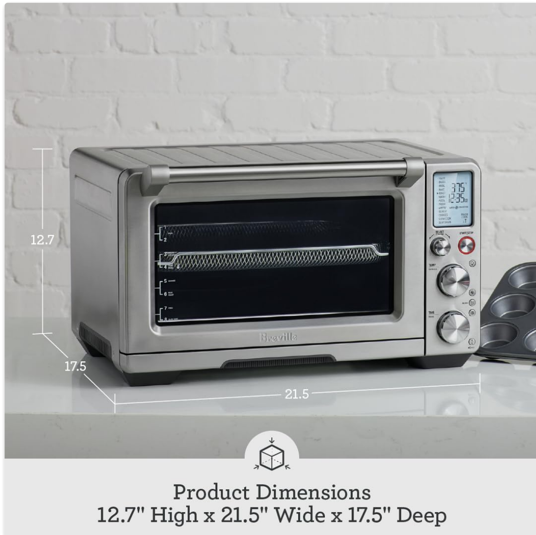
Figure 5.1: Product dimensions for proper placement: 12.7" High x 21.5" Wide x 17.5" Deep.

Place the oven on a flat, stable, heat-resistant surface. Ensure there is adequate space (at least 4 inches) on all sides of the oven for proper air circulation.