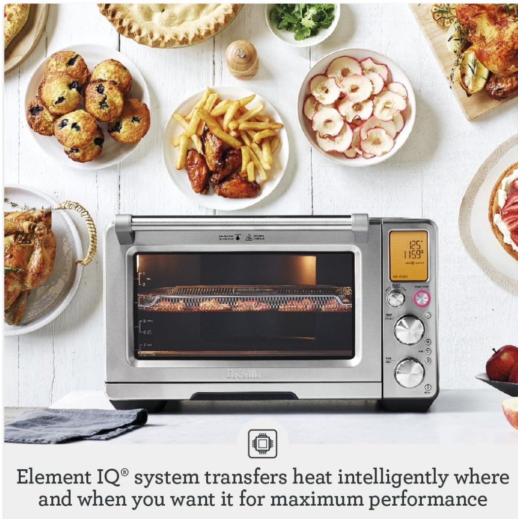
Figure 3.1: The Element iQ system intelligently transfers heat for maximum performance.