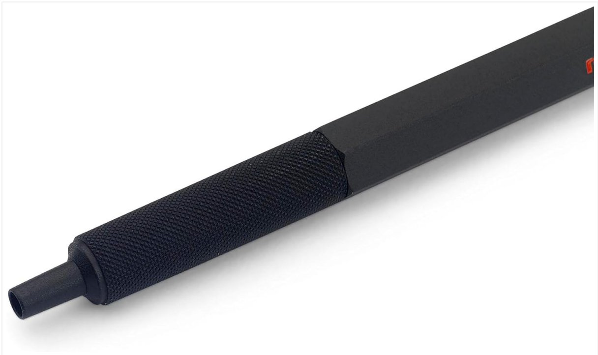
Figure 2: Side view highlighting the hexagonal barrel and integrated metal clip.