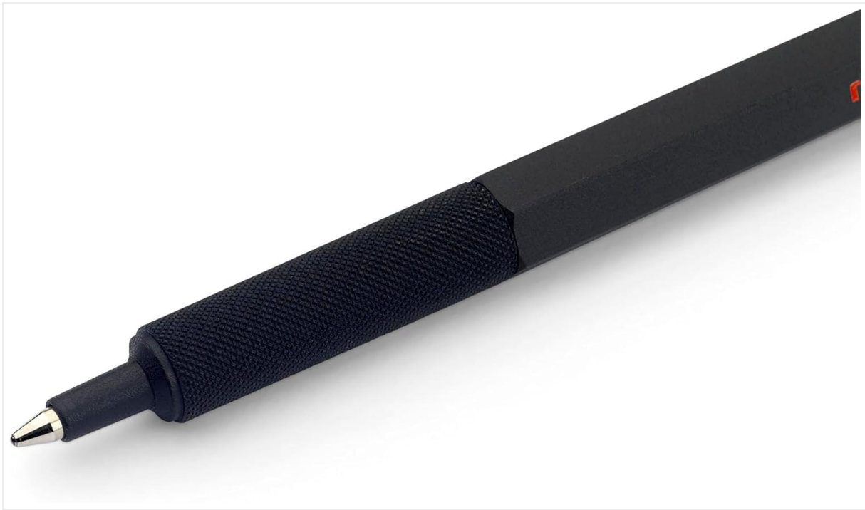
Figure 6: The knurled grip section, which unscrews for refill access.