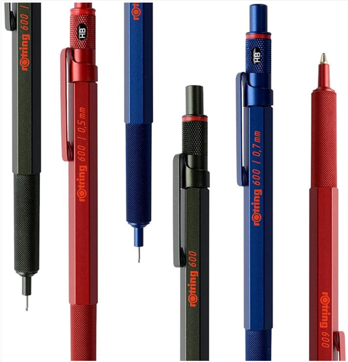
Figure 3: The rOtring 600 pen presented in its original packaging.