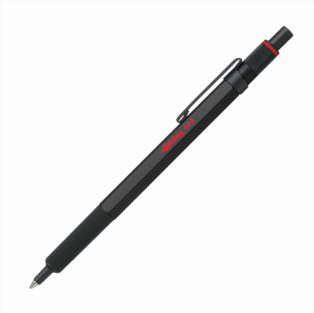
Figure 1: The rOtring 600 Ballpoint Pen in black with its tip extended.

Designed to prevent rolling on surfaces, the hexagonal barrel is a hallmark of rOtring's engineering. The pen comes with a medium point black ink refill, suitable for various writing tasks.