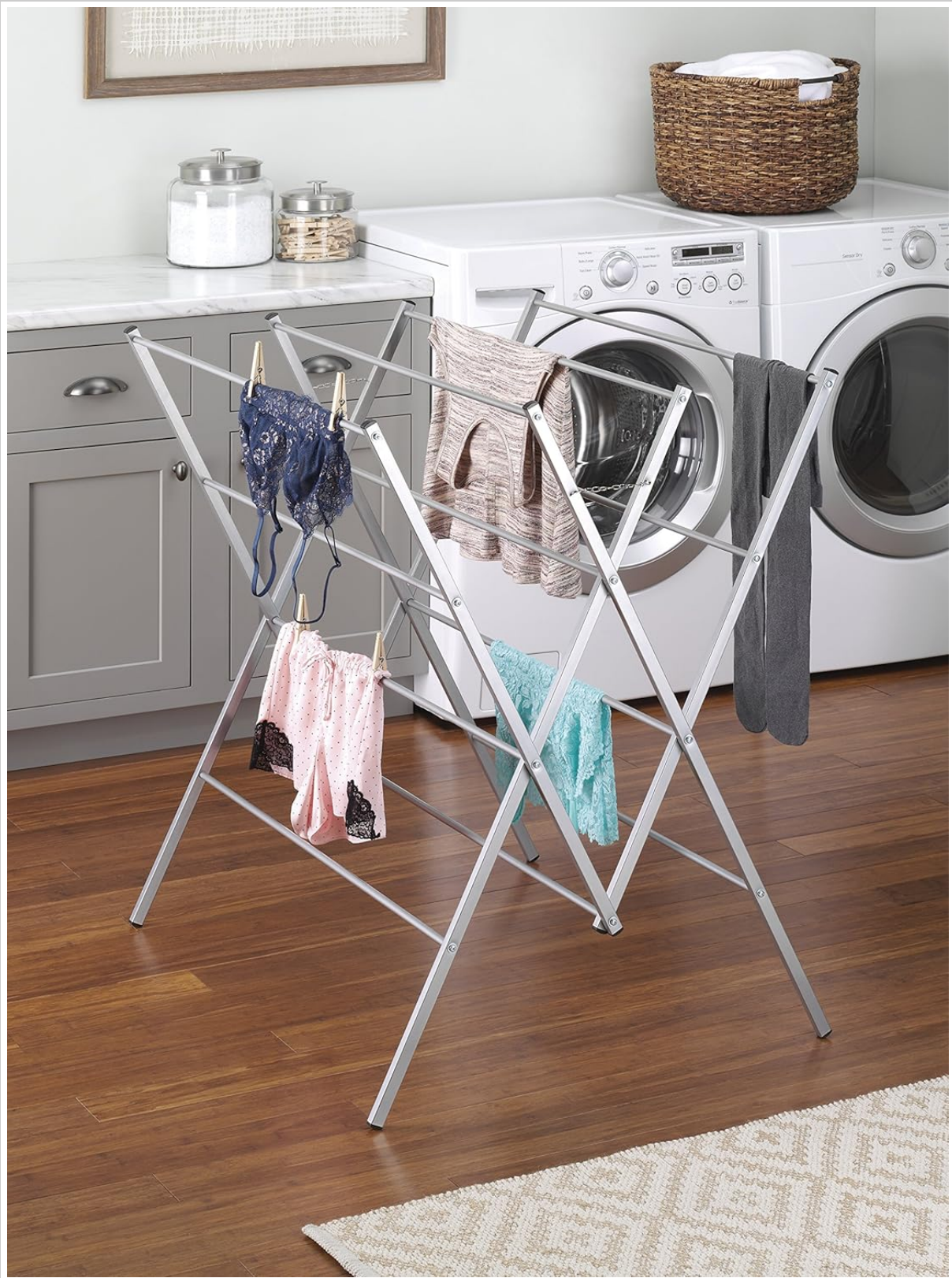
Image: The Whitmor Oversized Metal Drying Rack fully loaded with various types of clothing, including shirts, pants, and undergarments, hanging to air dry.