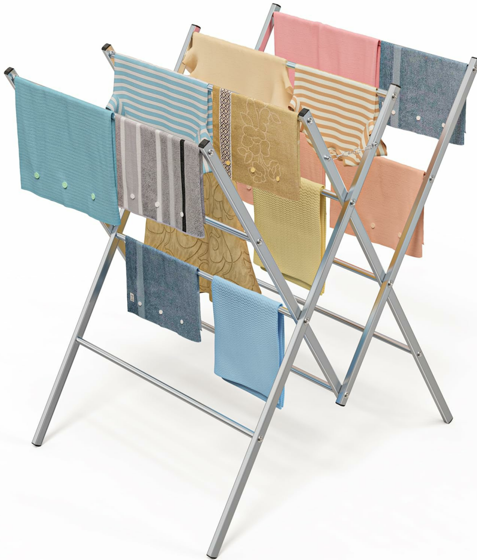
Image: The Whitmor Oversized Metal Drying Rack in use, holding various garments in a laundry room setting.