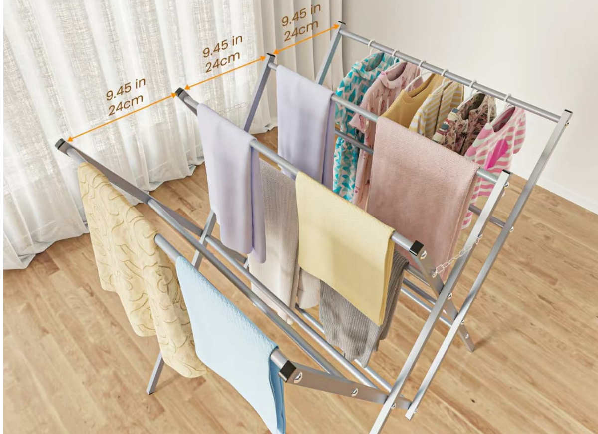
Image: A top-down view of the drying rack highlighting the wide spacing between the bars, which promotes faster drying by allowing ample air circulation.

Your browser does not support the video tag.