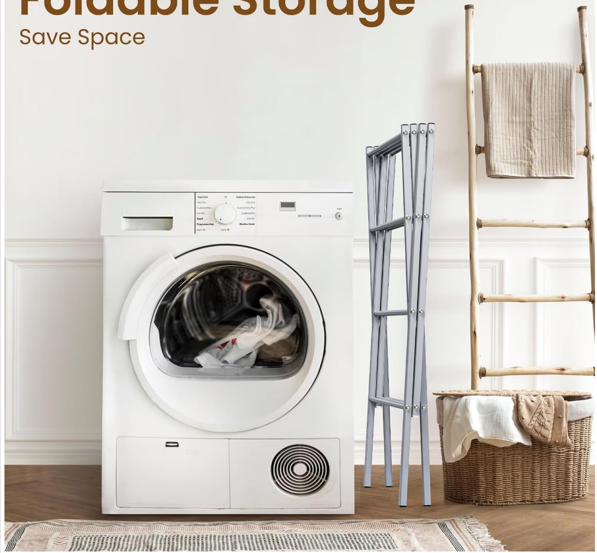
Image: The Whitmor Oversized Metal Drying Rack shown in its folded, compact storage position next to a washing machine, demonstrating its space-saving design.