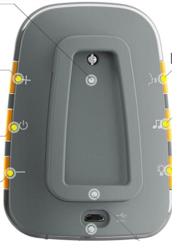
Image: Back view of the Parent Unit, highlighting the battery compartment, volume controls, power button, push-to-talk button, lullaby button, night light button, USB connection, and belt clip.