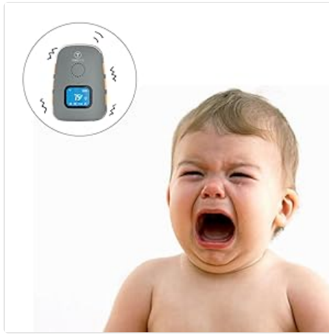
Image: A visual depicting the vibration function of the parent unit.