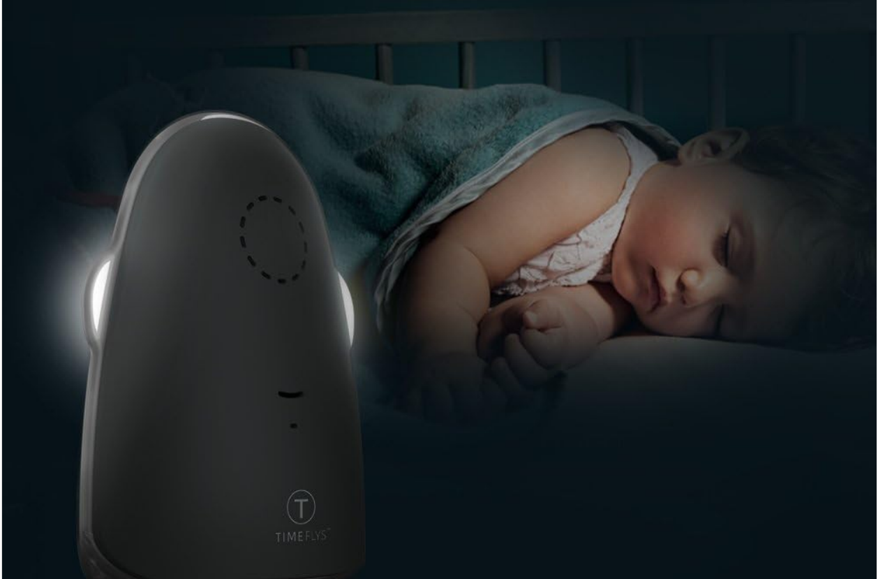
Image: The Baby Unit's night light providing a soft glow in a baby's room.