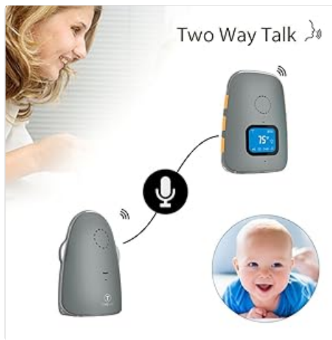
Image: Visual representation of the two-way talk function, showing sound transmission from parent to baby unit.