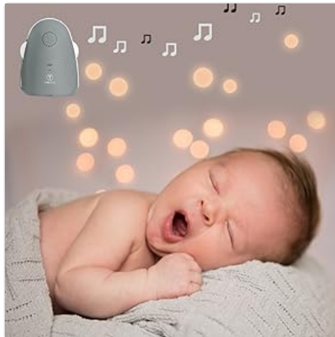
Image: A baby sleeping while a lullaby icon indicates the feature is active.

Press the Lullaby button (often labeled with a music note icon) on the Parent Unit to play soothing melodies through the Baby Unit. Press it again to cycle through available lullabies or to turn them off.