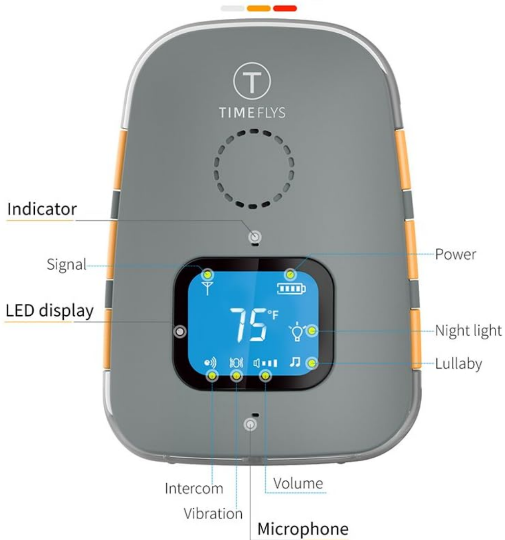
Image: Front view of the Parent Unit, showing the LCD display, signal indicator, power button, night light button, lullaby button, intercom button, vibration button, and volume controls.

Sound Level Indicator Louder sound, more lights on