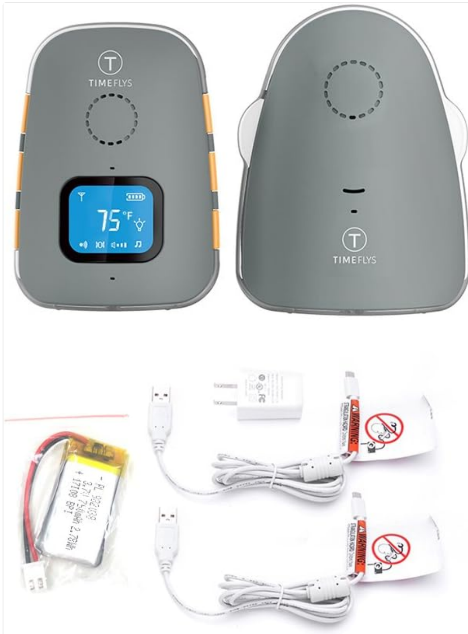
Image: Contents of the TimeFlys Audio Baby Monitor Crown Series package.