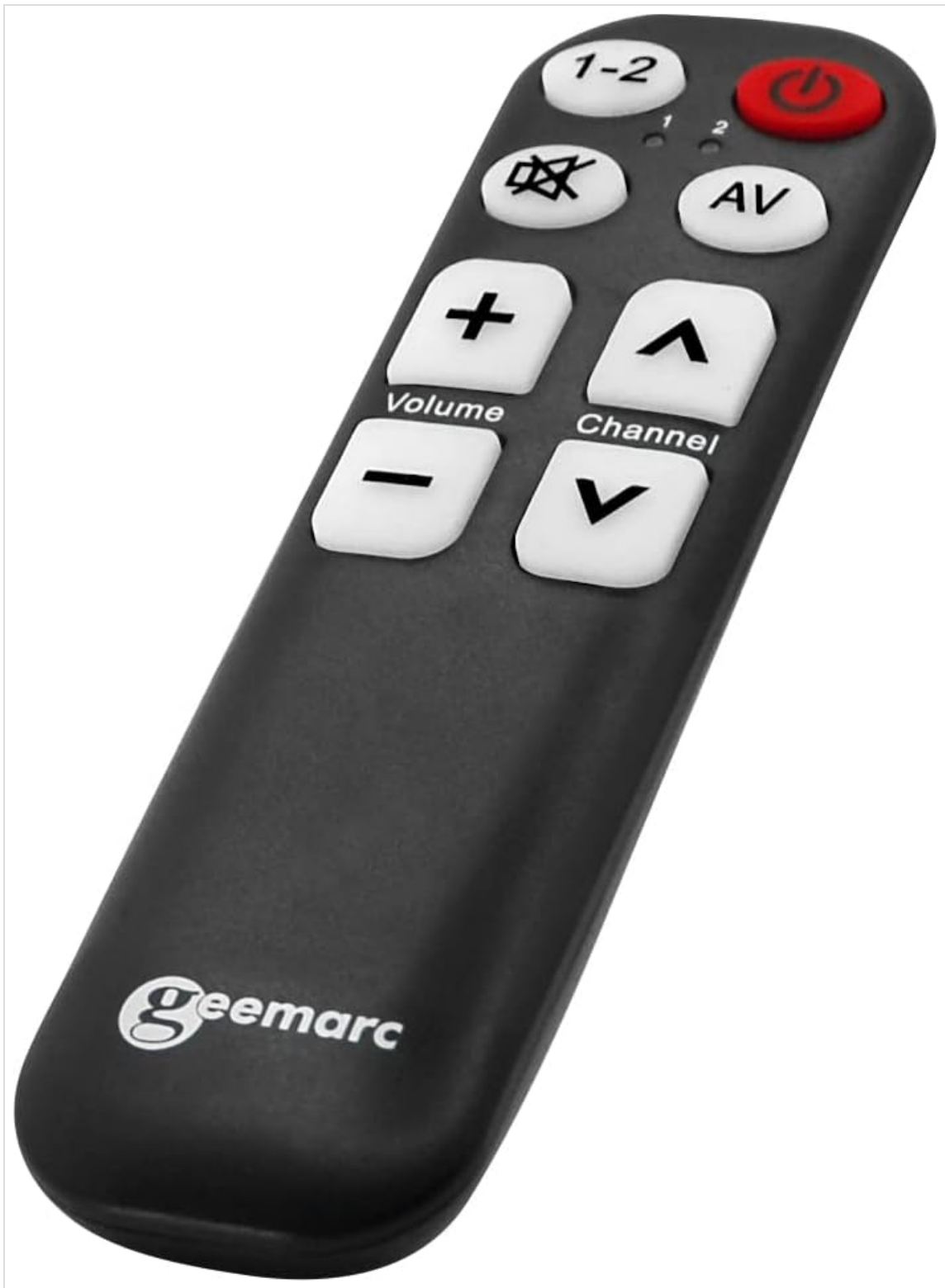
This image displays the front of the Geemarc TV5 remote control, highlighting its seven large, clearly labeled buttons for power, volume, channel, AV input, and device selection (1-2).