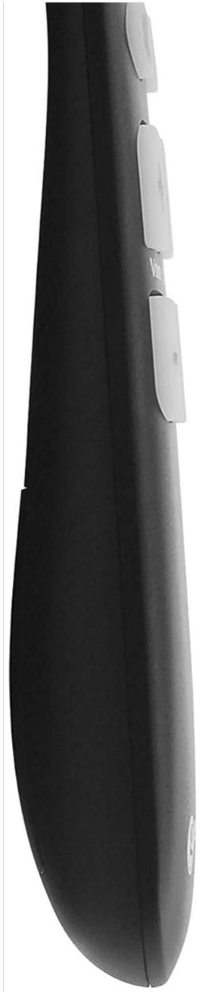
A side view of the Geemarc TV5 remote, illustrating its contoured, ergonomic shape designed for comfortable single-hand