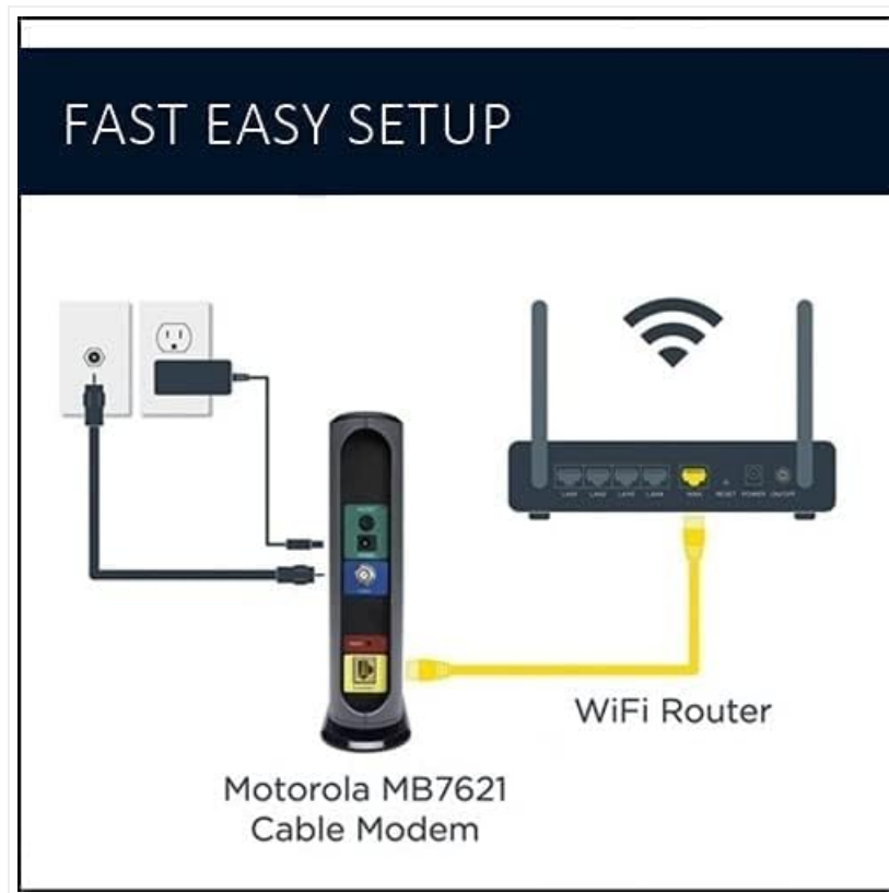
Figure 1: Diagram showing how to connect the Motorola MB7621 Cable Modem to a wall outlet and a WiFi router.