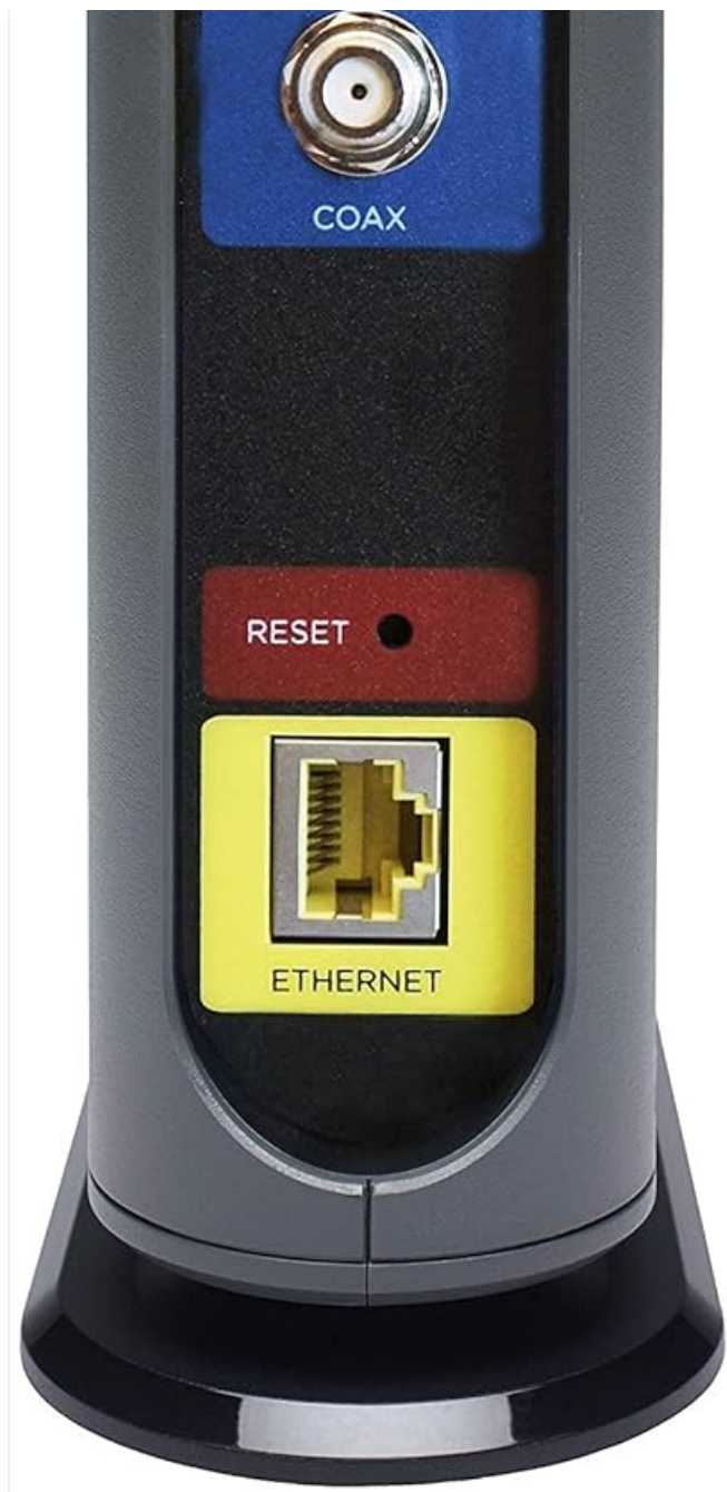
Figure 2: Close-up view of the rear panel of the Motorola MB7621 Cable Modem, showing the ON/OFF button, Power port, COAX port, Reset button, and Ethernet port.