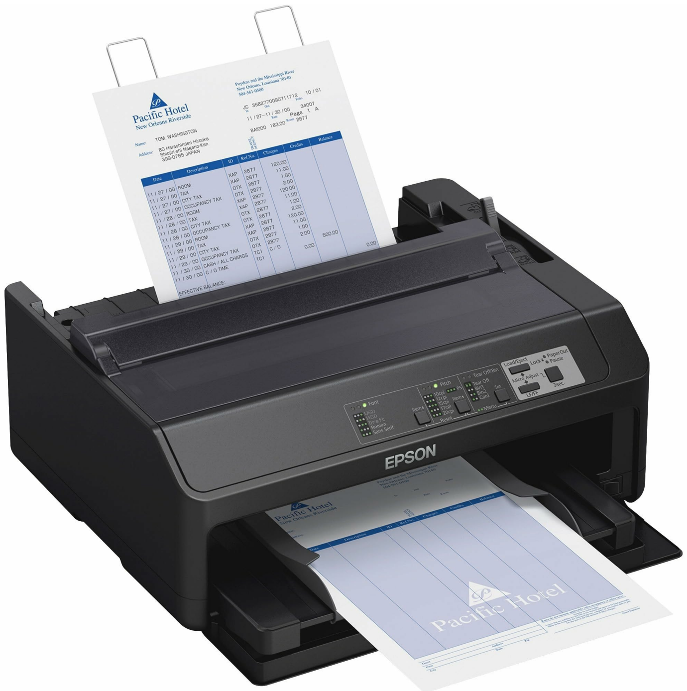
Figure 1: Front view of the Epson FX-890II Impact Printer.