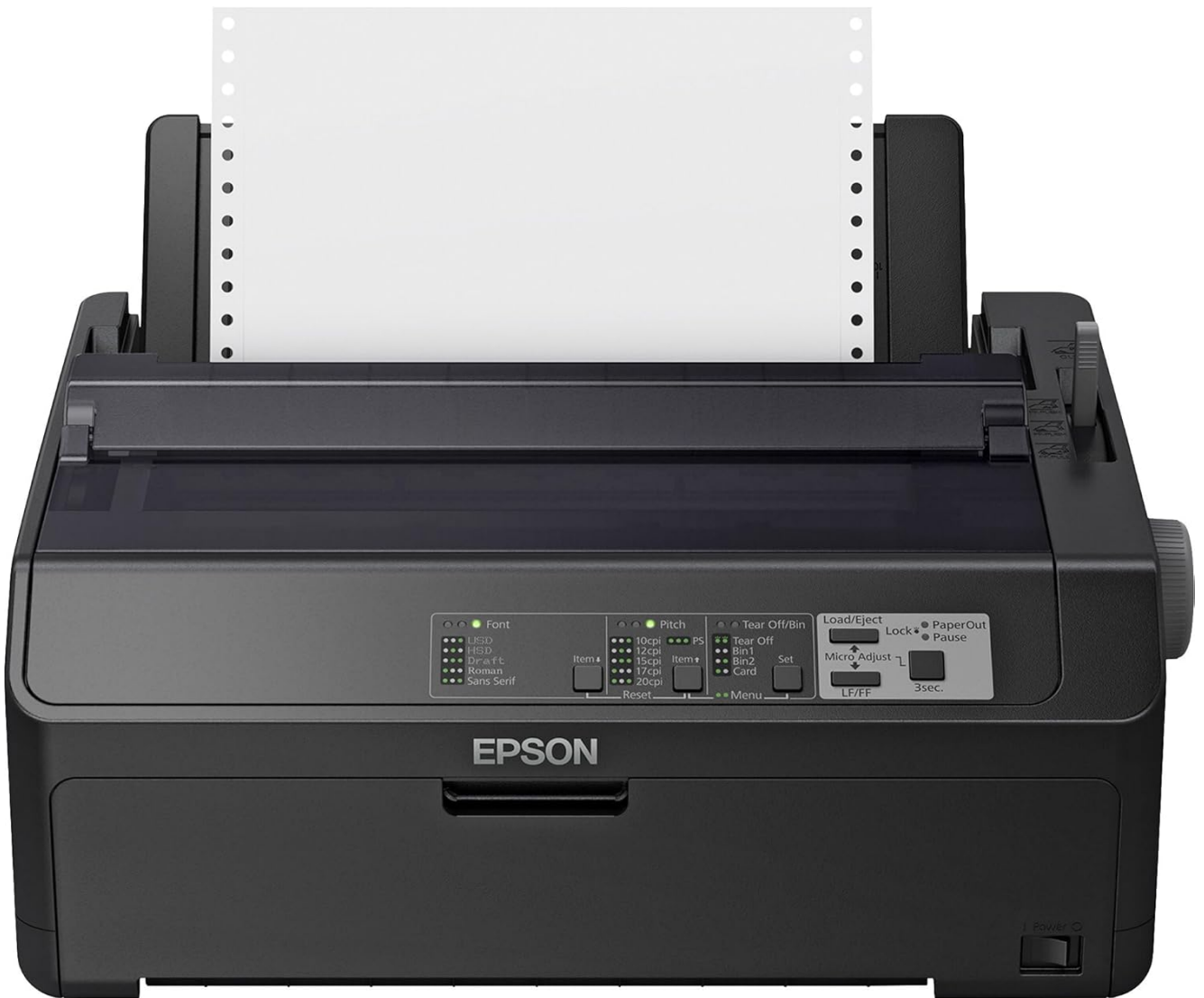
Figure 3: Printer with continuous form paper loaded and ready for printing.