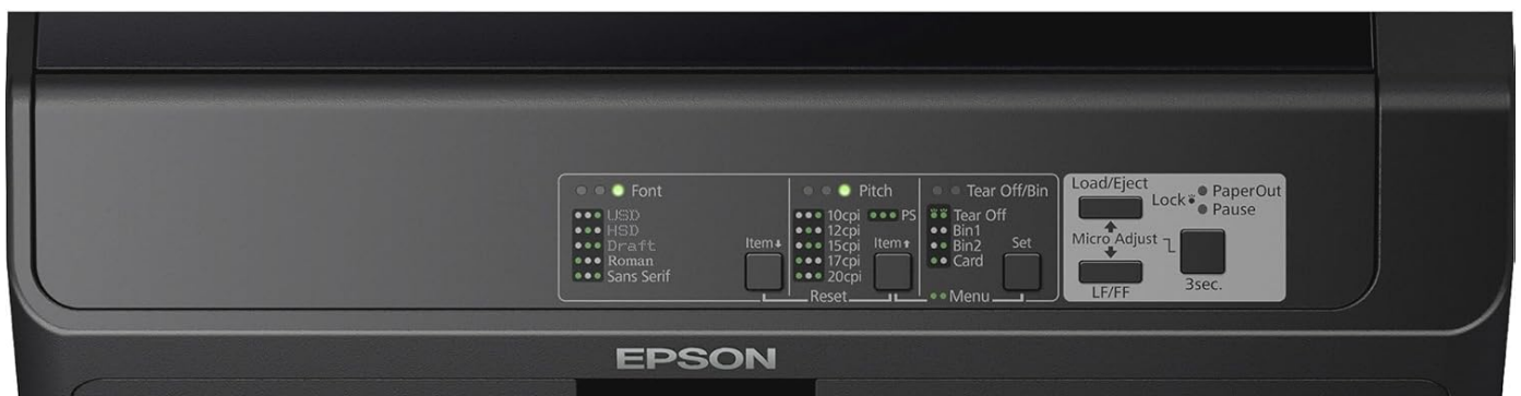
Figure 4: Close-up of the printer's control panel with various function buttons and indicators.

The control panel allows you to manage various printer functions. Refer to Figure 4 for button and indicator locations.