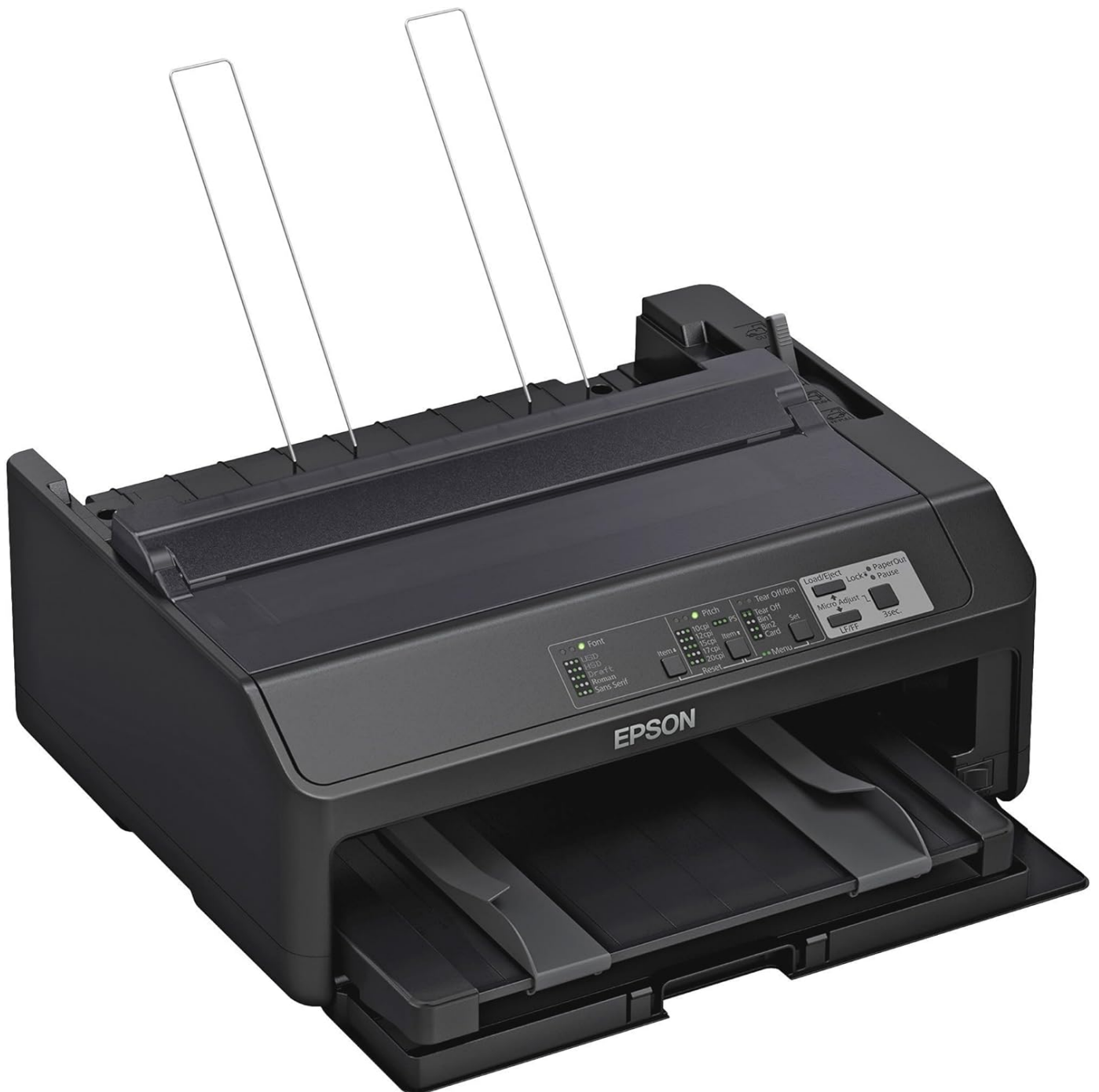
Figure 5: Printer with the paper tray open, ready for cut-sheet paper loading.