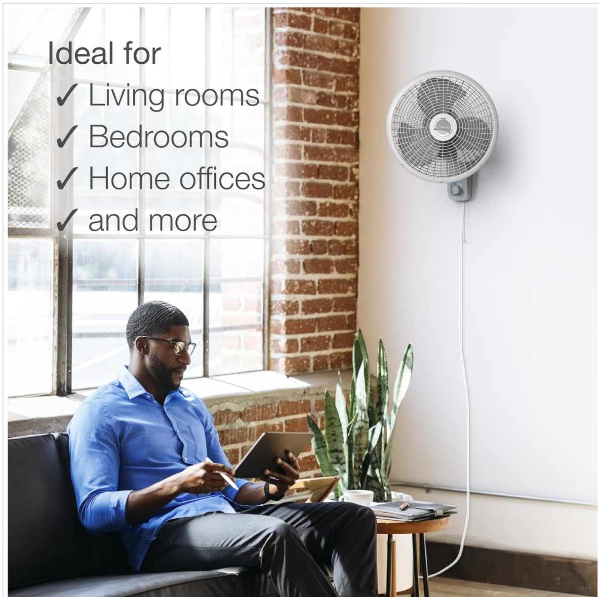
Figure 3: The Lasko M16900 fan installed on a wall, demonstrating its space-saving design in a home environment.