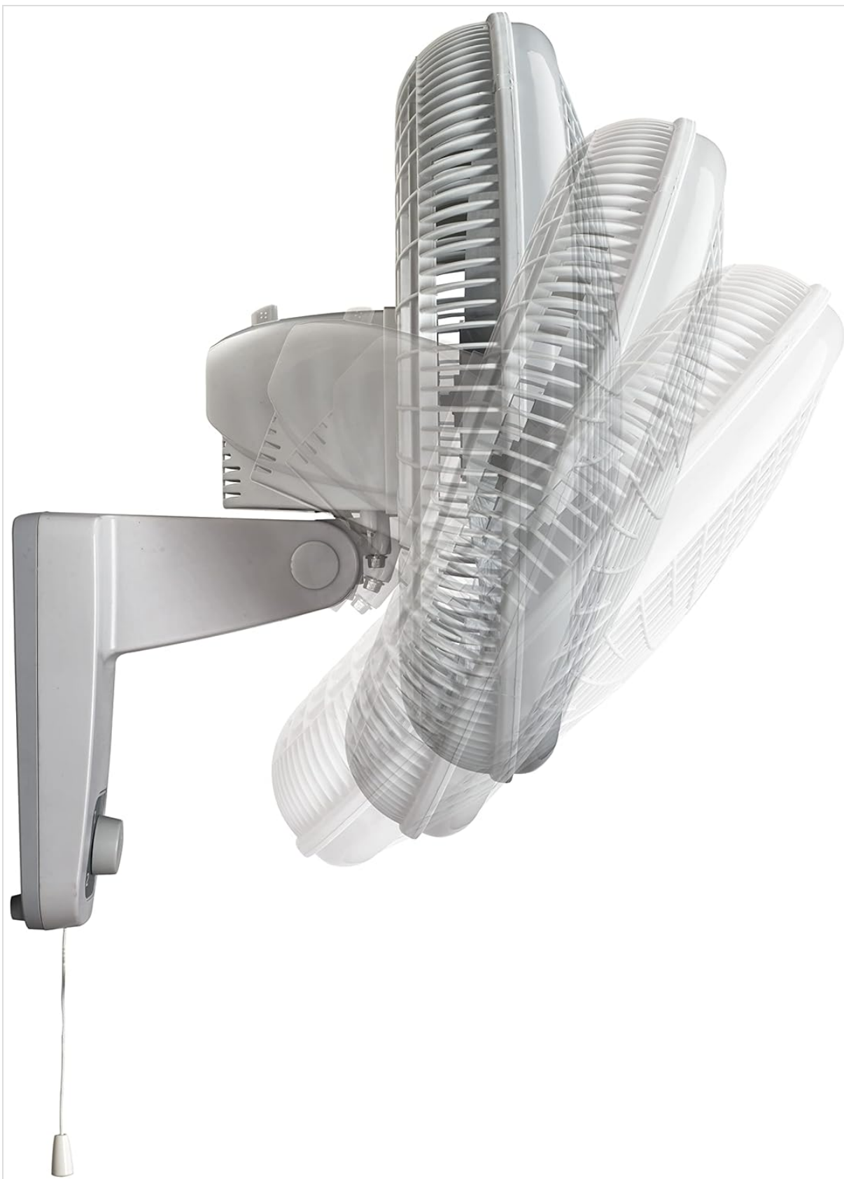
Figure 5: The fan head shown at various tilt angles, highlighting its adjustable airflow direction capability.