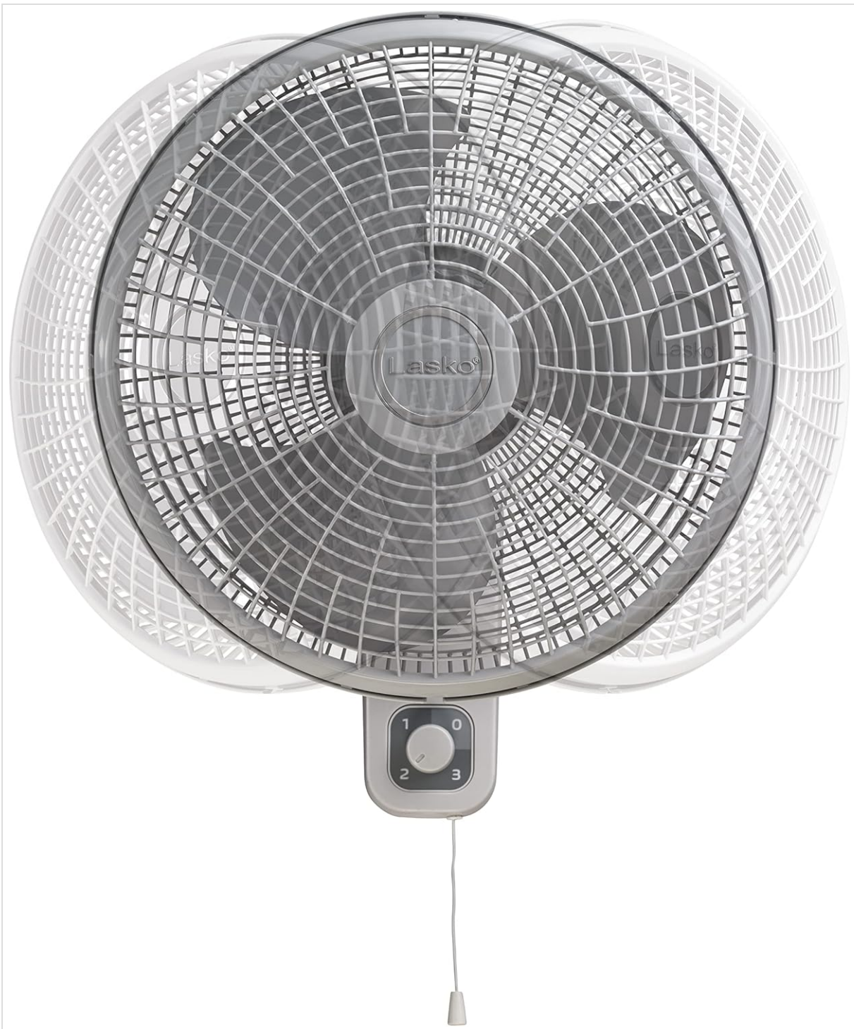
Figure 4: Detailed view of the fan's control panel, showing the rotary dial for speed selection and the pull cord for power.