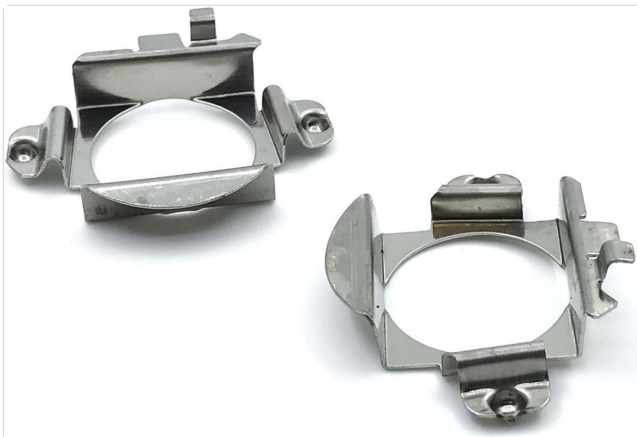
Image 1: Two SOCAL-LED H7 adapter clips, showing their design for securing LED bulbs.