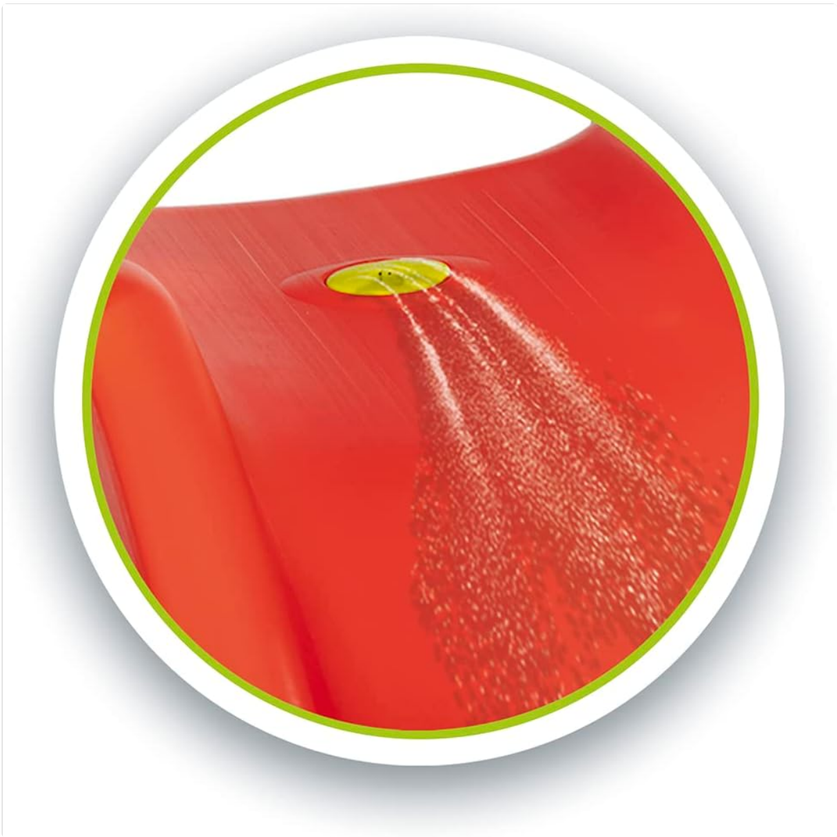
Image: Detail of the slide with water connection point.