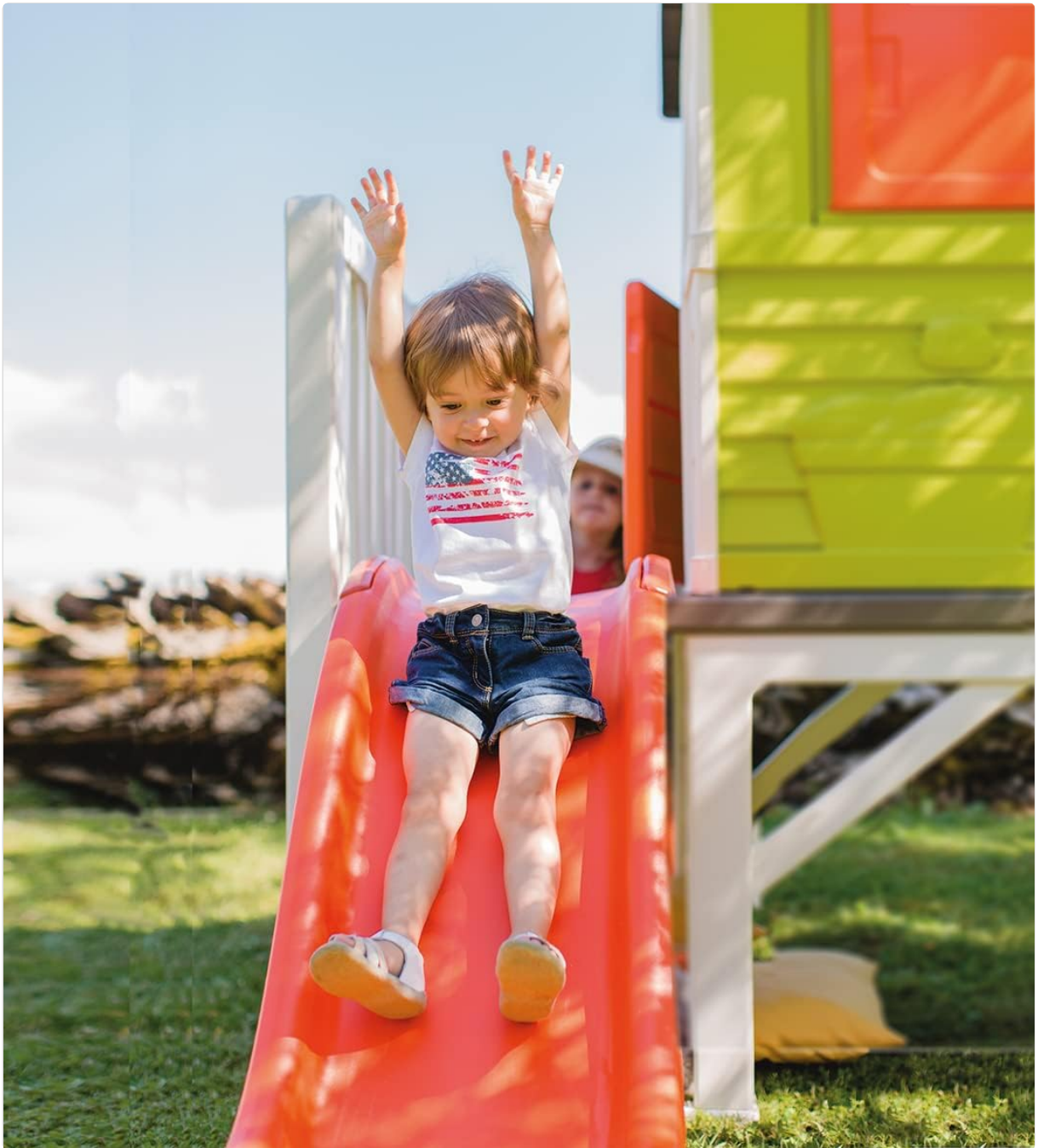
Image: Child using the slide.