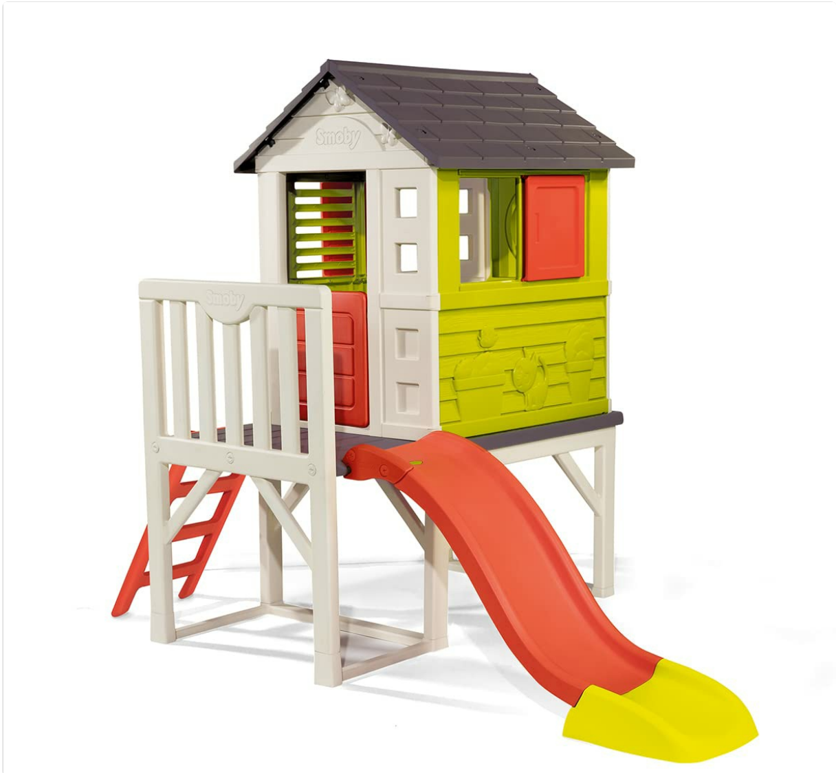
Image: Complete Smoby Playhouse on Stilts with Slide.