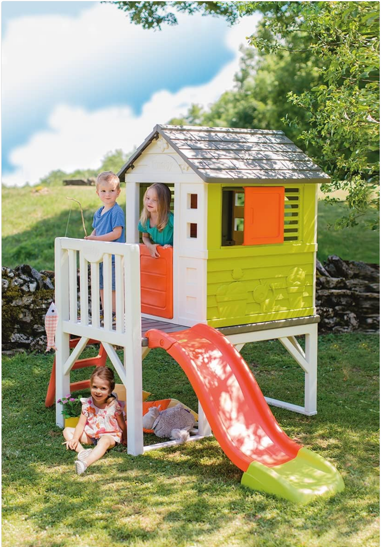
Image: Children enjoying the playhouse and slide.