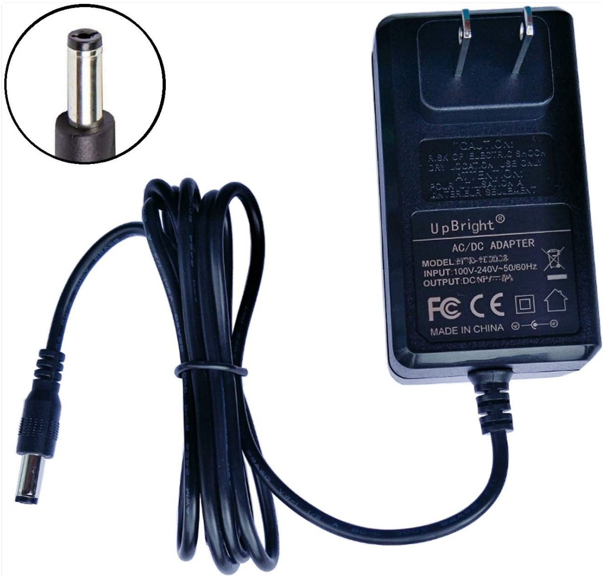
Image: The UpBright 16V AC/DC Adapter, showing the main unit and the attached power cord with its barrel connector tip.