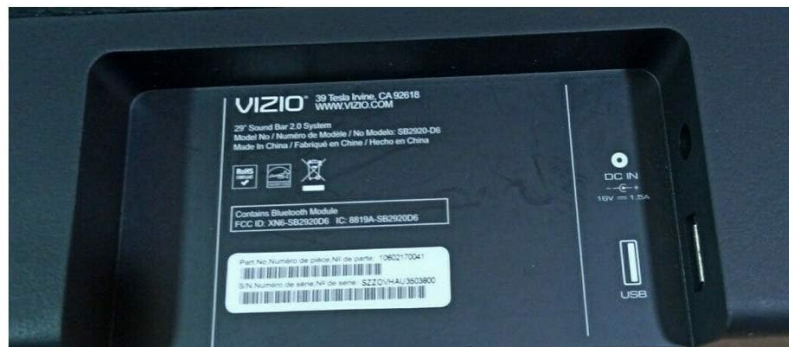
Image: A VIZIO Sound Bar with its rear panel visible, highlighting the 'DC IN' port where the power adapter connects.