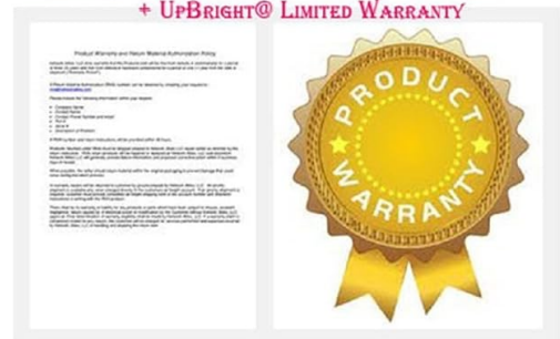
Image: Examples of international outlet adapters (AU, EU, UK) and a representation of the UpBright Limited Warranty Certificate.

LIMITED WARRANTY CERTIFICATE + UPBRIGHT® LIMITED WARRANTY