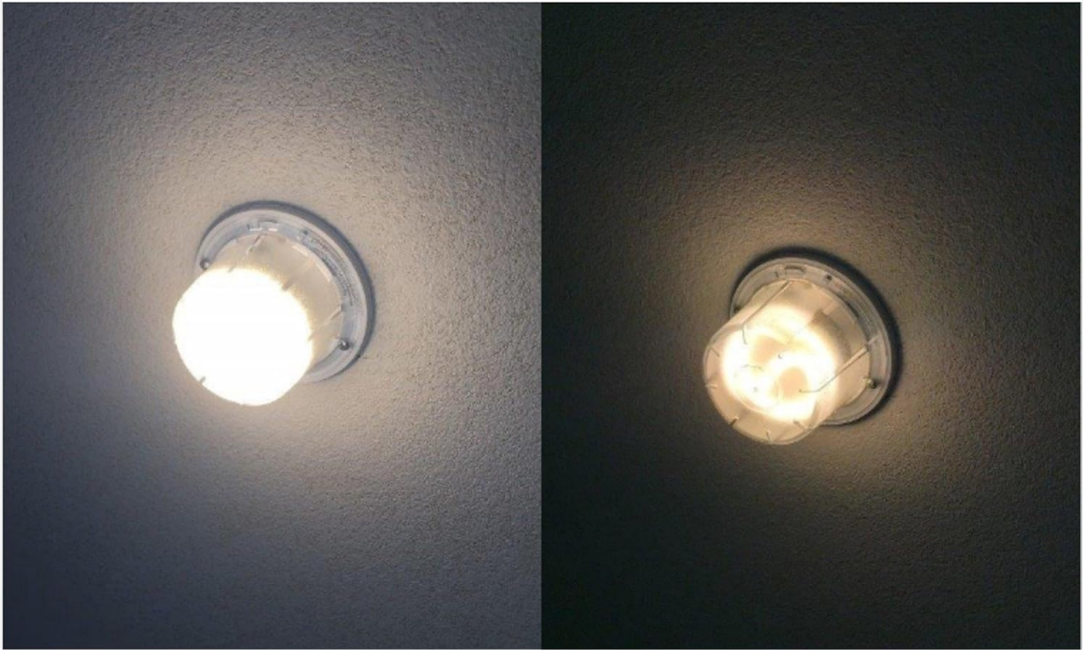
Figure 5: Visual comparison demonstrating the brighter and more consistent light output of the LED bulb compared to a CFL.