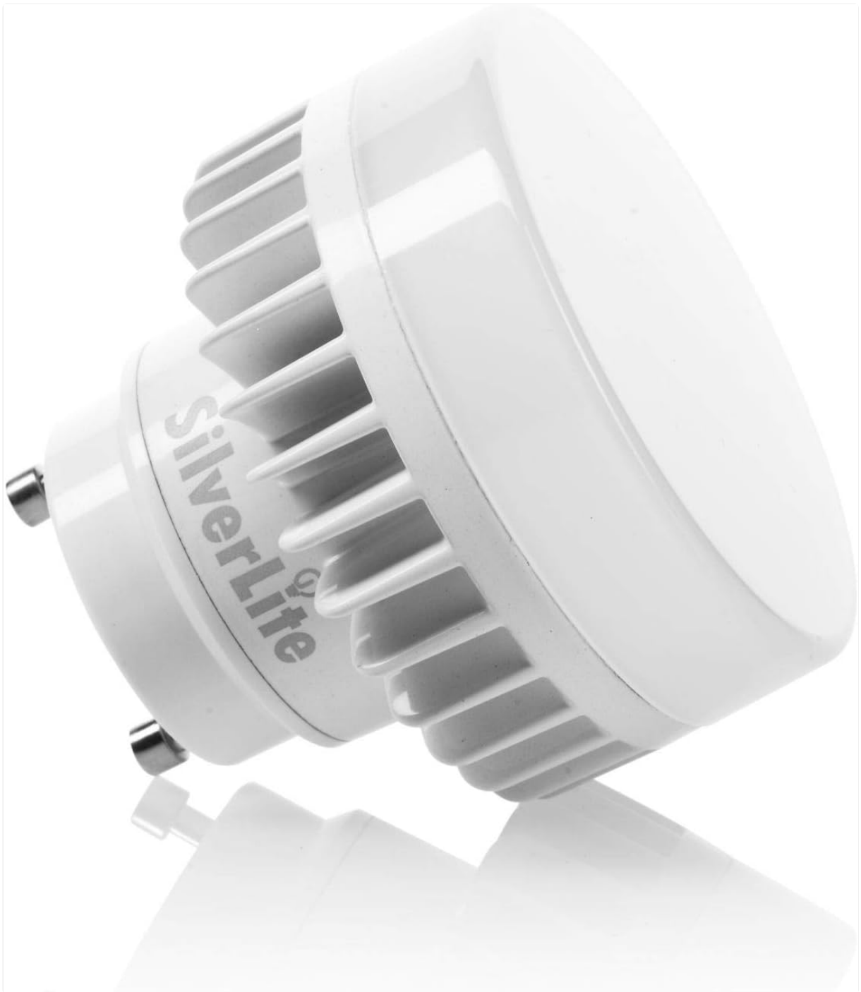
Figure 1: Silverlite Legental 10W LED Mini Puck GU24 Light Bulb.