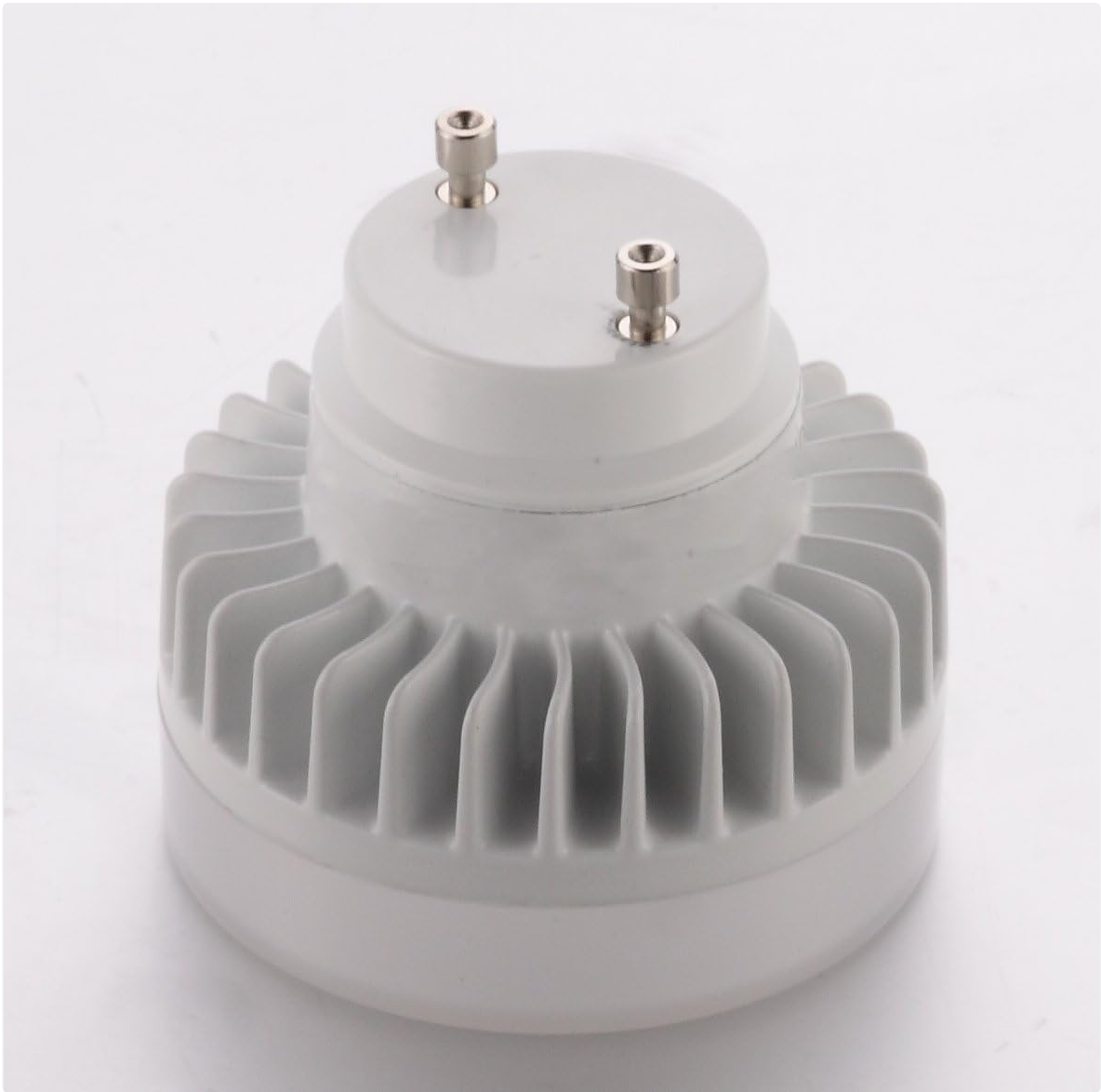
Figure 4: Close-up view of the GU24 base with its two pins.