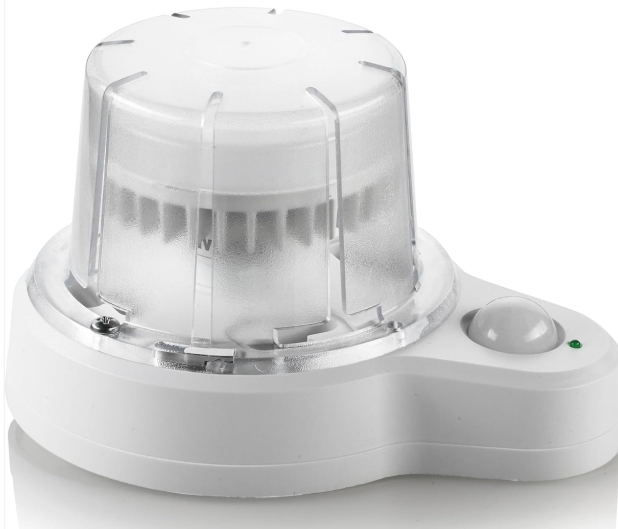
Figure 3: The low-profile design of the Mini Puck bulb allows it to fit into shallow light fixtures.