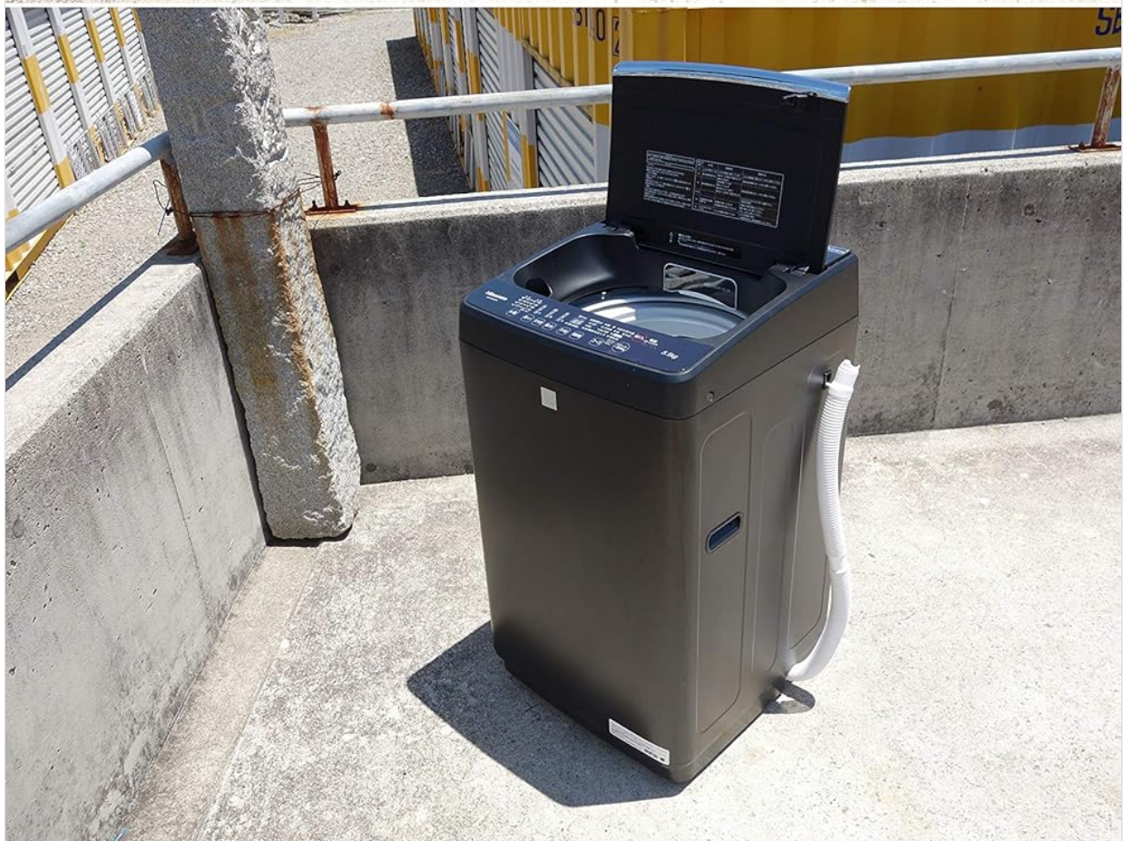
Figure 1: Front and top view of the Hisense 5.5kg Fully Automatic Washing Machine. This image displays the overall sleek design of the appliance.