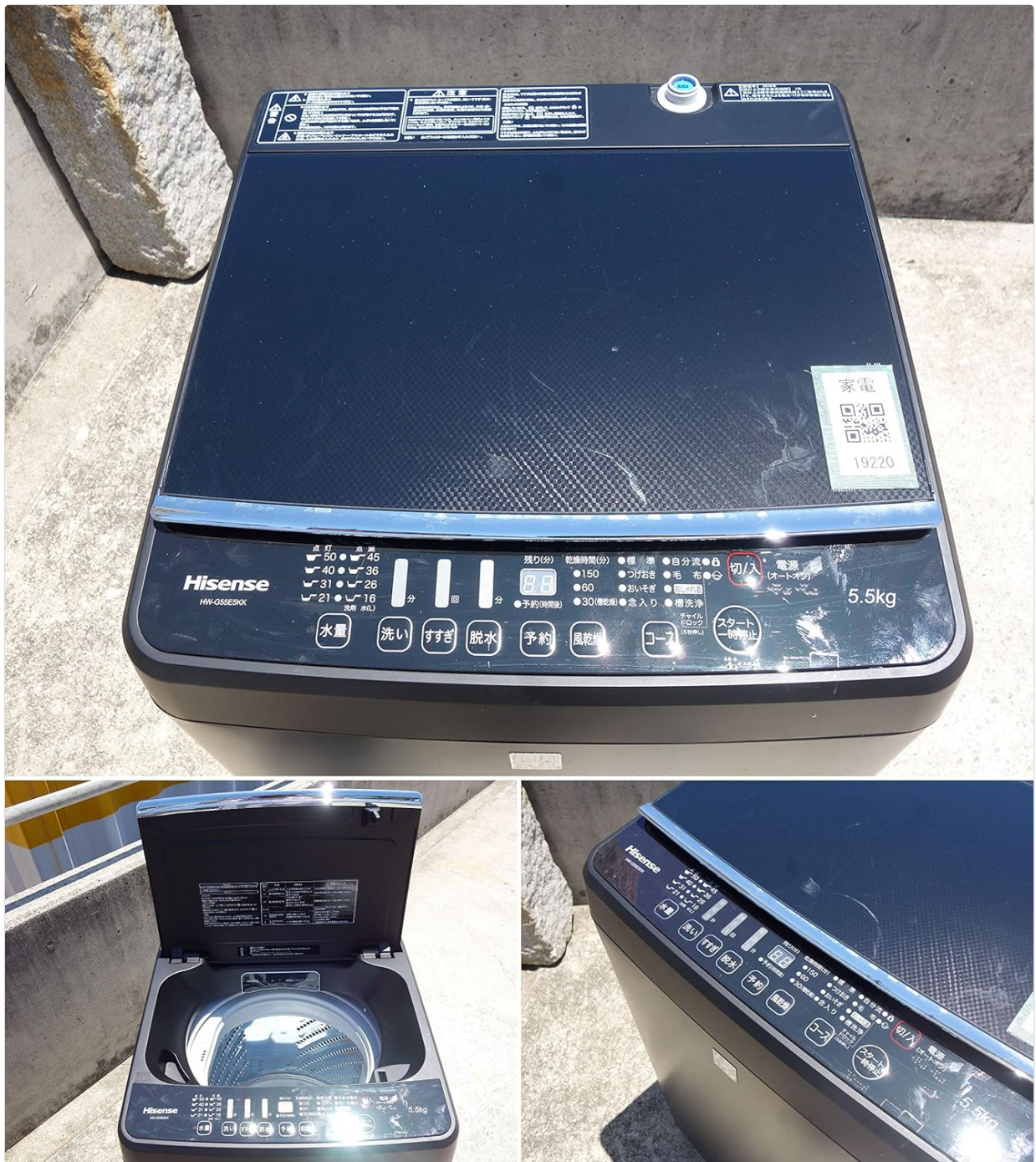
Figure 2: Close-up of the control panel and open lid. The panel features buttons for water level, wash, rinse, spin, reservation, and various courses like standard, delicate, blanket, and wind dry.