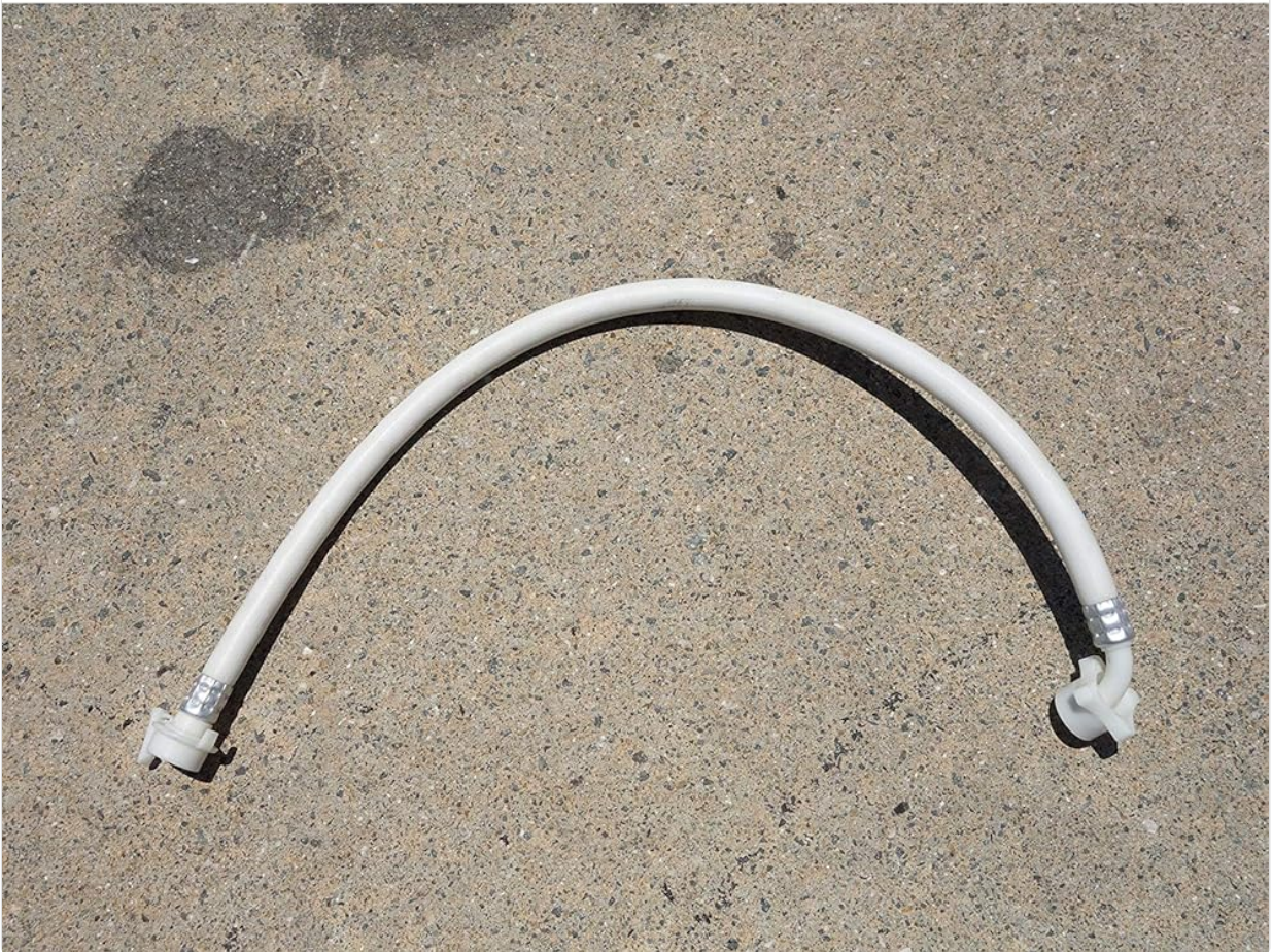
Figure 5: The drain hose connected to the rear of the washing machine. The hose is flexible and can be routed to the left, right, front, or back depending on your installation needs.