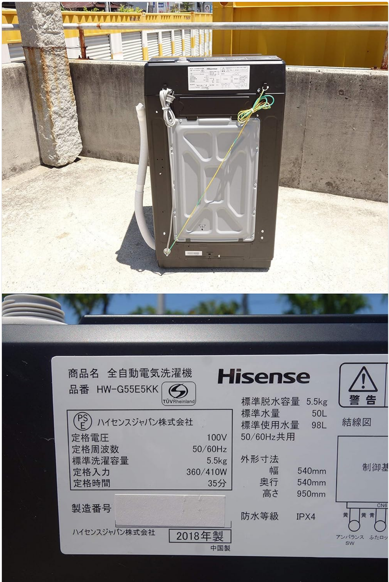
Figure 4: Rear view of the washing machine, highlighting the product specifications label. The label provides details such as model number, power requirements, washing capacity, and dimensions.