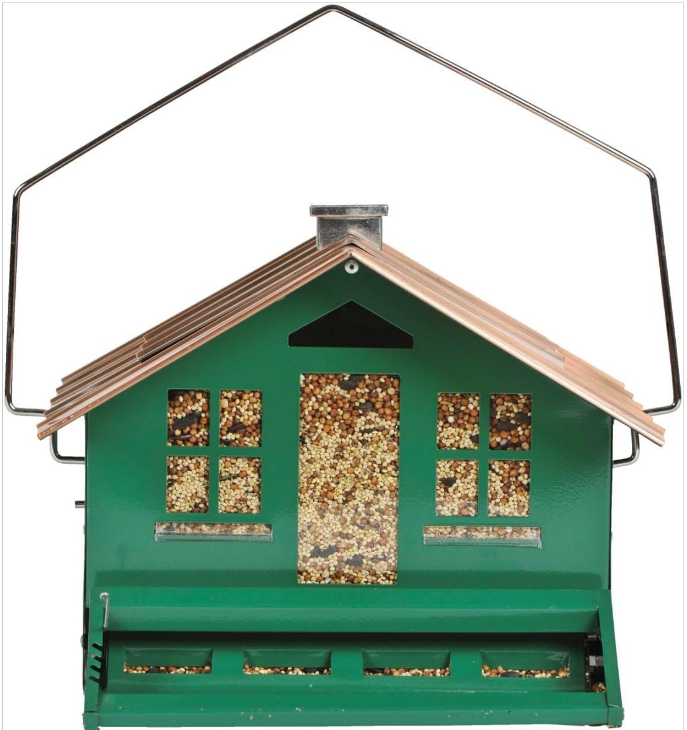
Image: The Perky-Pet Squirrel-Be-Gone II Feeder with its roof open, revealing the large opening for filling. The feeder is shown filled with a variety of bird seeds,