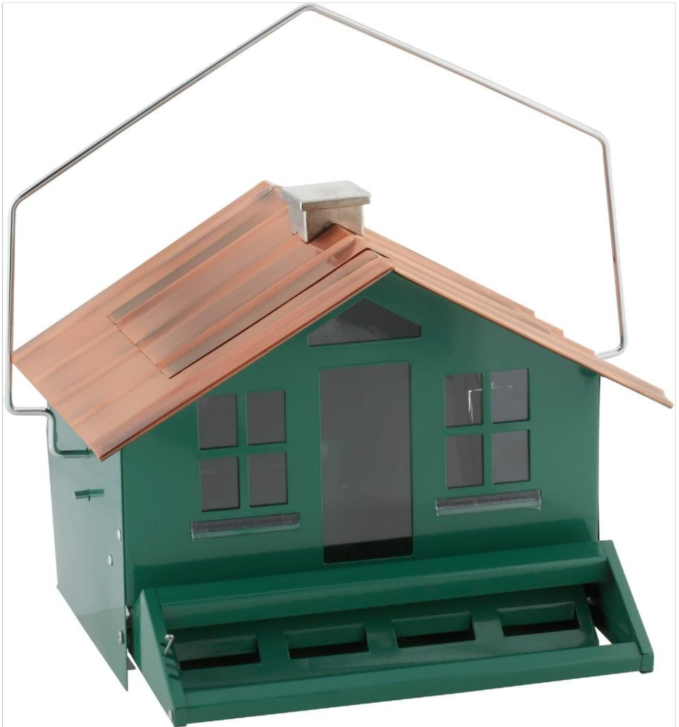
Image: The Perky-Pet Squirrel-Be-Gone II Home Style Bird Feeder, green with a copper-colored roof, designed to resemble a small house. It features clear windows for seed level monitoring and a metal hanging handle.