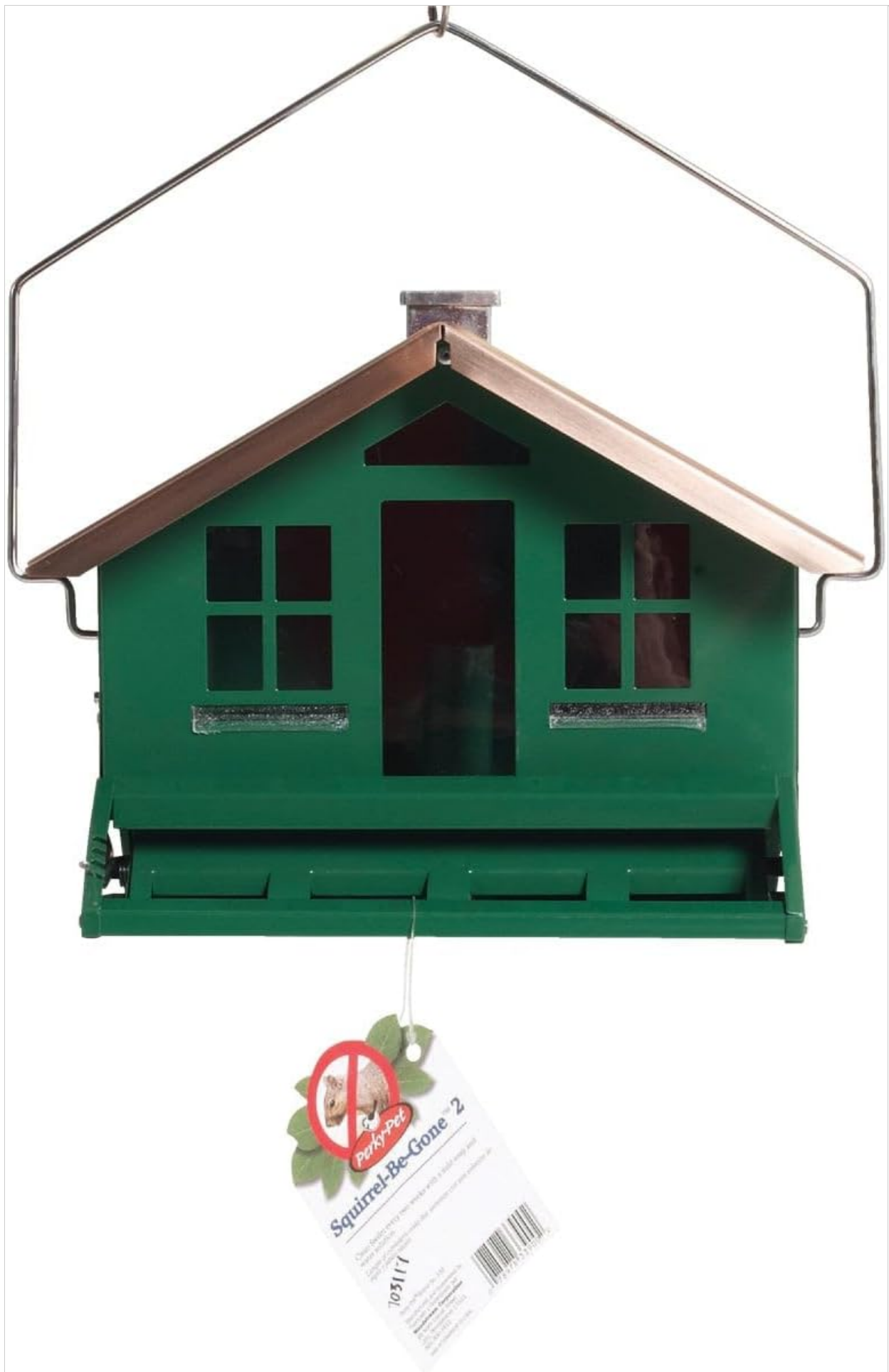
Image: The Perky-Pet Squirrel-Be-Gone II Feeder, shown from the front with its metal hanging handle extended. A product tag is visible, indicating it's ready for hanging installation.