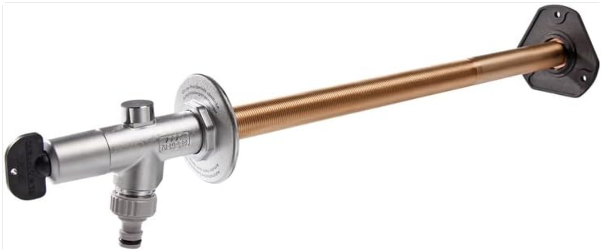
Image: The Kemper 5740301500 frost-proof outdoor faucet, showing its main body, the long copper pipe for wall insertion, and the wall mounting plate.