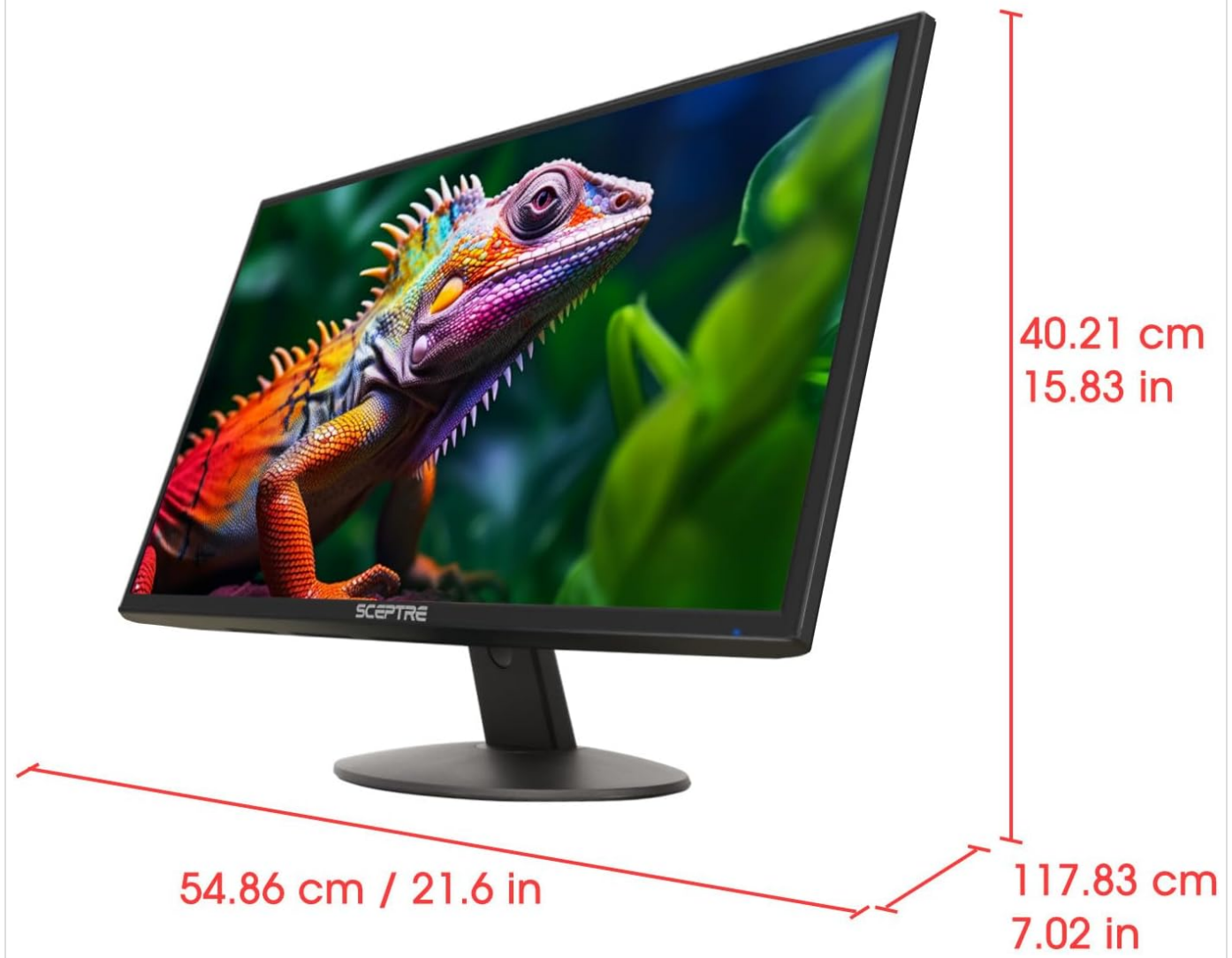
Image: The Sceptre E248W-19203R monitor with its dimensions labeled, showing a screen size of 24 inches, a width of 54.86 cm (21.6 in), and a height of 40.21 cm (15.83 in) including the stand.