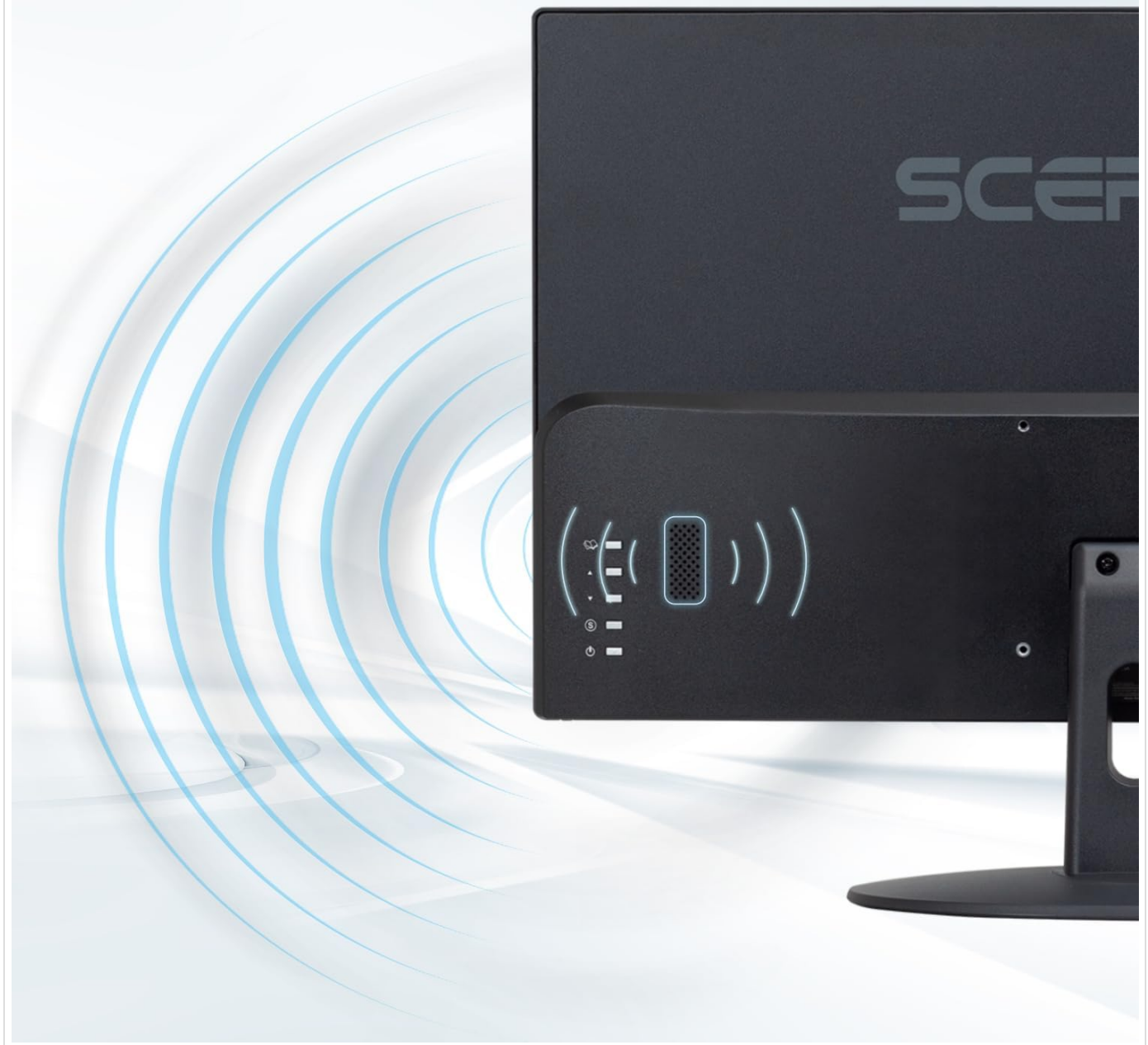
Image: Rear view of the Sceptre E248W-19203R monitor, highlighting the two HDMI ports, one VGA port, Audio In, and Audio Out (headphone jack). The image also indicates the location of the built-in speakers with sound wave graphics.