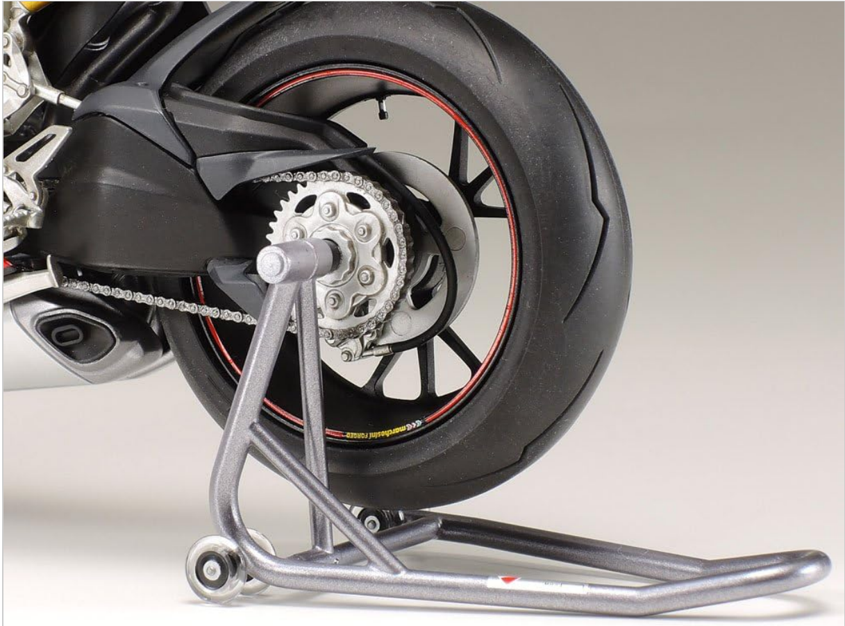
Figure 4: A detailed view of the rear wheel, drive chain, and sprocket assembly. Note the intricate brake disc and caliper, and the tire tread pattern. The model is shown on a display stand.

Attach the rear swingarm to the frame, followed by the rear wheel, chain, and sprocket. Ensure the wheel rotates smoothly.