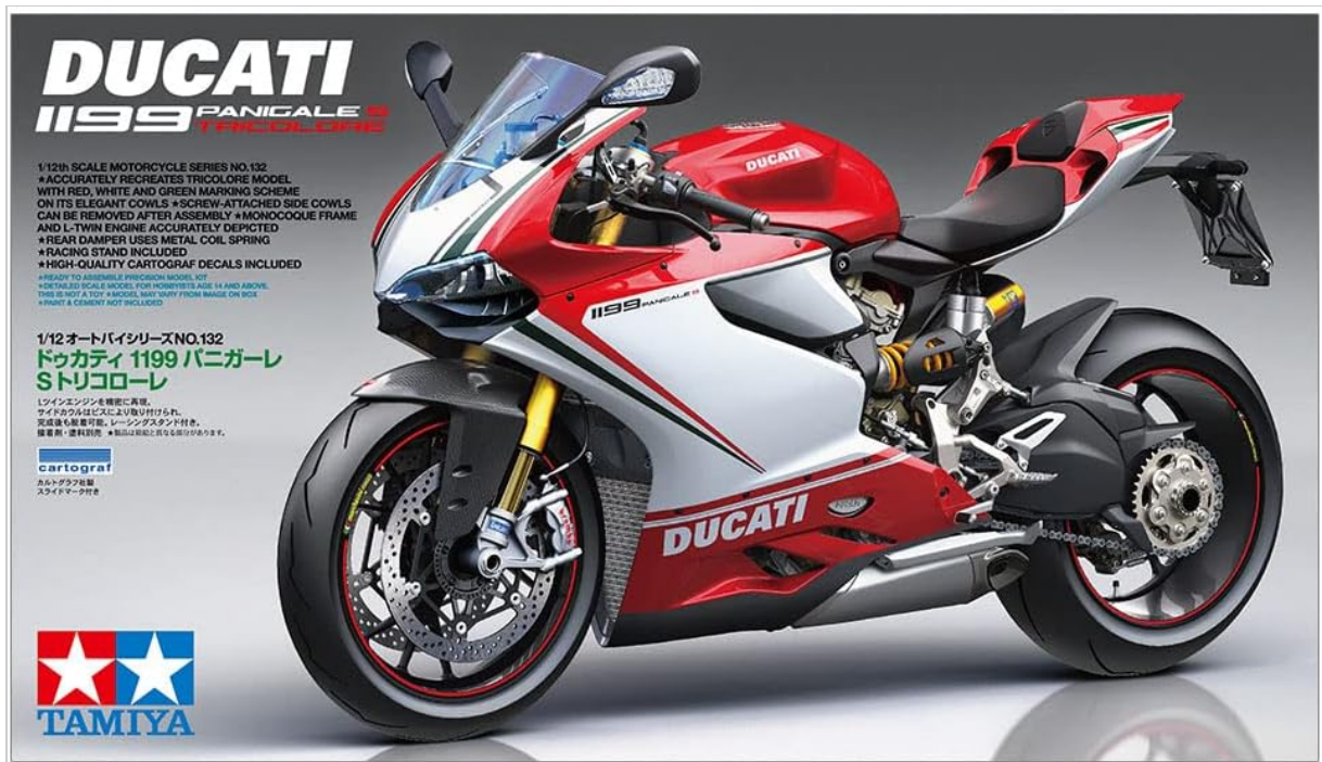
Figure 5: The completed model viewed from the front three-quarter angle, showcasing the iconic red, white, and green Tricolore livery. This view highlights the sleek lines and detailed front fairing.