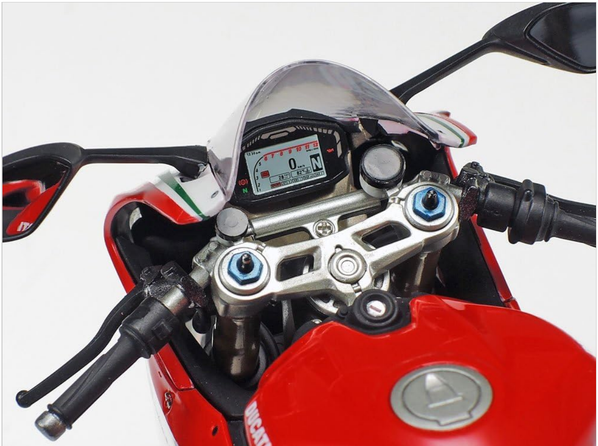
Figure 8: A detailed view of the model's cockpit, including the handlebars, brake levers, and the digital dashboard display. Decals are used to replicate the intricate dashboard graphics.