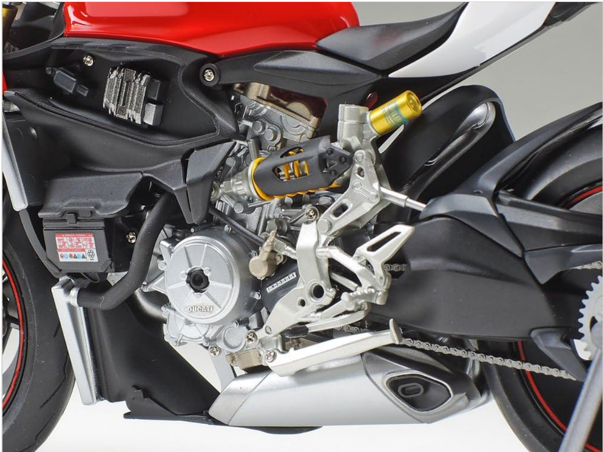
Figure 2: A close-up view of the assembled engine and frame, highlighting the intricate details of the engine block, exhaust manifold, and surrounding components. This stage requires precise alignment.