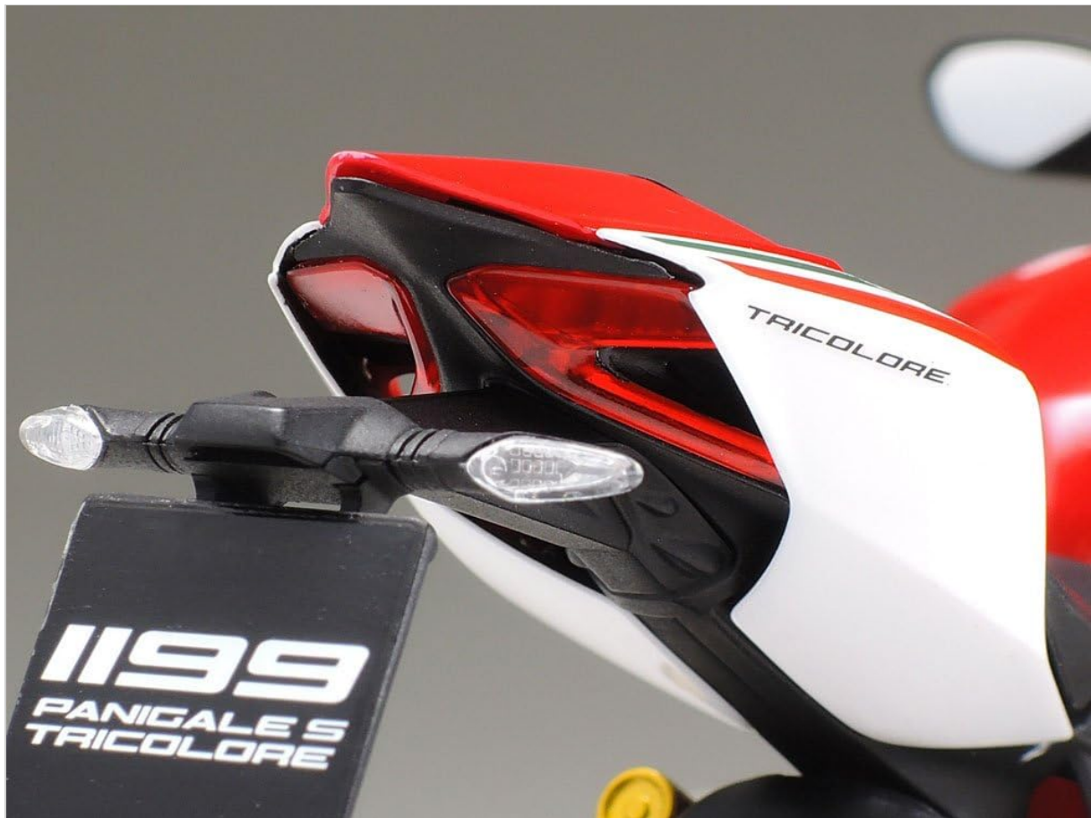
Figure 9: A close-up of the model's rear tail section, showing the taillight, license plate holder, and the 'Tricolore' branding. This area also utilizes decals for fine details.