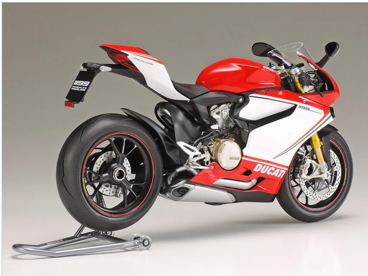
Figure 6: The completed model viewed from the rear three-quarter angle, emphasizing the tail section, exhaust, and rear wheel. The display stand is visible, supporting the model.