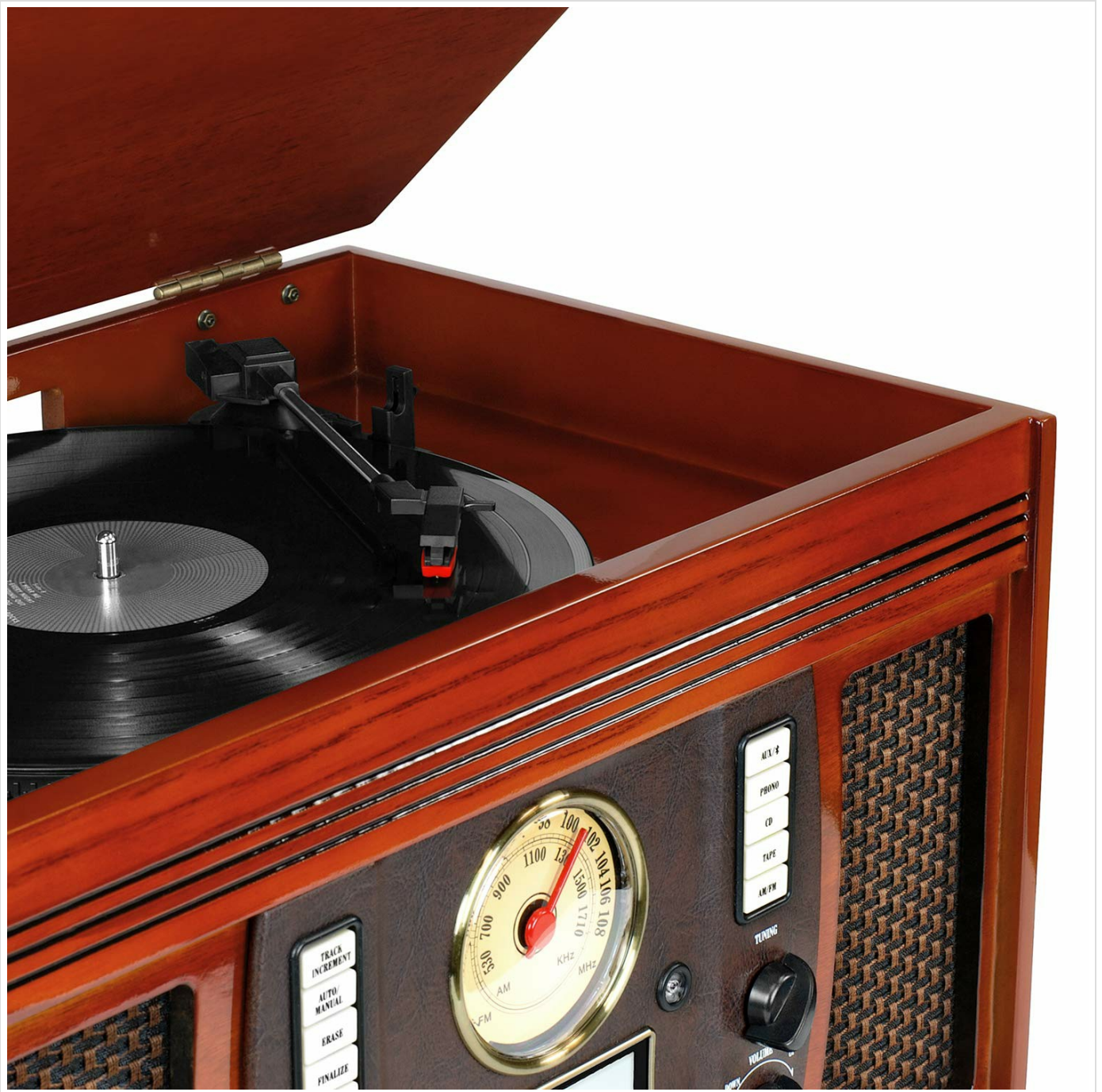
Figure 2: Turntable Mechanism. A detailed view of the turntable platter, spindle, and tonearm assembly. The stylus is visible at the end of the tonearm, ready to play a record. The 45 RPM adapter is not shown but would be placed on the spindle for larger hole records.