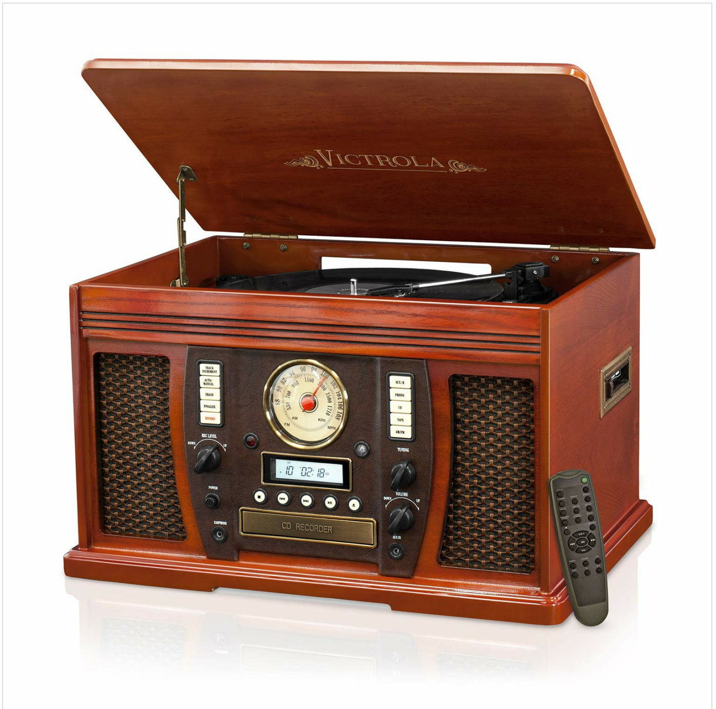
Figure 1: Overall View of the Victrola VTA-750B+-MAH. This image displays the complete unit with the lid open, revealing the turntable. The front panel features the radio tuner, display, and various control buttons. The remote control is positioned to the right of the unit.