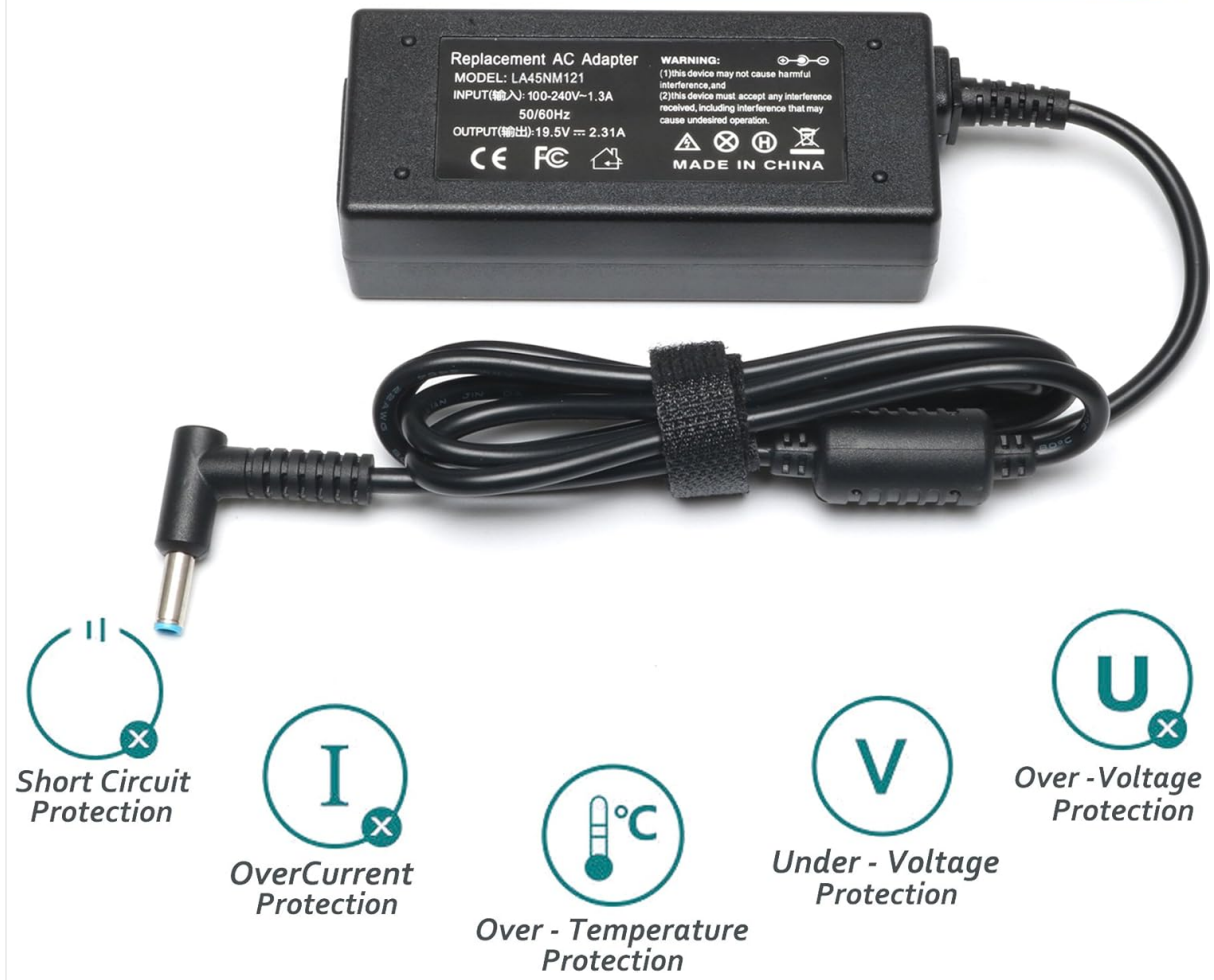
Figure 3.2: Multi-protection features of the Emaks charger.