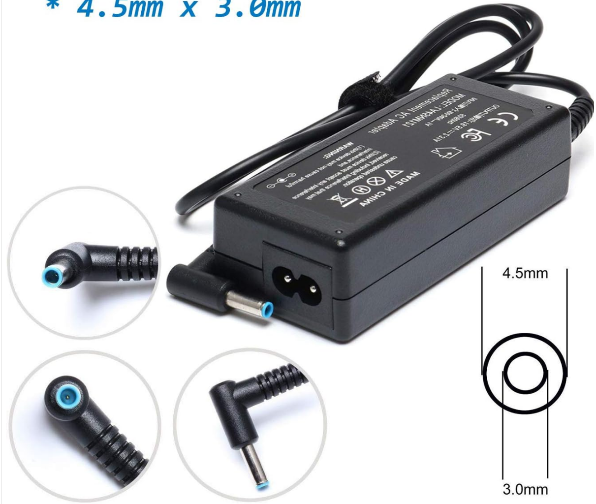
Figure 5.1: Detailed view of the 4.5mm x 3.0mm connector size.