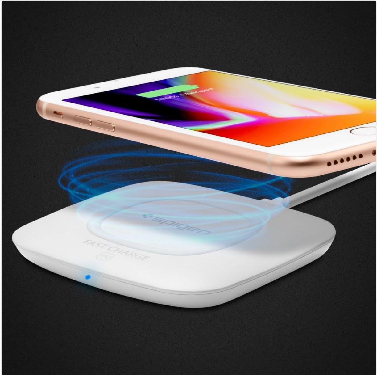
Image: A smartphone placed on the Spigen F301W charging pad, showing the wireless charging process with blue light waves.