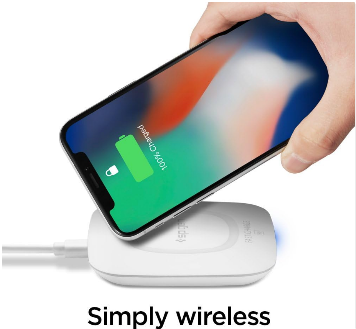
Image: A hand placing an iPhone X onto the Spigen F301W charging pad, illustrating the simplicity of wireless charging.