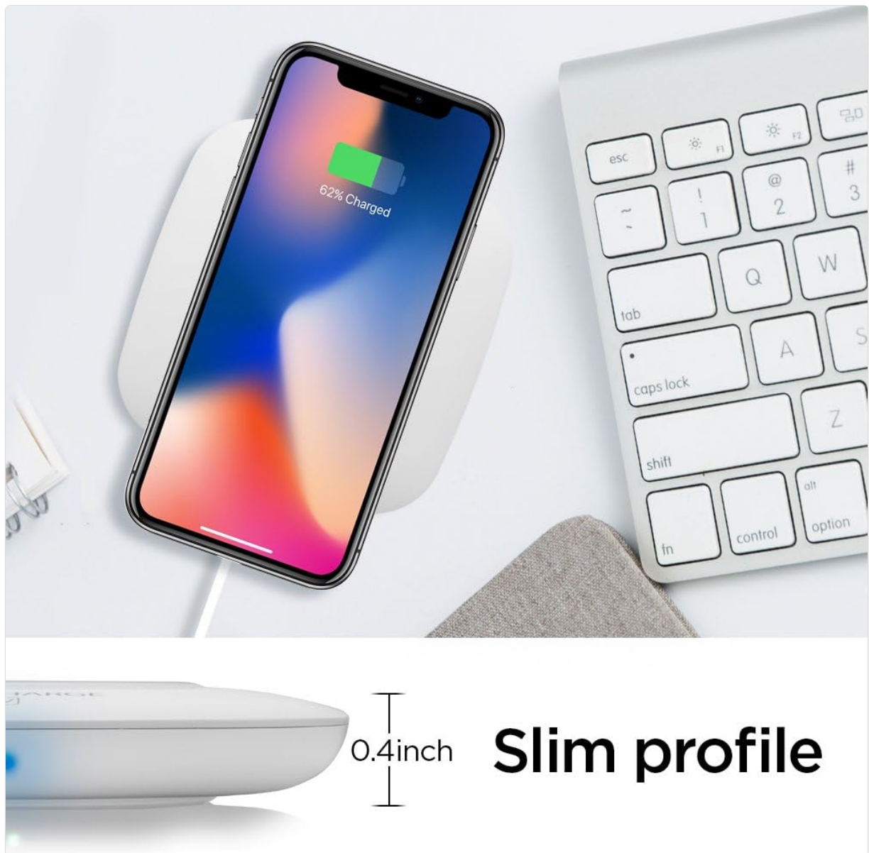
Image: A side view of the Spigen F301W, highlighting its slim 0.4-inch profile.