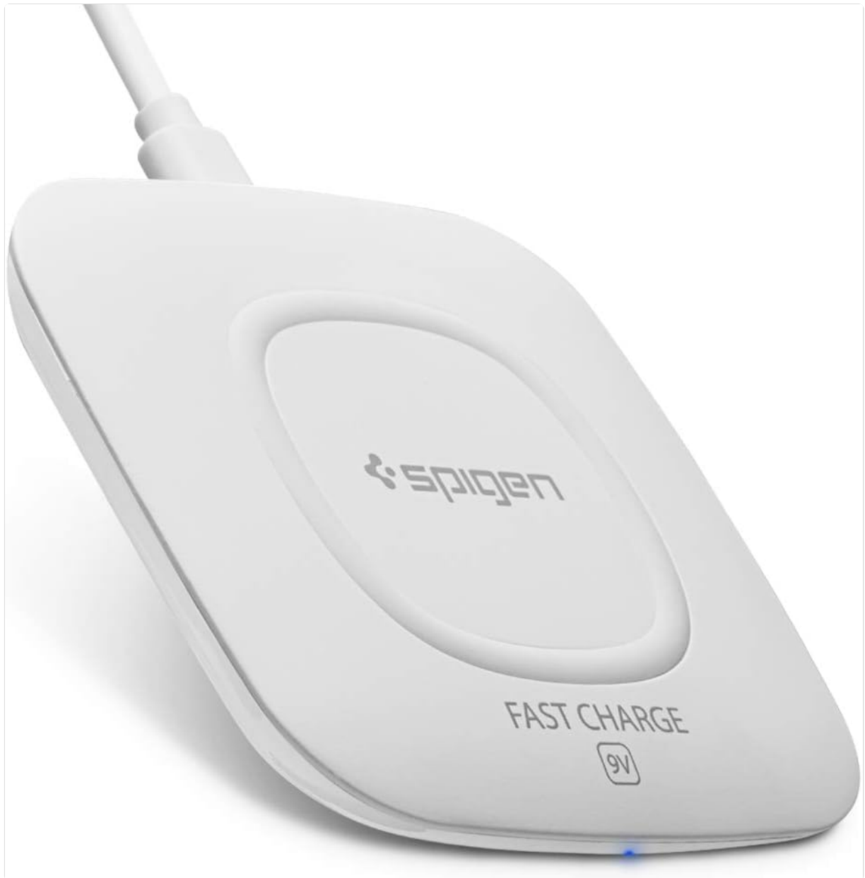
Image: The Spigen Essential F301W wireless charging pad, showcasing its compact and sleek design.