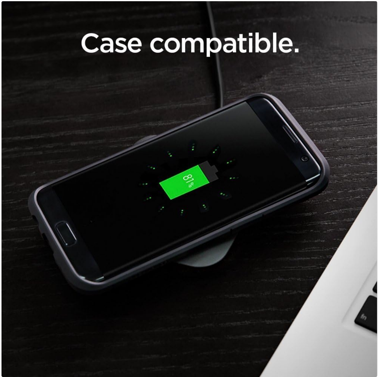
Image: A smartphone with a protective case charging on the Spigen F301W, demonstrating its case compatibility.