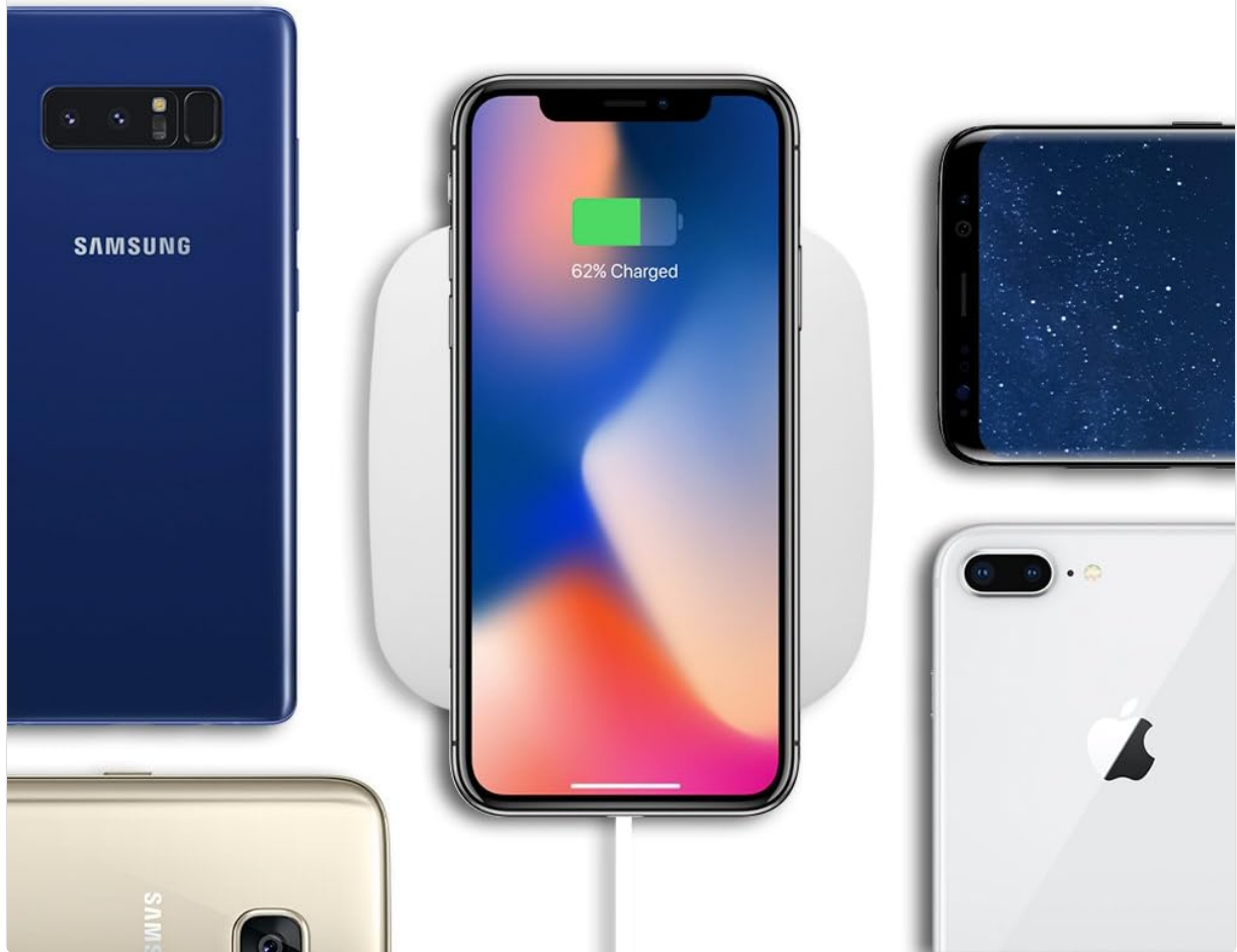
Image: Multiple Qi-enabled devices, including Samsung and iPhone models, positioned around the Spigen F301W, indicating broad compatibility.