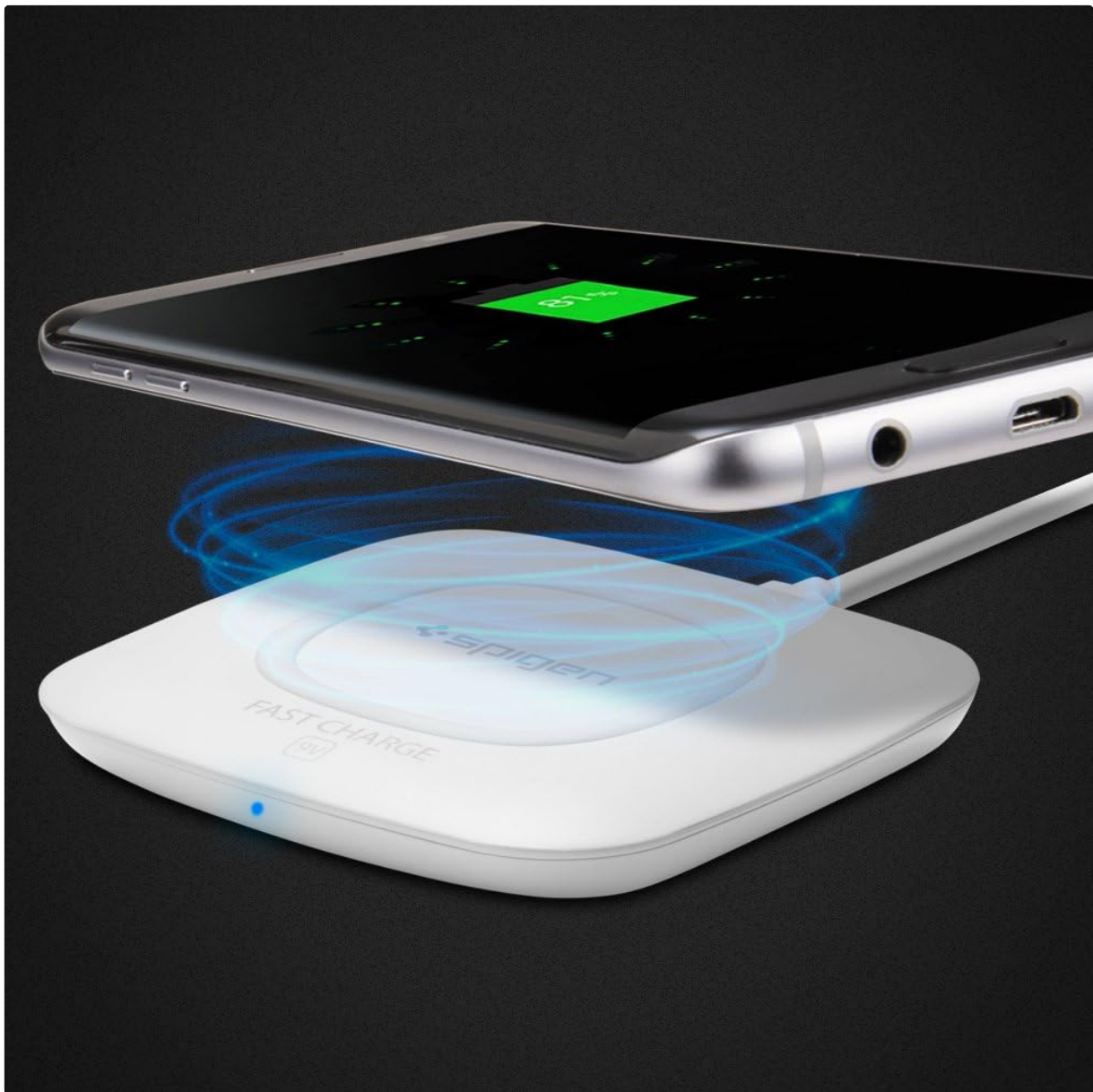
Image: Illustration of the Spigen F301W wireless charging pad and its included 5-foot Micro5pin USB cable.