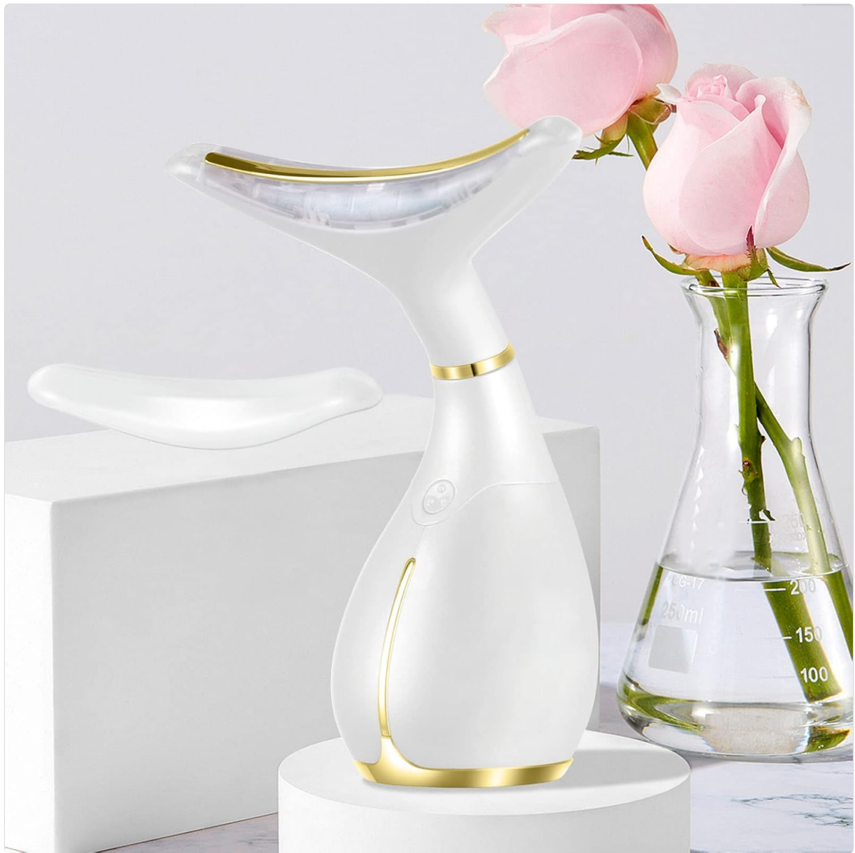
Figure 4.4: Illustrative comparison of skin care product absorption rates with and without the use of the Ms.W Face Massager.