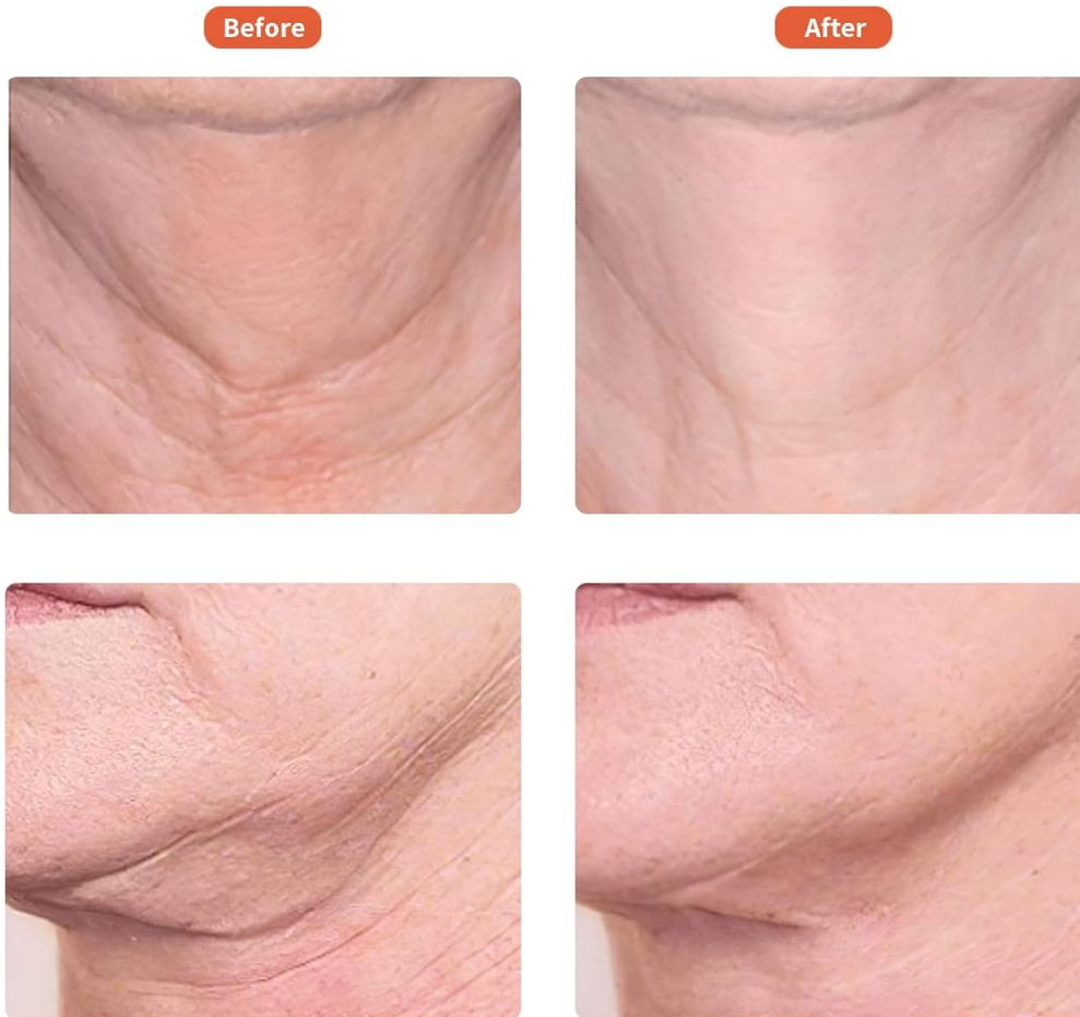
Figure 4.5: Illustrative examples of skin appearance before and after consistent use of the device, showing potential improvements in fine lines and skin texture.

Experimental results show that long-term use can reduce your fine lines, double chins, neck wrinkle and so on