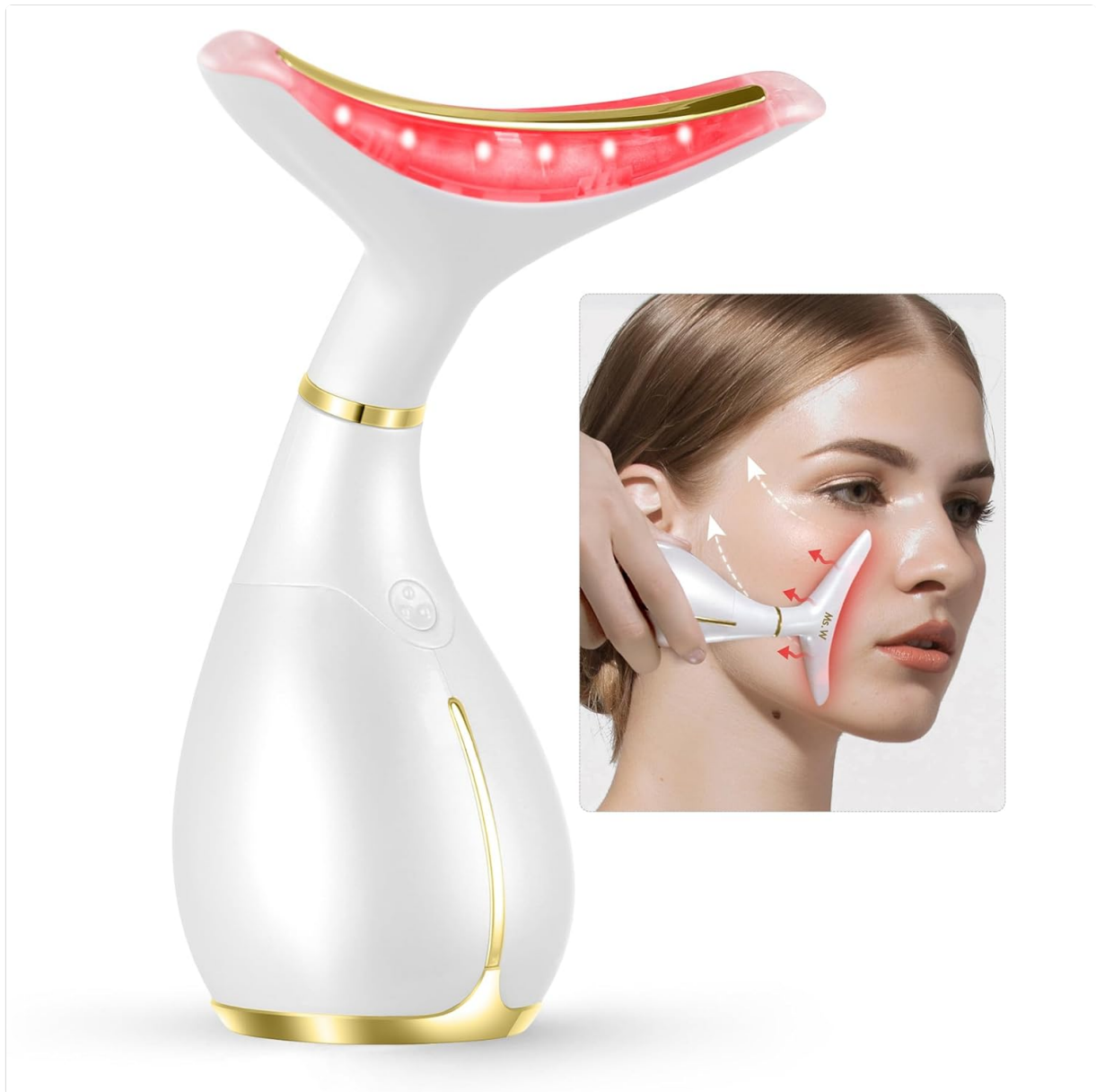
Figure 2.2: The Ms.W Face Massager device, shown with an illustration of its application on the face.