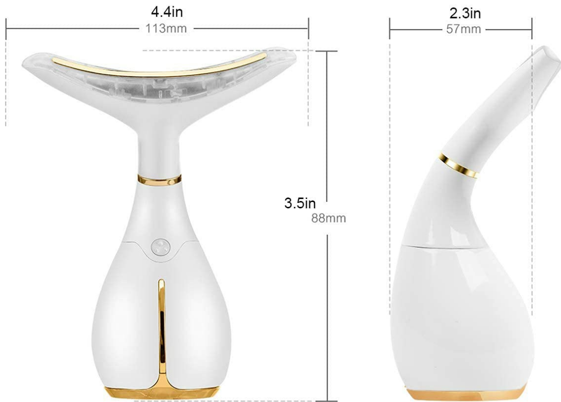
Figure 7.1: Diagram illustrating the dimensions of the Ms.W Face Massager.