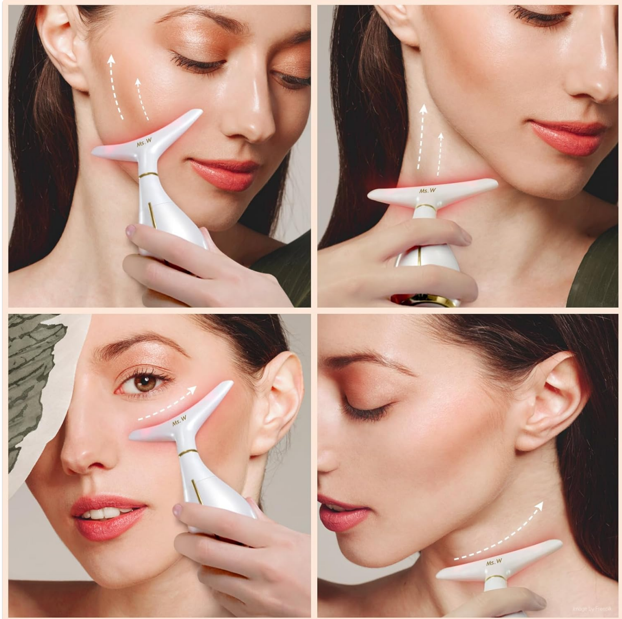
Figure 4.2: Visual guide demonstrating various application techniques for the Ms.W Face Massager on the face and neck.

Apply the device to your face and neck, adjusting to different massage points. Move the device gently in upward and outward strokes, following the contours of your face and neck. The device may provide an audible signal (e.g., a beep) to indicate when to change the massage area, typically every 60 seconds.