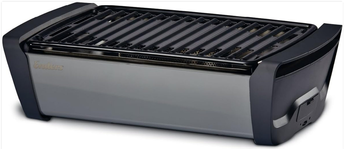
Image: The Enders Aurora Low-Smoke Table Barbecue, showcasing its sleek grey design and compact form factor, ready for tabletop use.

The Enders Aurora is a compact, low-smoke table barbecue designed for convenient grilling. Its innovative E-FAN-BBQ fan technology ensures quick readiness and even heat distribution, making it ideal for use on balconies, during picnics, or camping trips.