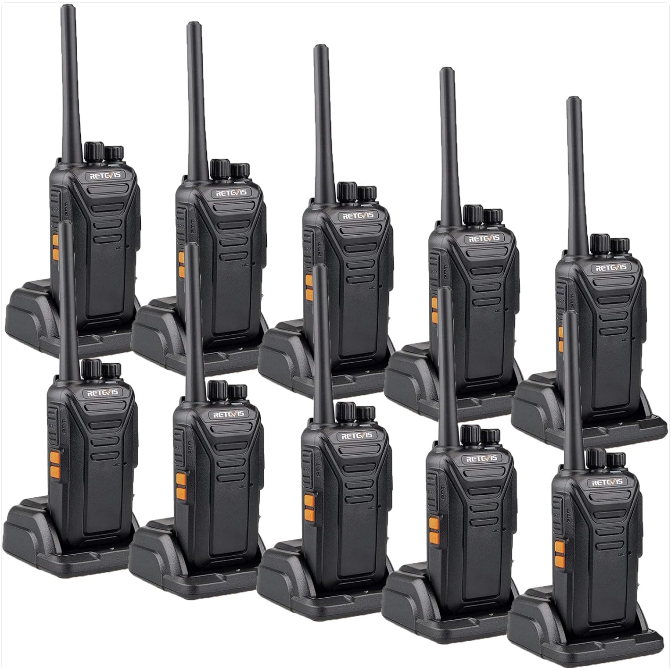
Figure 1: Retevis RT27 Walkie Talkies with charging bases.