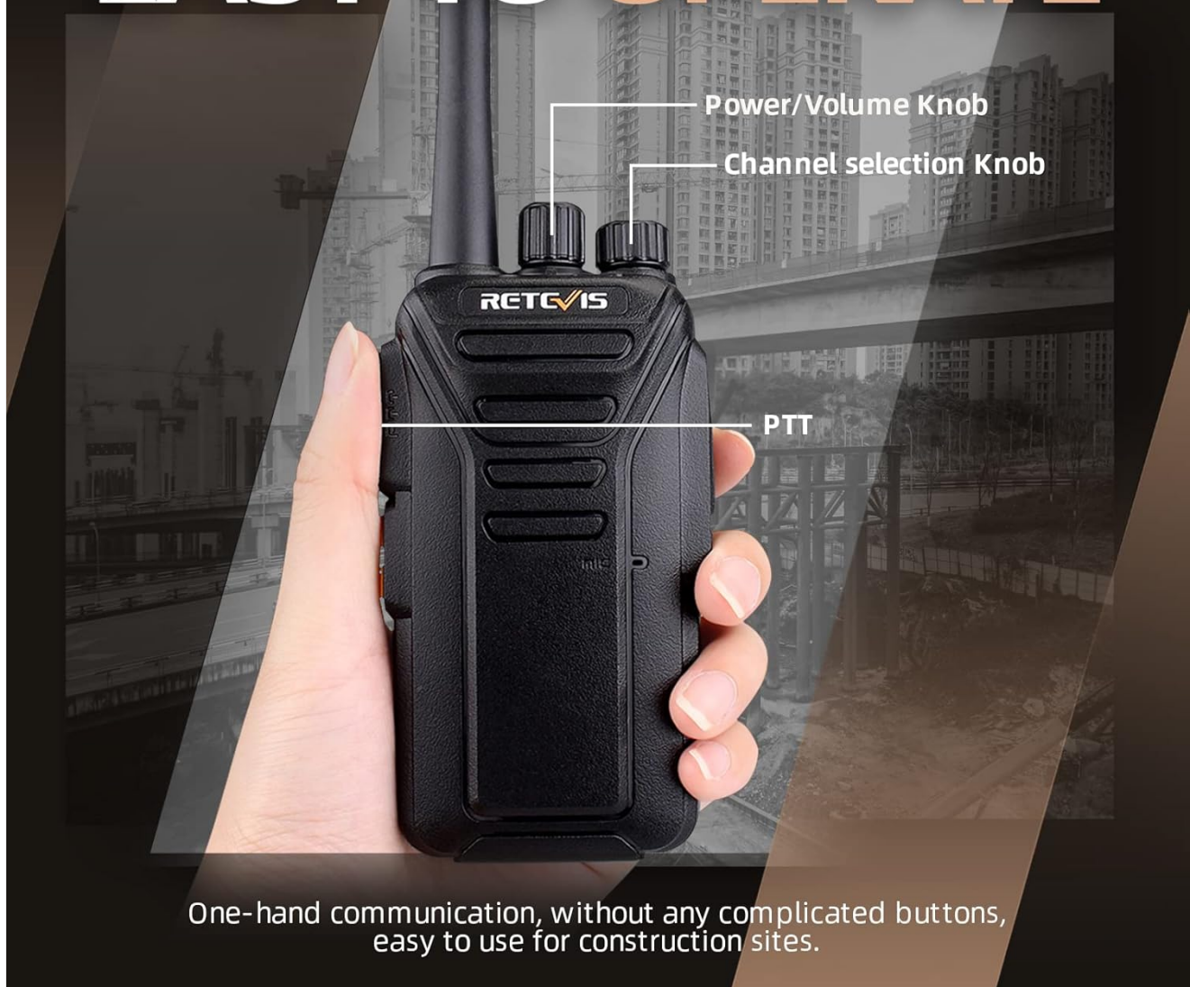
Figure 9: Location of Power/Volume and Channel knobs.