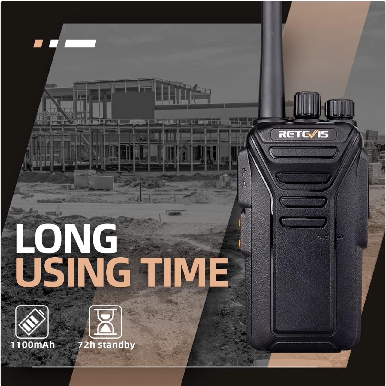
Figure 5: Extended battery life for prolonged use.