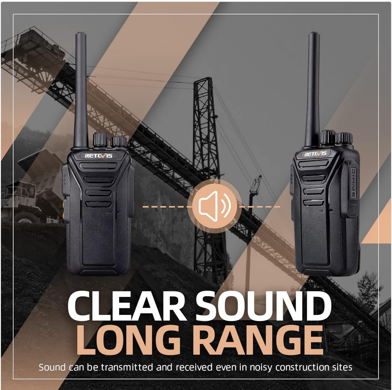
Figure 4: Clear sound and long range capabilities.