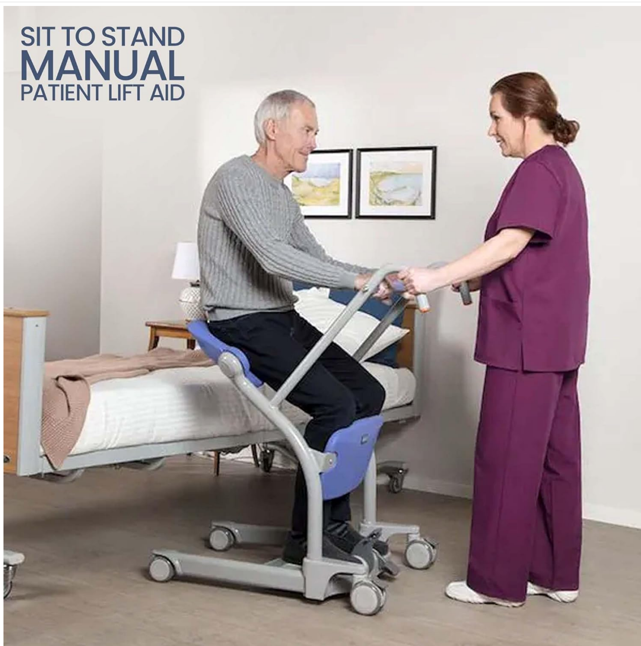
Figure 5.2: A caregiver assisting a user to stand from a bed using the Sara Stedy.