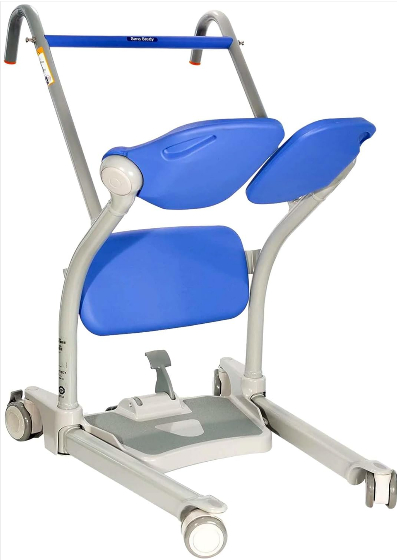
Figure 3.1: Overview of the ArjoHuntleigh Sara Stedy patient lift aid.