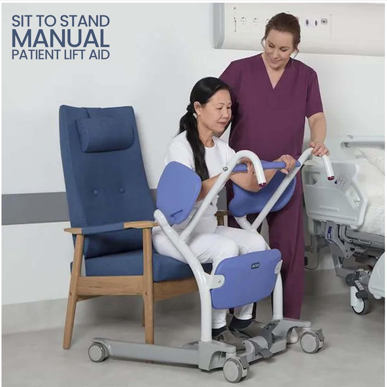
Figure 5.1: A caregiver assisting a user to stand from a chair using the Sara Steady.