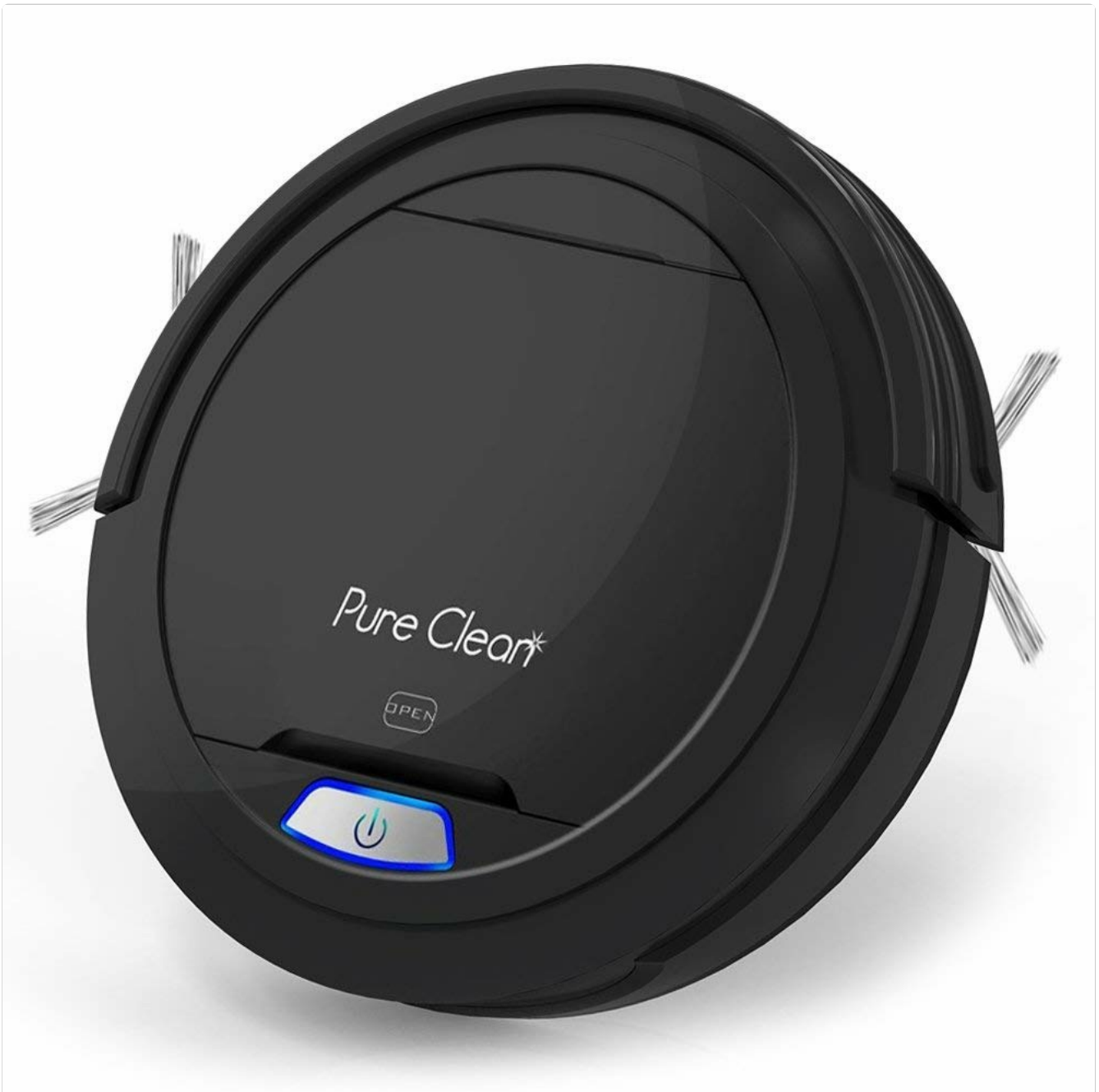
Image 1: Top view of the SereneLife PUCRC26B Robot Automatic Vacuum Cleaner, showing the "Pure Clean" logo and power button.

Familiarize yourself with the components of your robot vacuum.