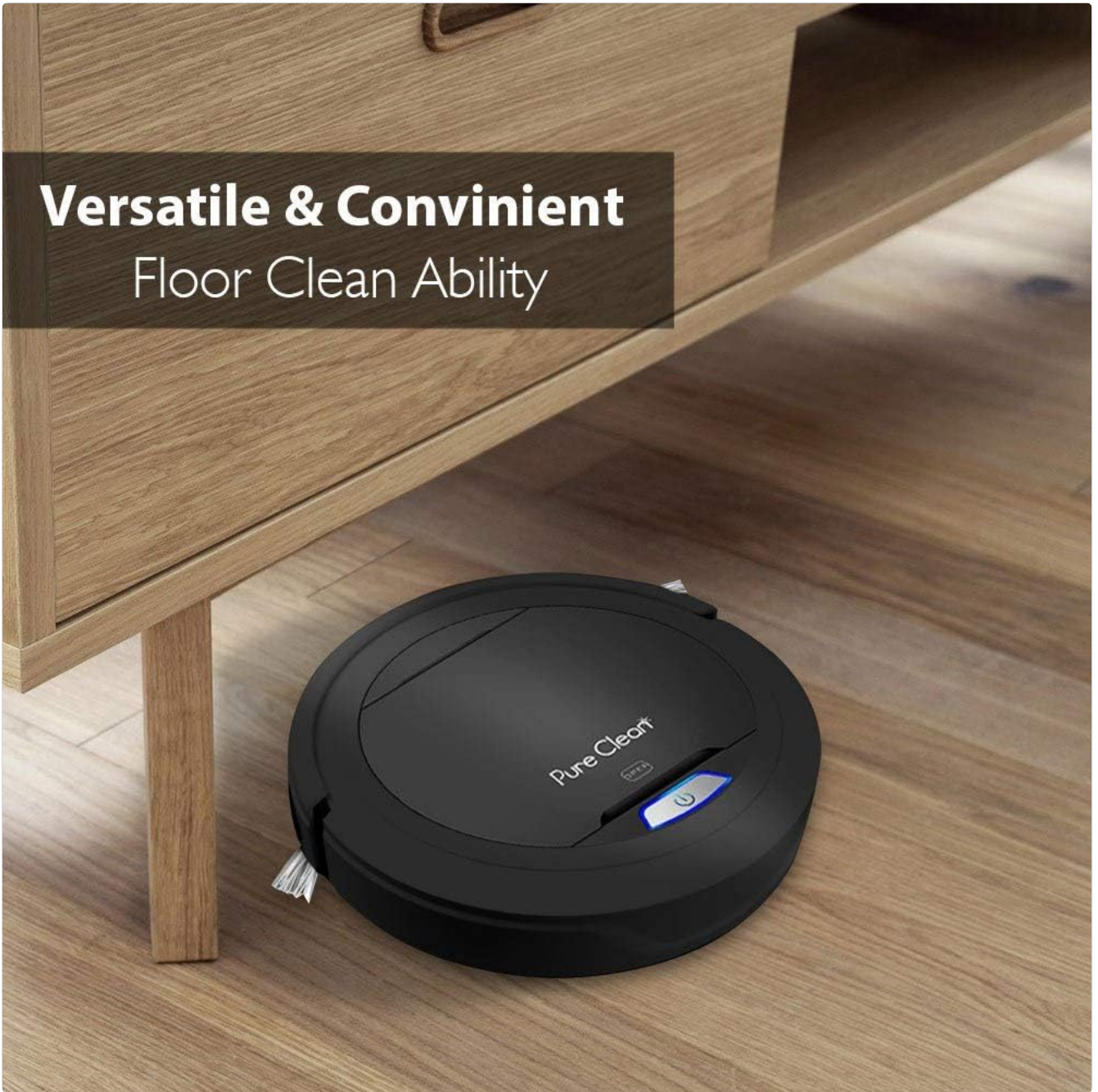
Image 3: The SereneLife PUCRC26B Robot Automatic Vacuum Cleaner cleaning under a wooden cabinet, demonstrating its low-profile design and ability to reach tight spaces.