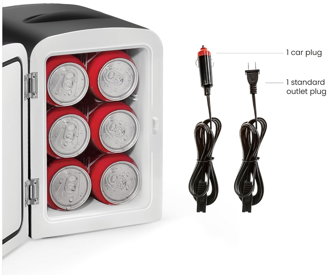
Image: The Chefman Iceman Mini Portable Fridge showing its two power cords: one for standard home outlets and one for 12V car chargers.

Includes plugs for both standard home outlets and 12V car chargers.