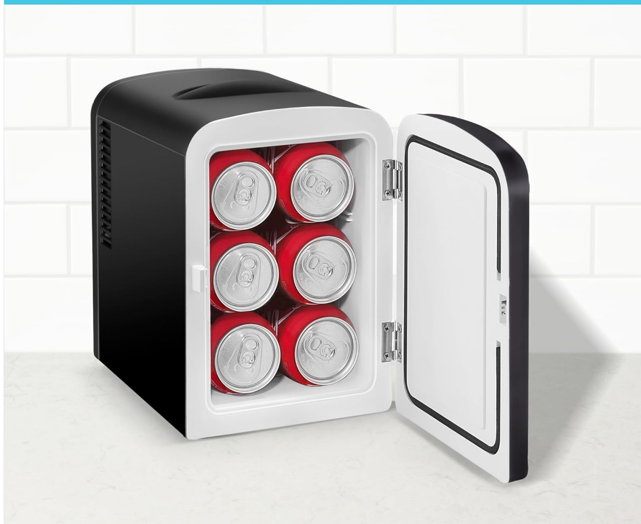
Image: The Chefman Iceman Mini Portable Fridge with its door open, showing six 12-oz beverage cans neatly stored inside.

4-liter capacity chills six 12 oz cans and includes a removable shelf.