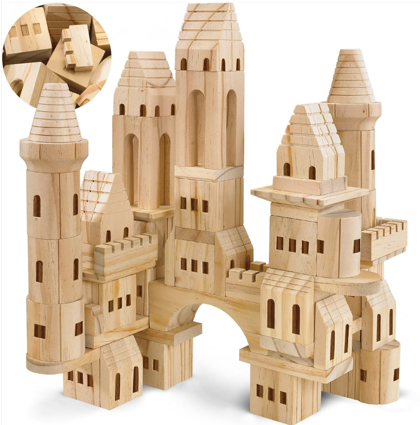
Image: An example of a castle built using the 75-piece wooden block set.