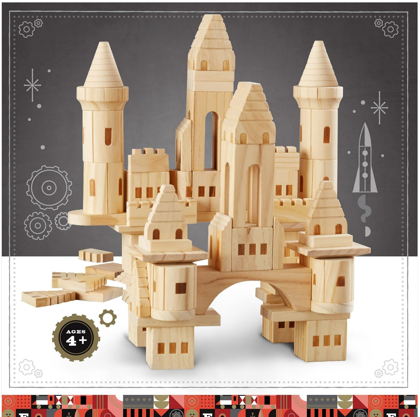
Image: Recommended age for the building block set.