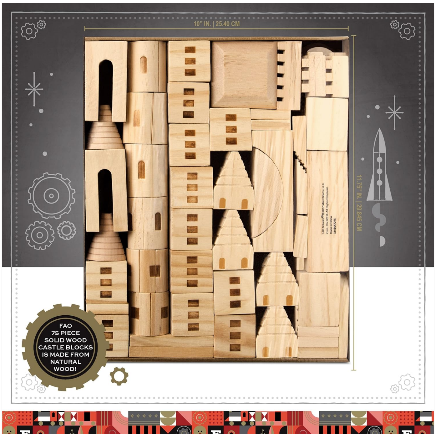
Image: Contents of the 75-piece wooden block set, showing the different block types.