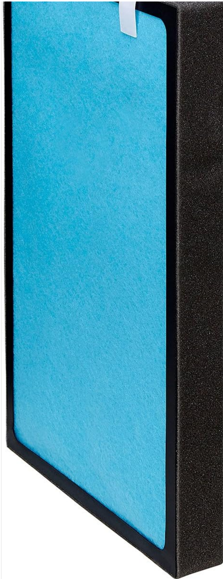
Image 1: Pro Breeze PB-P01 Replacement Filter. This image shows the filter from a side angle, highlighting its multi-layered structure with a prominent blue layer.