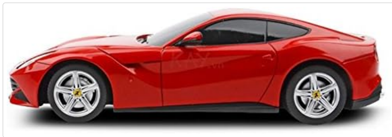
Image 5.1: Side view of the Rastar Ferrari F12 remote control car.