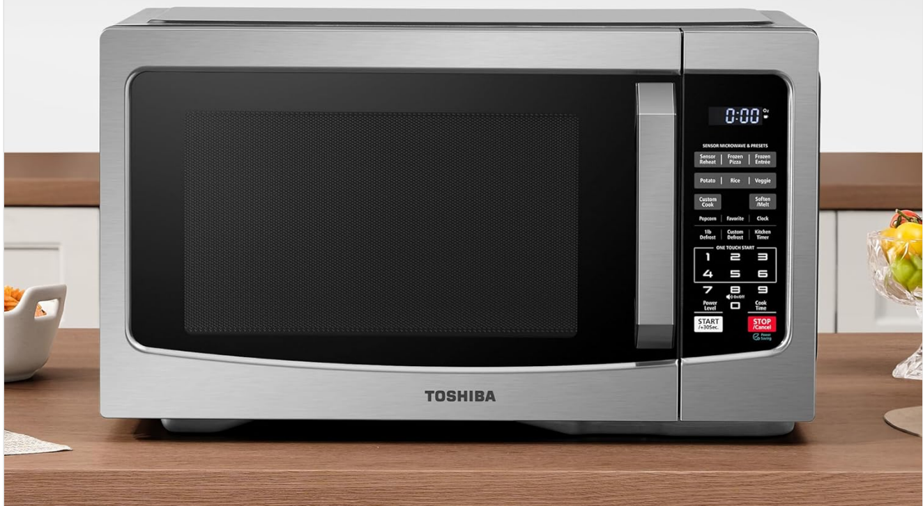
Figure 1.2: Overview of key features including 1000W microwave power, Sensor Cook, Auto Menu, and Easy Defrost functions.