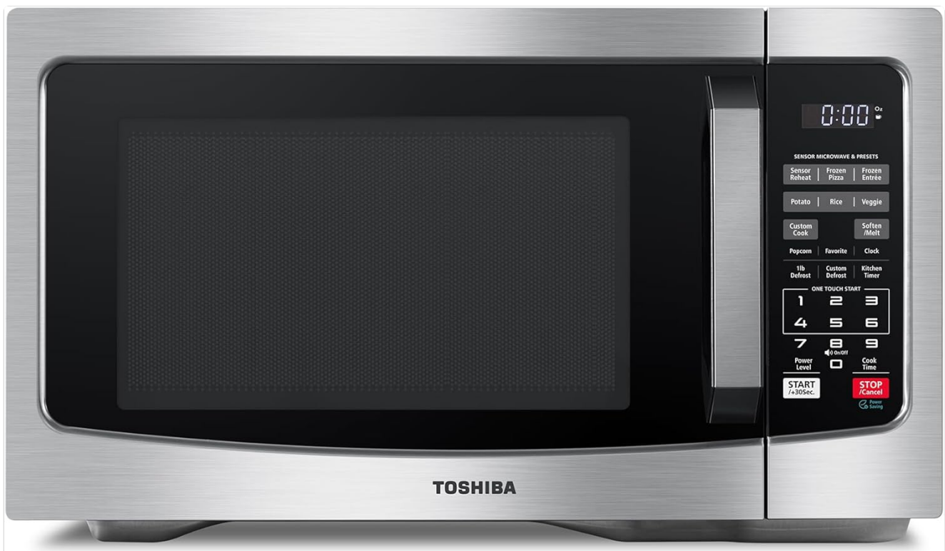
Figure 1.1: Front view of the Toshiba EM131A5C-SS Countertop Microwave Oven in stainless steel finish.

The TOSHIBA EM131A5C-SS is a 1.2 cubic feet, 1000-watt countertop microwave oven designed for efficient and convenient cooking. It features a smart humidity sensor, 12 auto menus, a mute function, and an easy-to-clean stainless steel interior. This microwave is ideal for apartment kitchens or office break rooms, offering versatile cooking options with user-friendly controls.