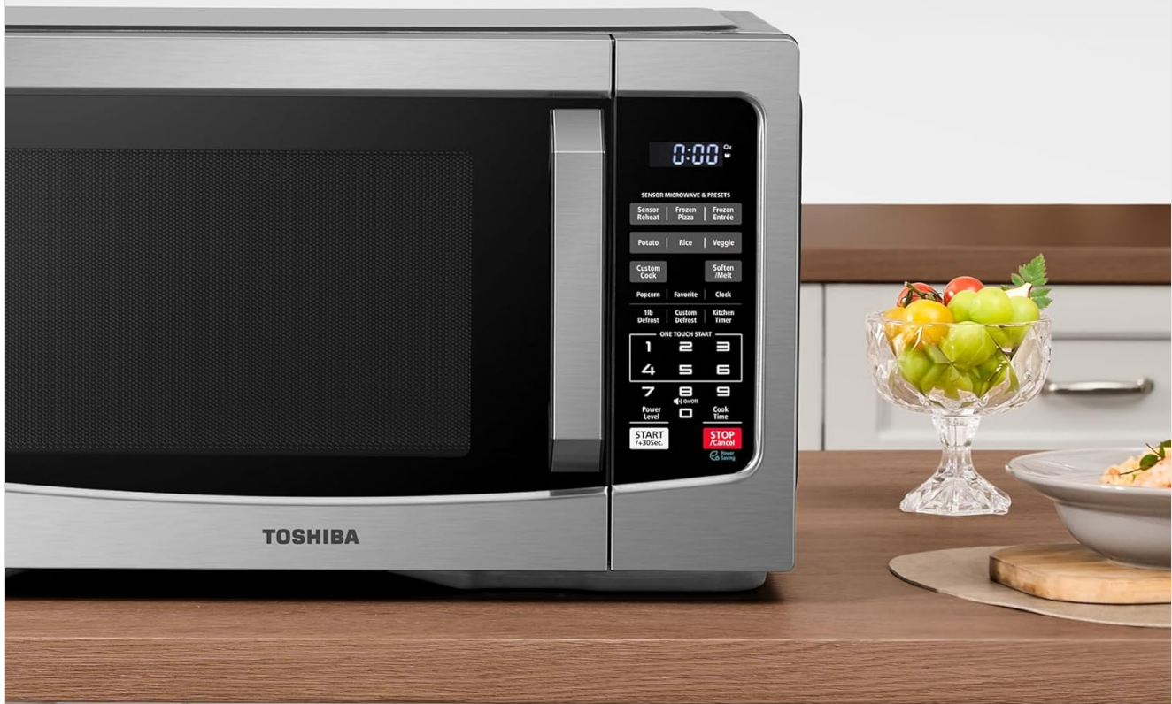
Figure 4.1: The control panel features a digital display, power level settings, and various one-touch start options.

The 10 adjustable power levels of the microwave allow for precise cooking and heating control