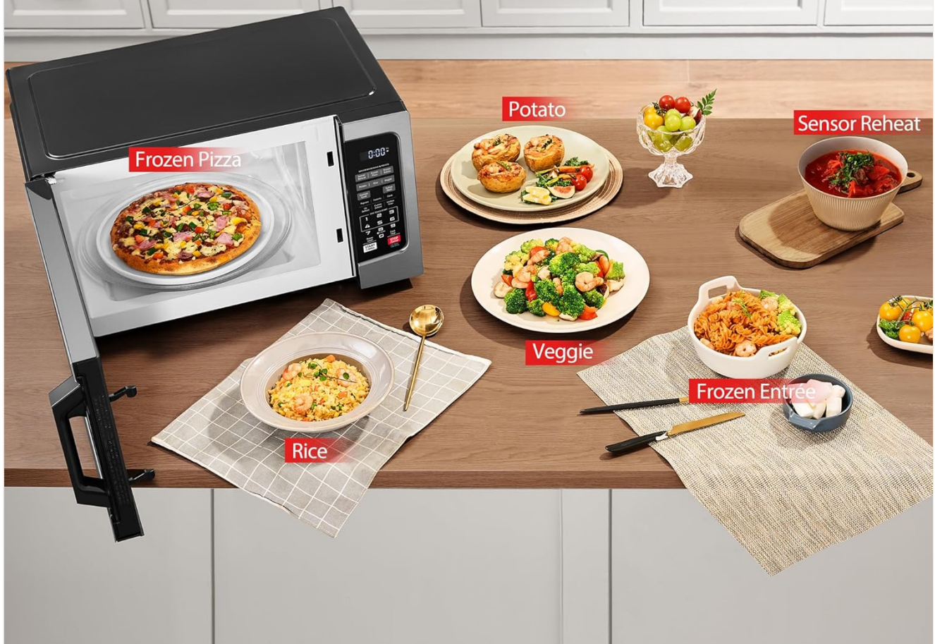
Figure 4.3: Visual representation of the 6 Sensor Cook Auto Menus for convenient cooking.

Enjoy easy and convenient cooking with 6 sensor cook auto menus