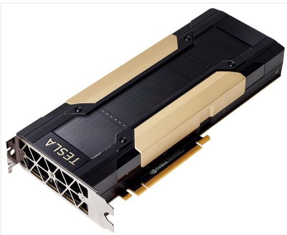
Figure 2.1: Front-side view of the PNY Nvidia Tesla V100 16GB GPU, showcasing its black and gold design with "TESLA" branding.