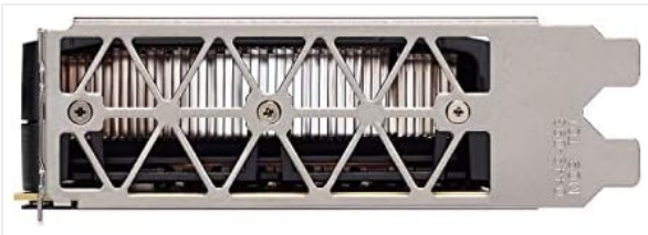
Figure 2.3: Rear view of the Tesla V100, showing the exhaust vents for heat dissipation and the PCIe bracket.