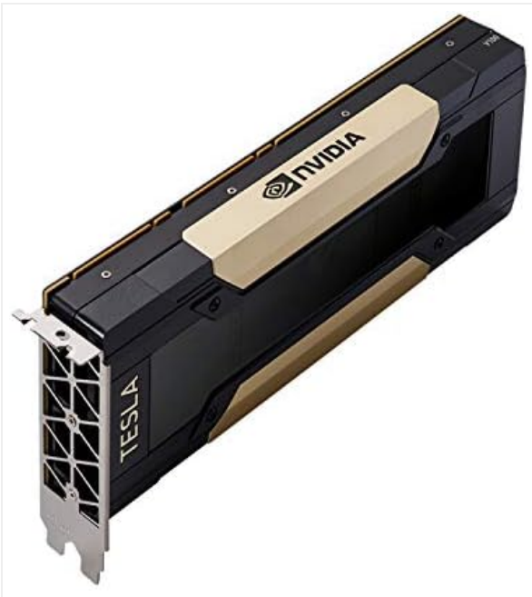
Figure 2.2: Angled view of the Tesla V100, highlighting the NVIDIA logo and the card's robust casing.