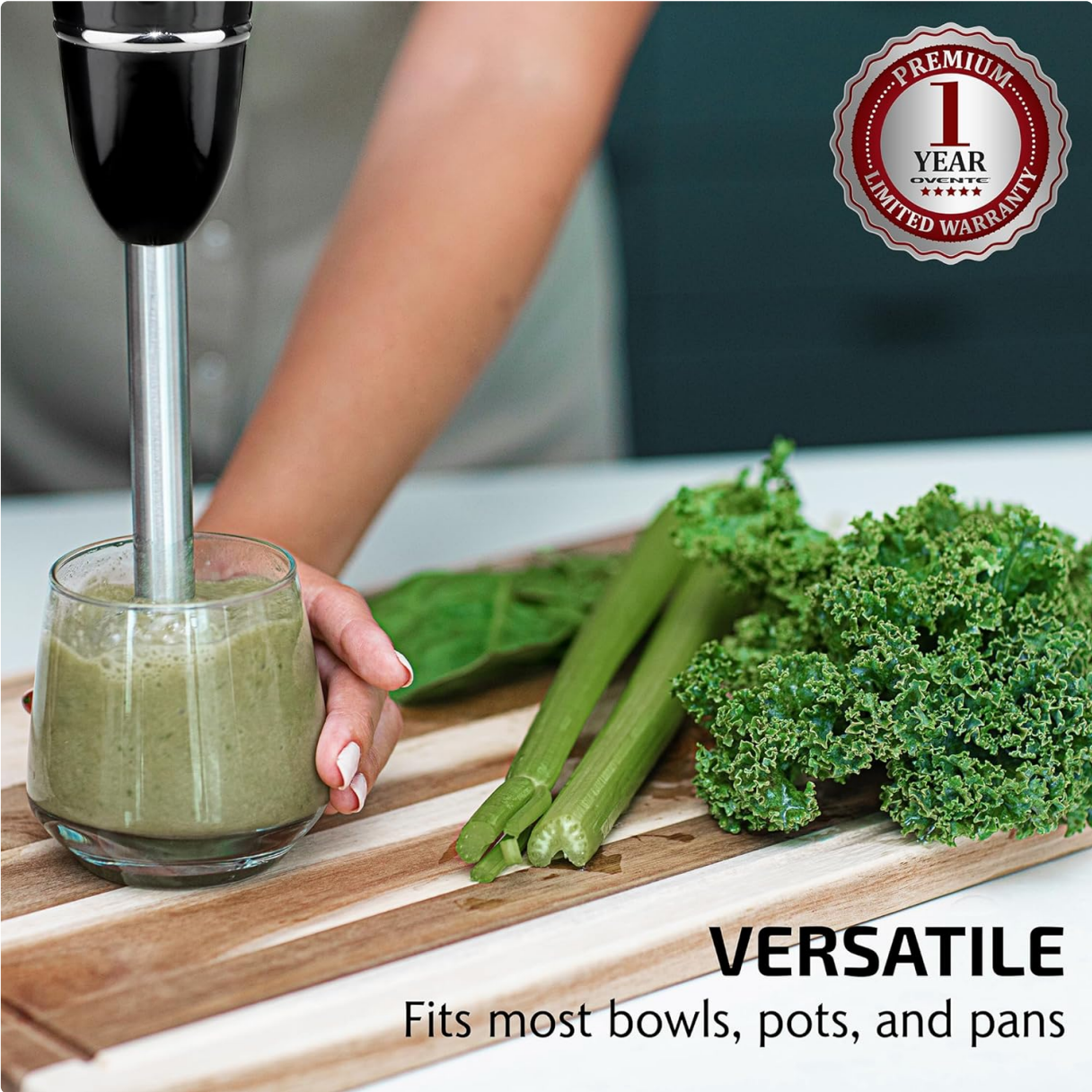
Image 7.1: The OVENTE Immersion Hand Blender illustrating its compact dimensions for easy handling and storage.