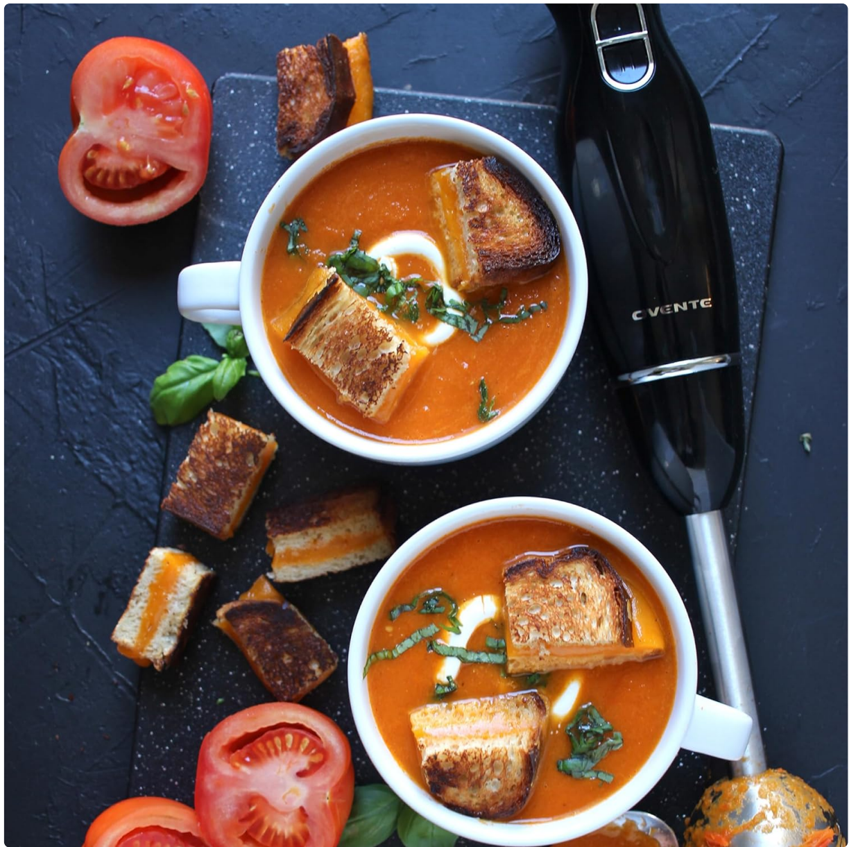
Image 4.3: An illustration of the blender's multi-use capabilities, showing it alongside smoothies, pancakes, and soup.