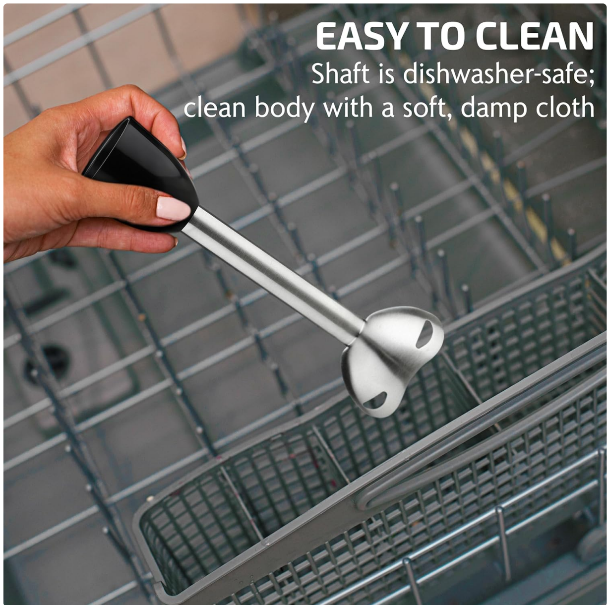
Image 3.1: The detachable blending shaft, ready to be connected to the motor body for assembly.