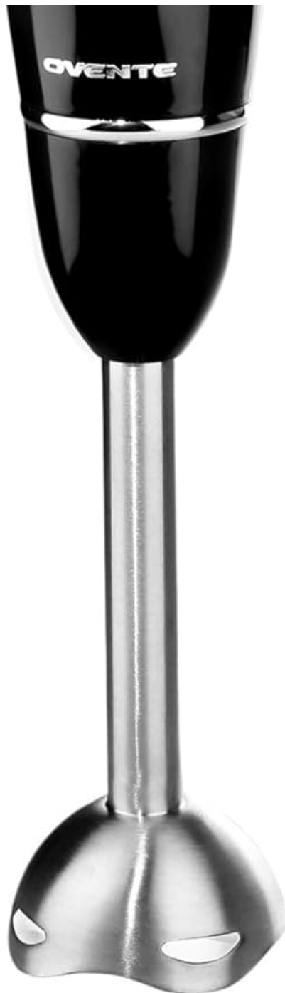
Image 1.1: OVENTE HS560B Immersion Hand Blender, showcasing its sleek black design and stainless steel blending shaft.