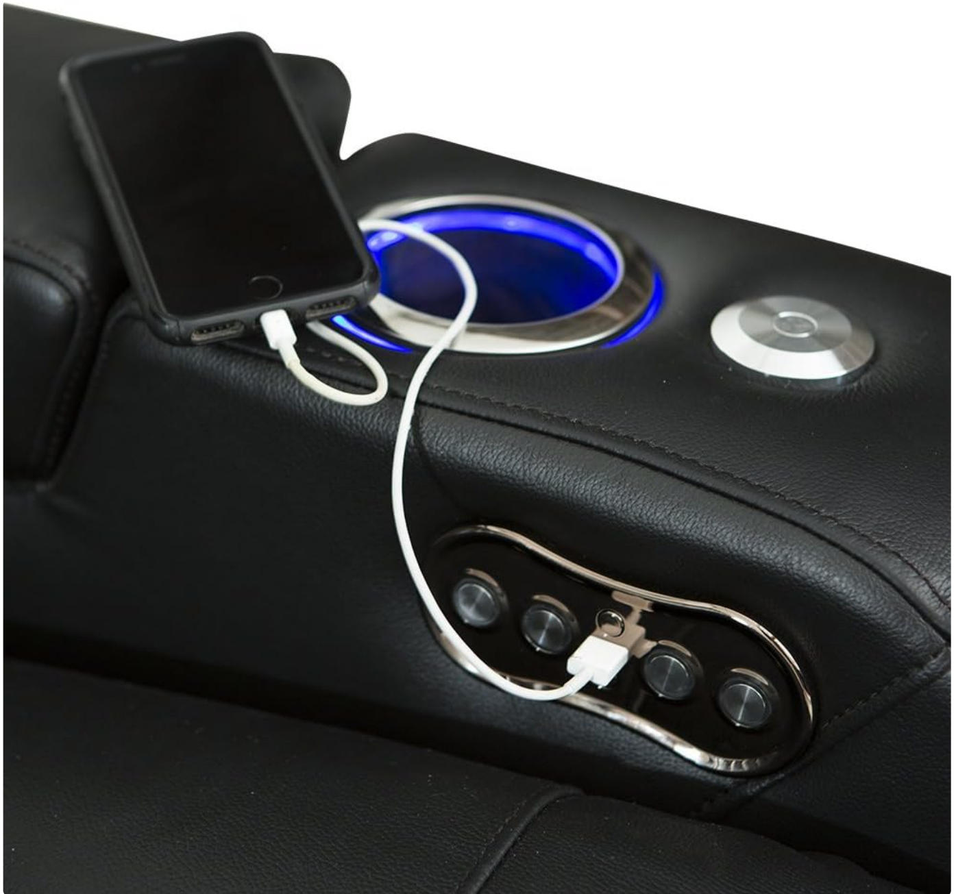
Figure 4: USB charging port and wireless charging pad on the fold-down table, with an illuminated cup holder.