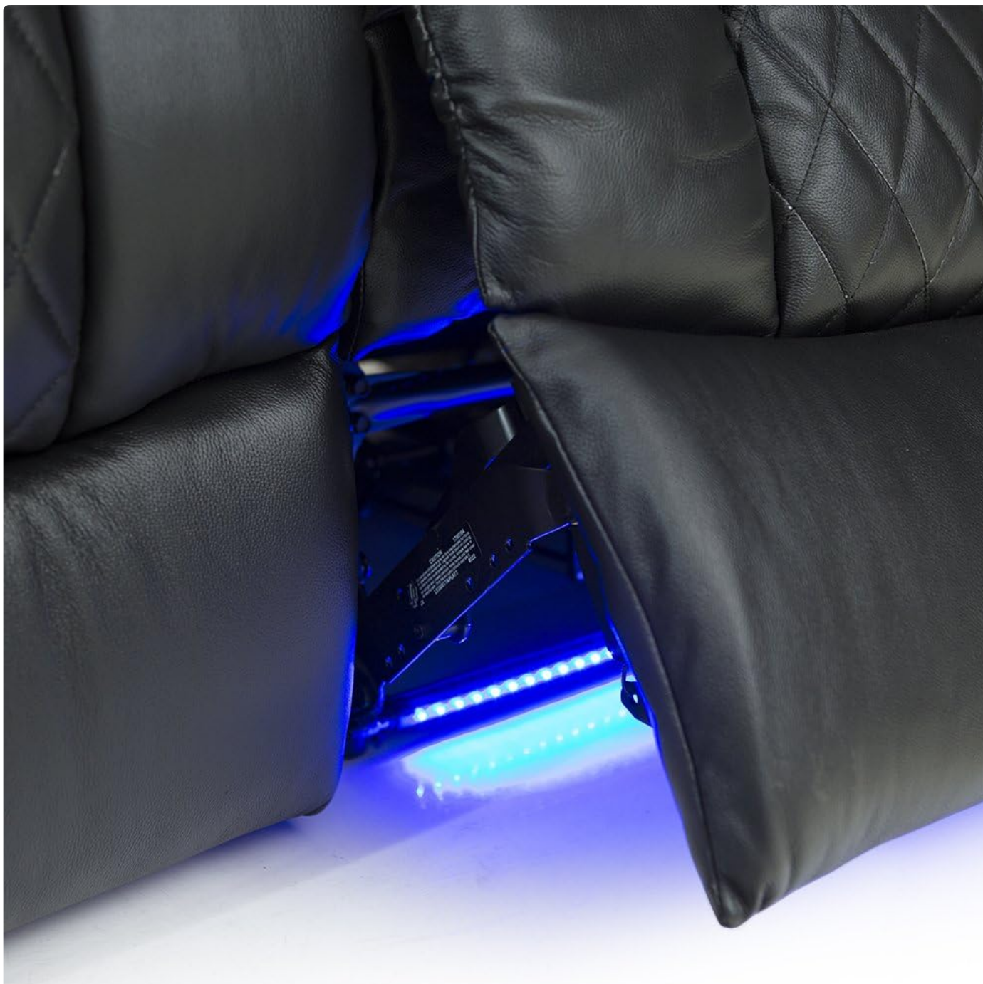
Figure 5: Ambient blue LED lighting along the base of the Seatcraft Anthem sofa, enhancing the home theater experience.