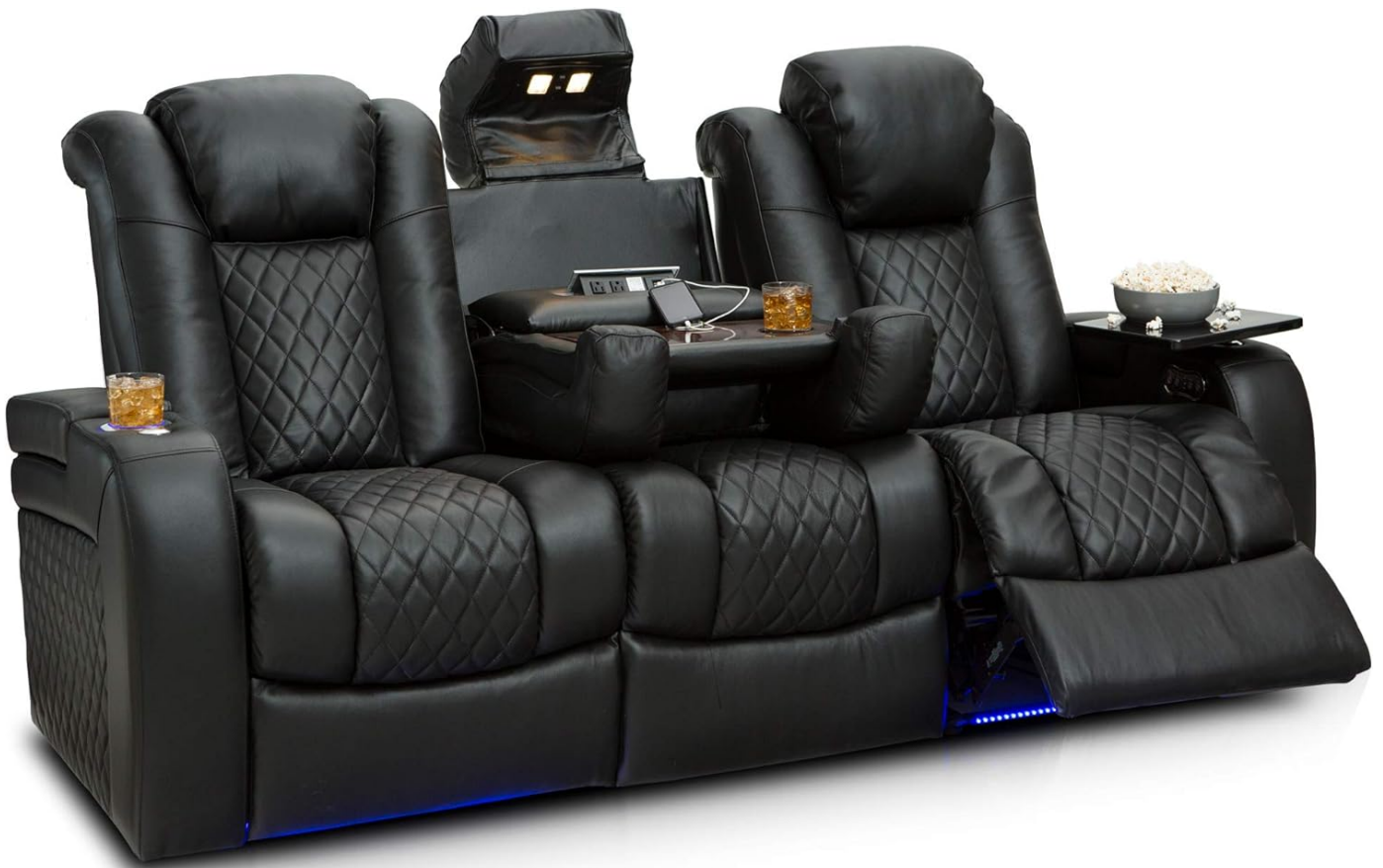
Figure 1: Seatcraft Anthem Home Theater Seating in black Italian leather, featuring a fold-down table, illuminated cup holders, and power recline.