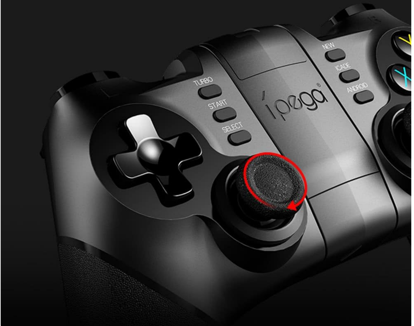
Figure 2: Close-up view of the 360° clickable analog stick, indicating precise control for gaming.

Support mouse touch, Android or PC platform to operate more convenient! Support mouse touch, Android or PC platform to operate more convenient!