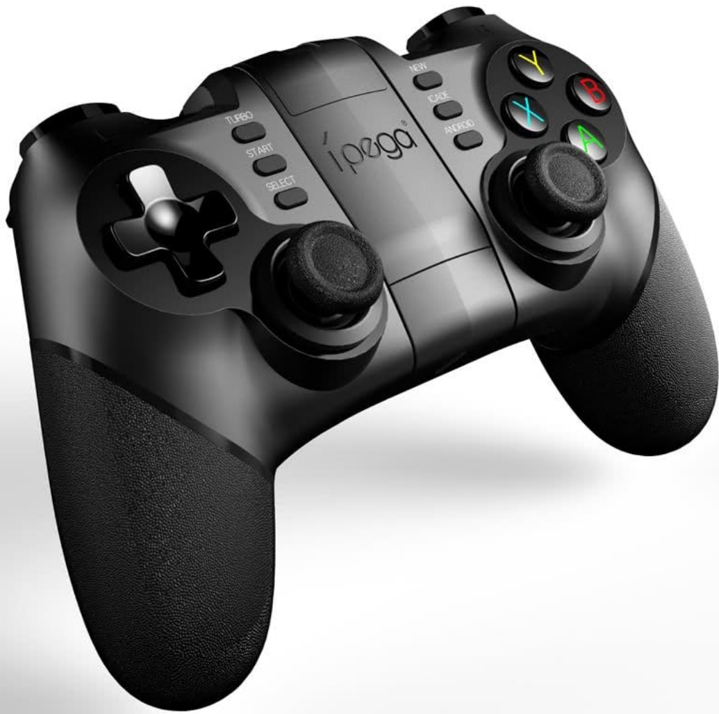
Figure 1: Front view of the IPEGA PG-9076 Game Controller, showcasing its ergonomic design and button layout.