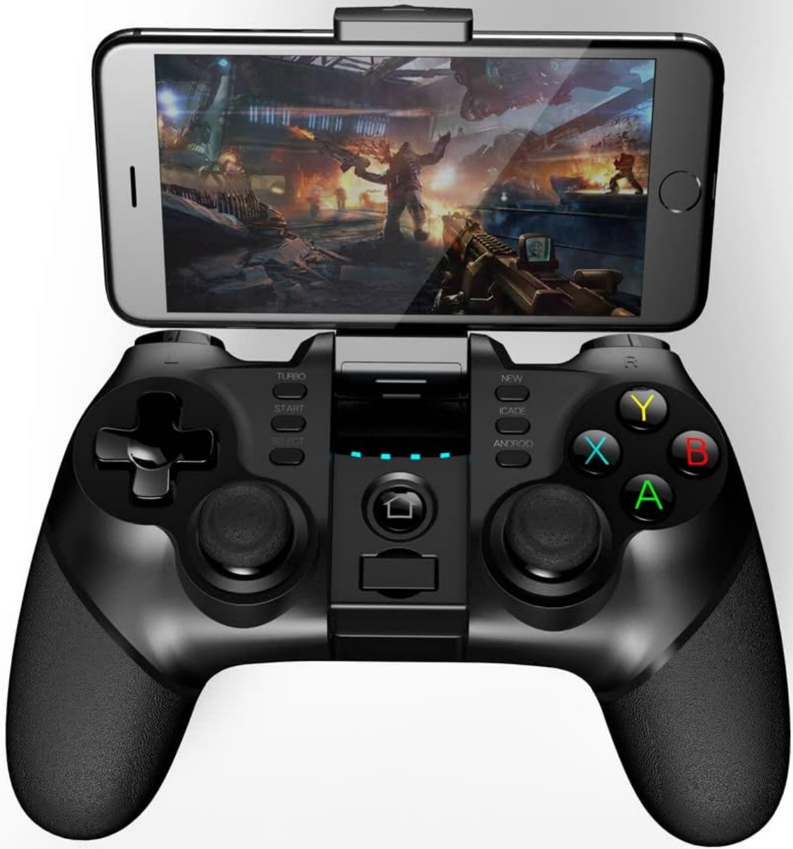
Figure 3: The controller with a smartphone securely mounted in the integrated holder, ready for mobile gaming.