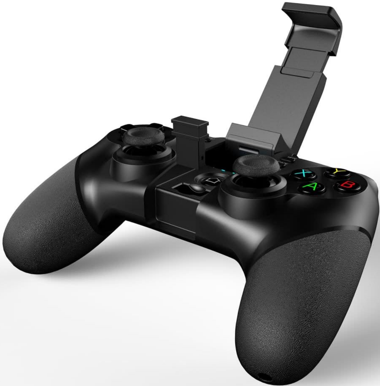
Figure 4: Side view demonstrating the extendable phone holder mechanism, allowing for various smartphone sizes.