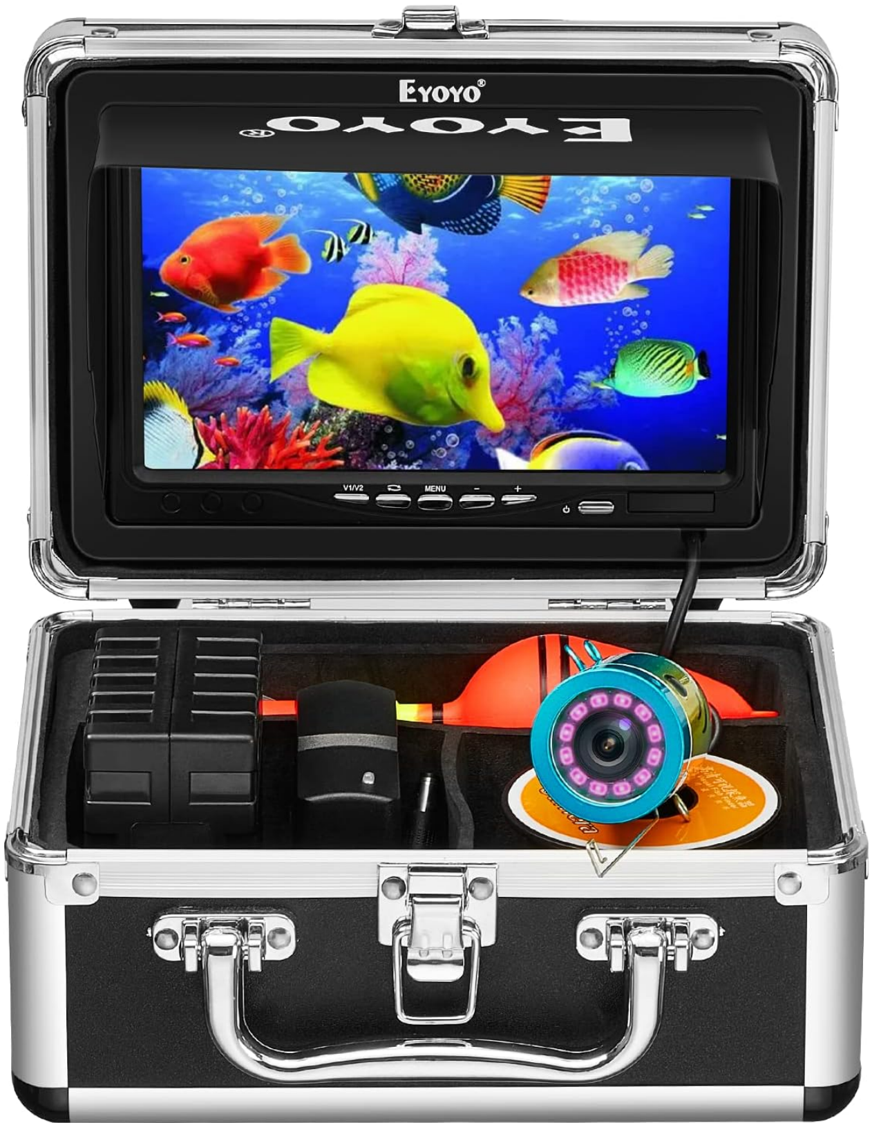
Figure 1: Complete Eyoyo EF07A Underwater Fishing Camera System kit.