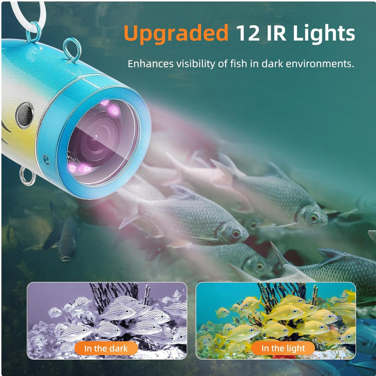
Figure 5: Visual comparison of camera view with IR lights off (colorful) and on (black and white).