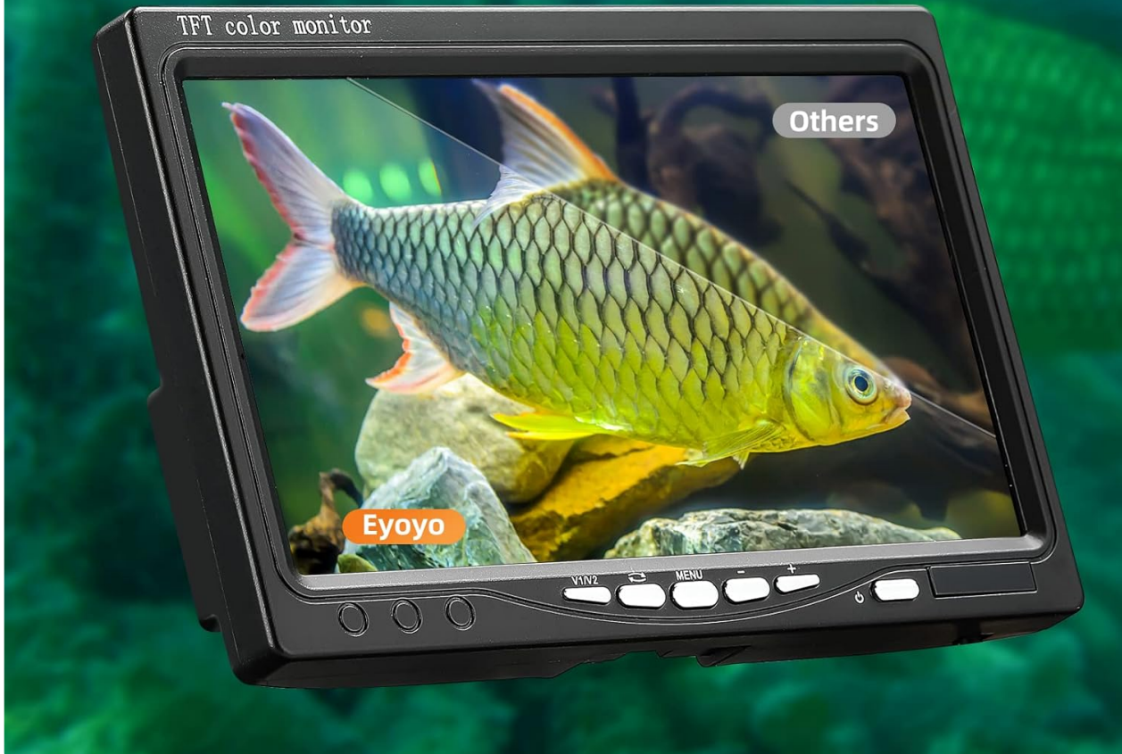
Figure 2: The 7-inch portable LCD monitor with key display features.