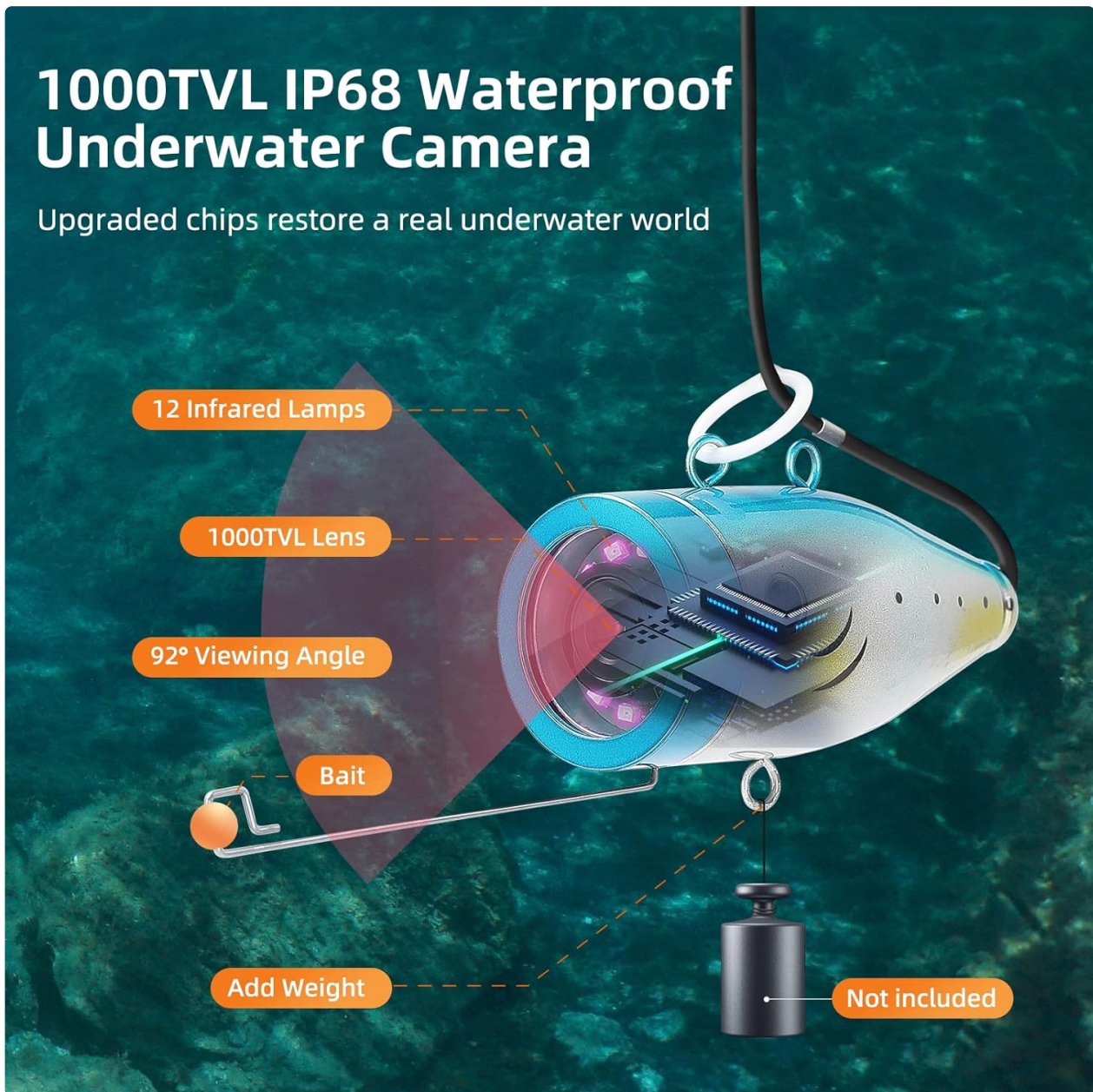
Figure 4: Details of the 1000TVL waterproof camera and its components.